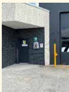
Ambulance Victoria 33 Willis Street