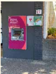
Bendigo Bank 11 Main Street