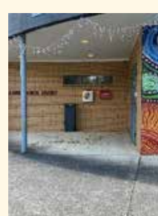
Hesse Rural Health 8 Gosney Street