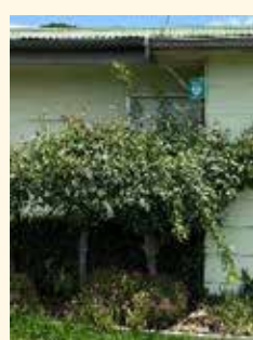
Winchelsea Golf Club 13 Anderson Street