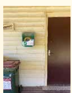
Wurdale Memorial Hall 220 Wurdale Road