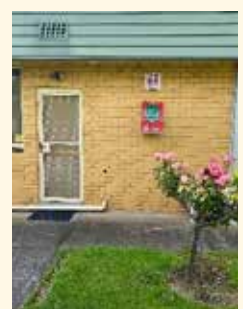
Senior Citizens 36 Harding Street