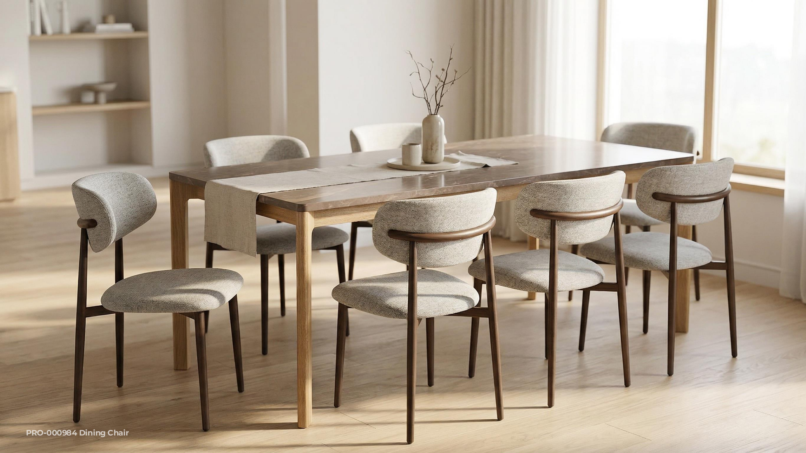
PRO-000984 Dining Chair