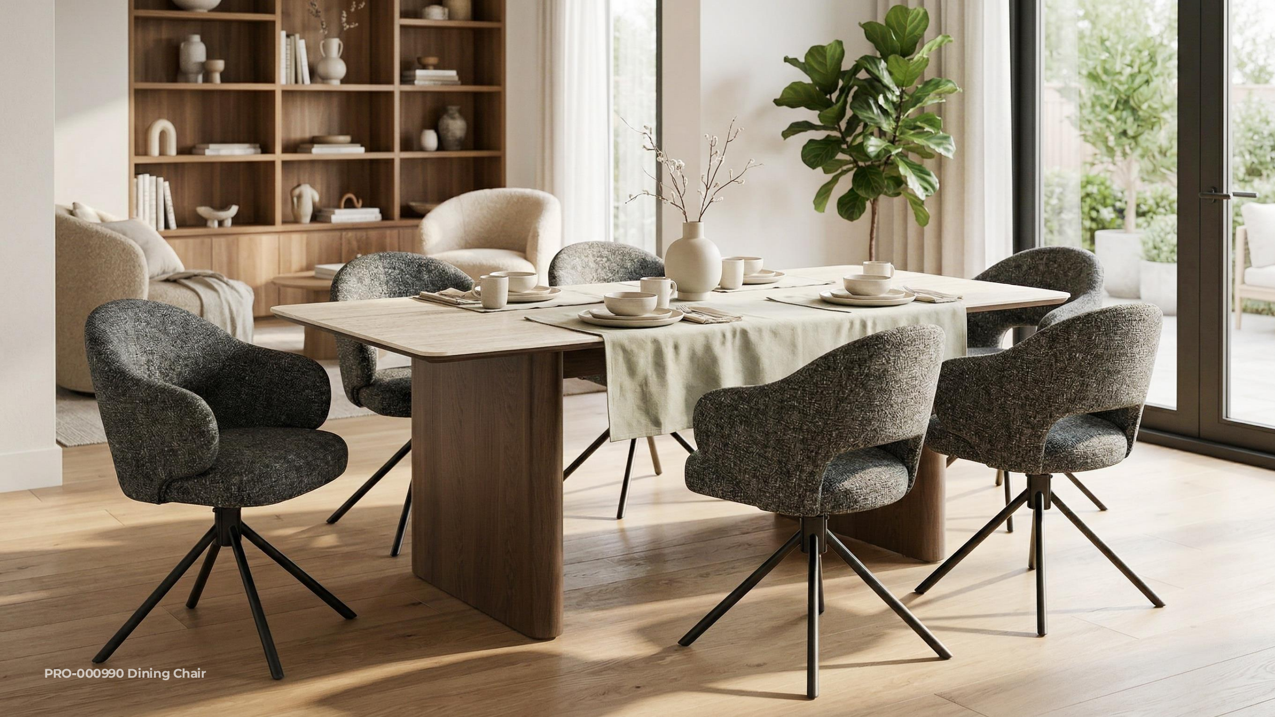
PRO-000990 Dining Chair