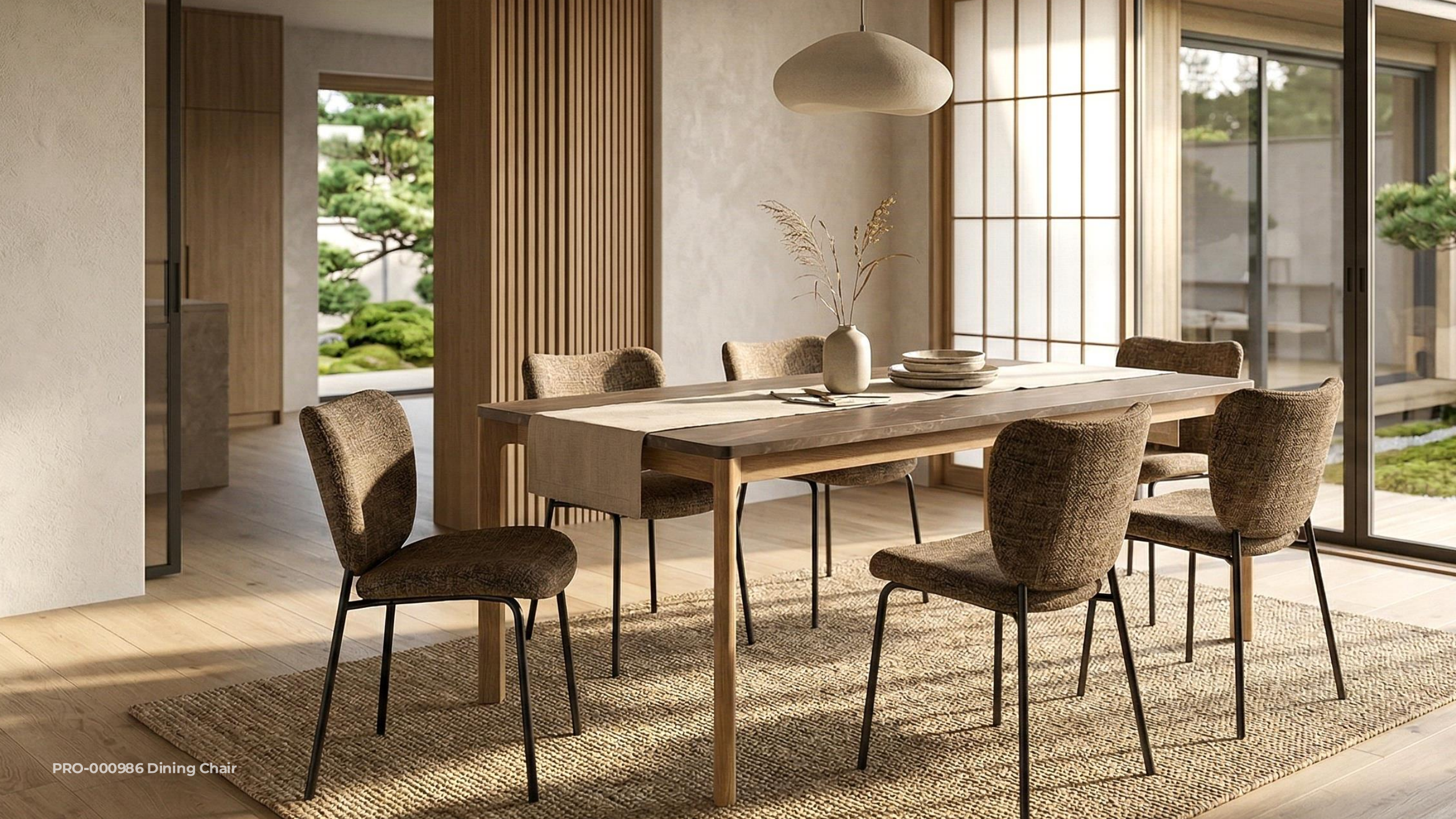
PRO-000986 Dining Chair