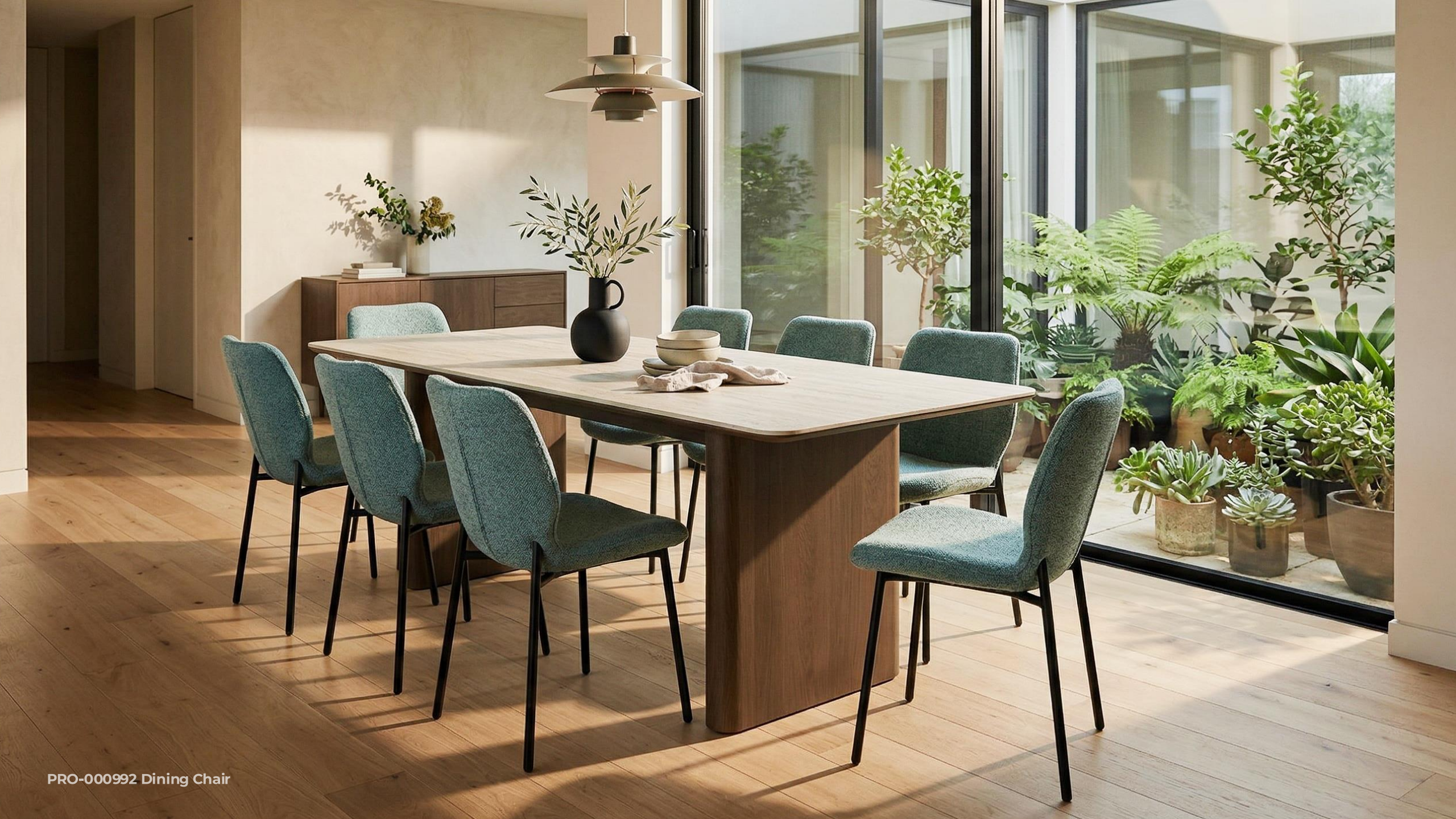
PRO-000992 Dining Chair