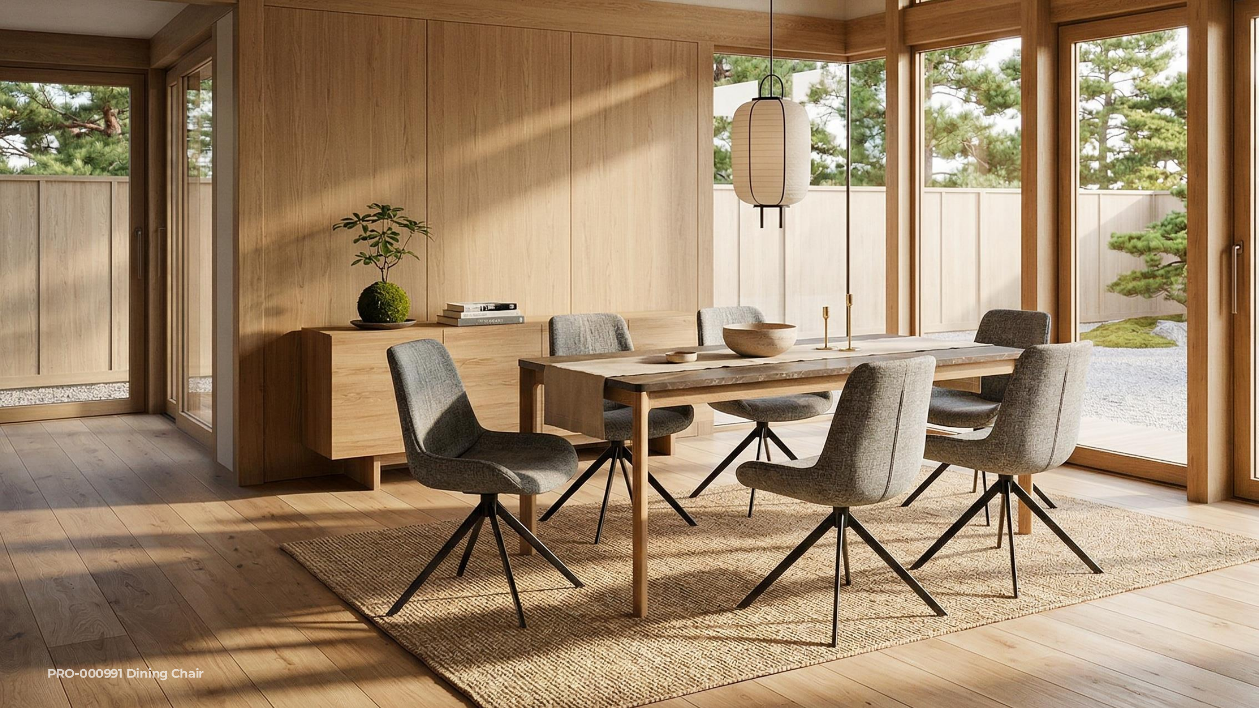
PRO-000991 Dining Chair