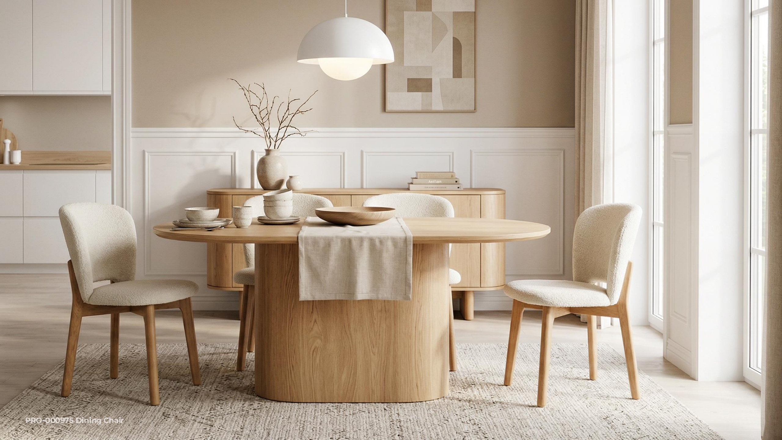
PRO-000975 Dining Chair