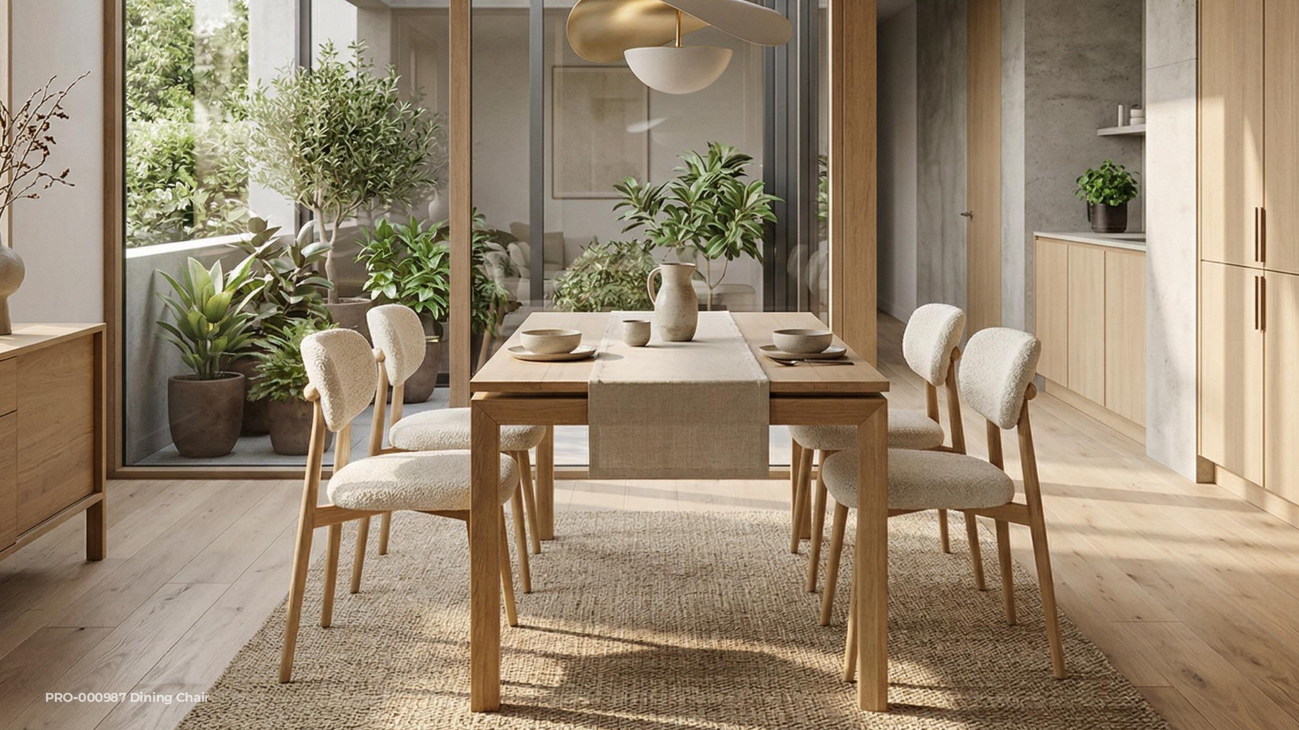
PRO-000987 Dining Chair