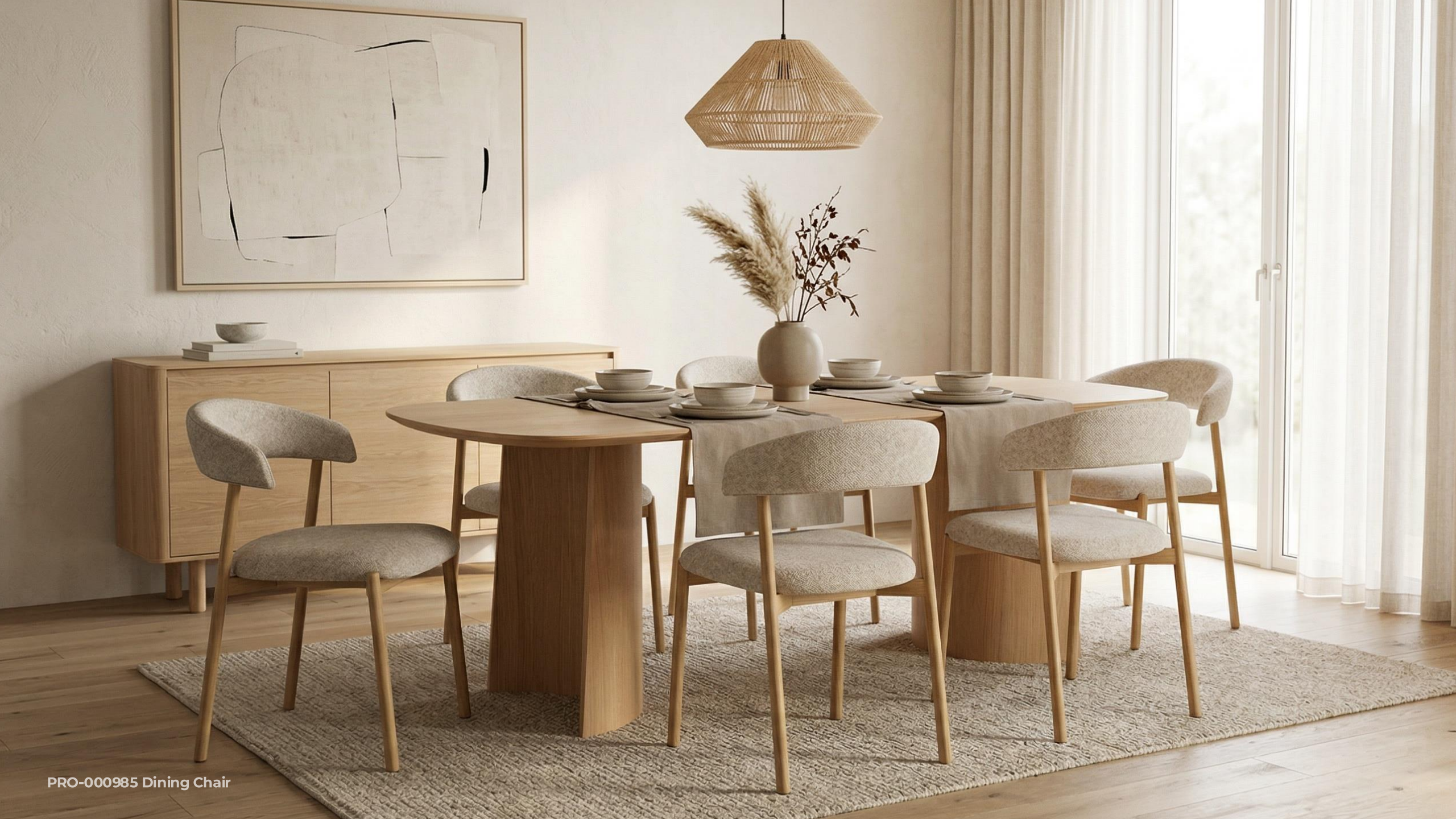
PRO-000985 Dining Chair