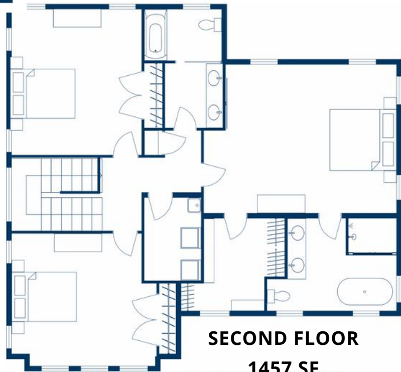
SECOND FLOOR 1457 SF

Disclaimer: Photos are digitally enhanced and may include virtual staging to illustrate potential. Furniture, décor, and landscape lighting are not included. All dimensions are approximate. Mortgage estimates are based on prevailing market rates for qualified buyers and subject to change. Marketed by Stephen O'Leary, Licensed MA Real Estate Broker. Broker is related to Seller.