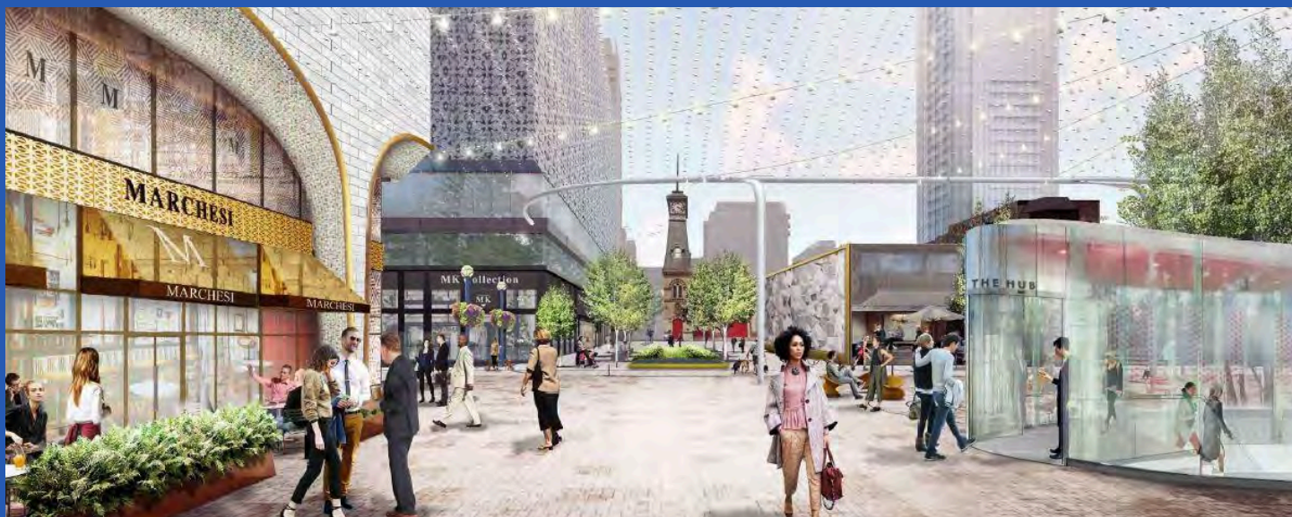
Advocating for beautiful public space in Yorkville