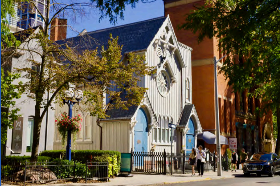
The Heliconian Club, established in 1926, celebrates 100 years of being a cultural fixture on Hazelton Avenue.