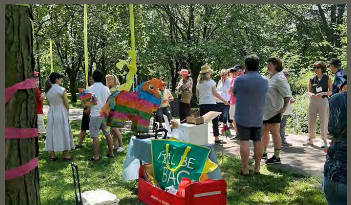
Celebrating ABCRA's 65th Anniversary in Ramsden Park