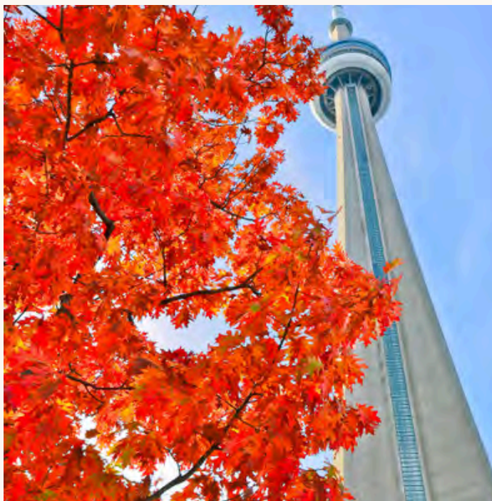
An autumn tree at the CN Tower

ABC Residents Association continues to champion this vision: examples include a 50 foot tree planned for York Square, a 35 foot tree planned for the Tribute Development at Avenue Road and Davenport and larger caliper trees where sidewalk space allows it.