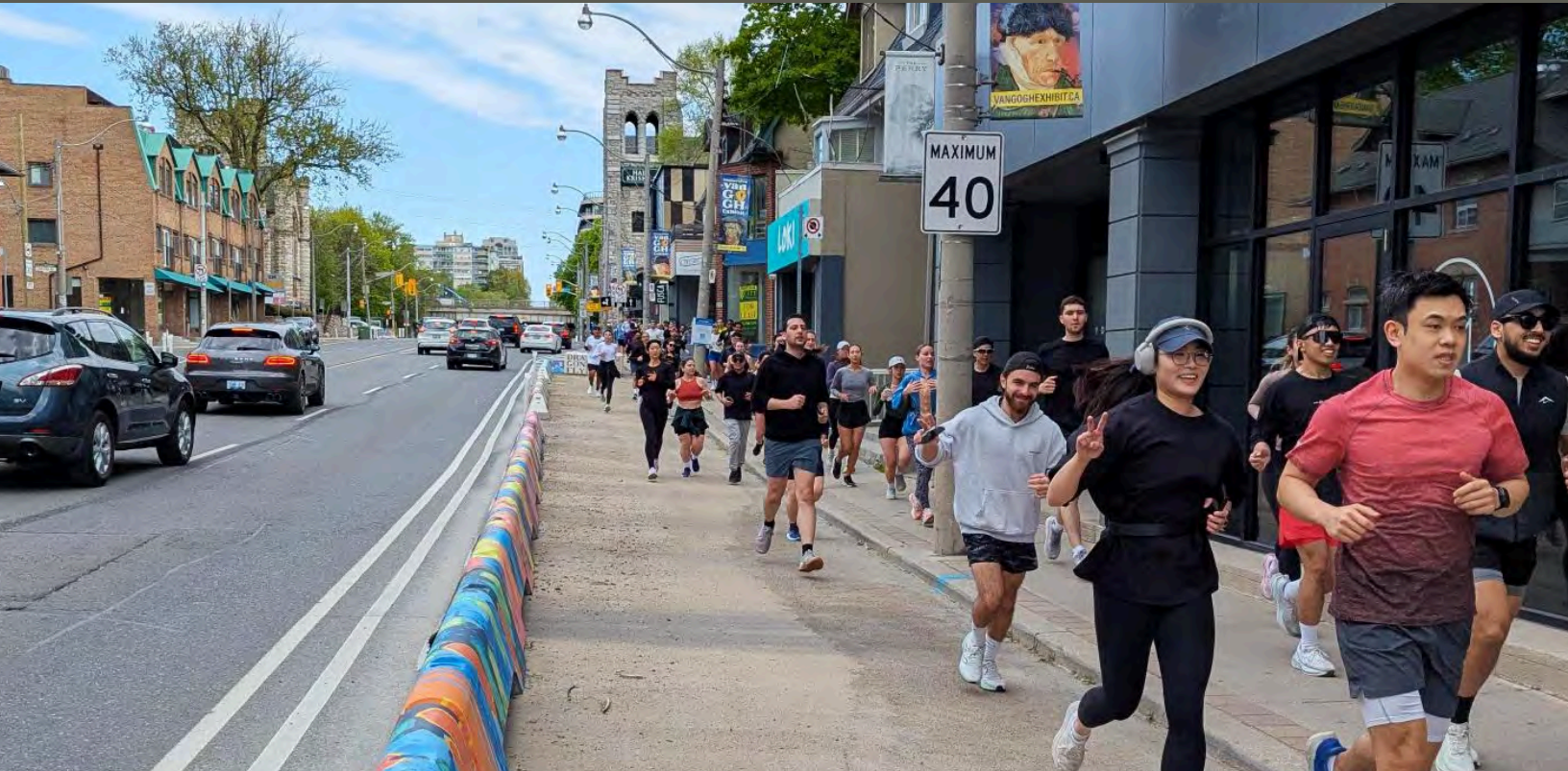
Wider sidewalks make room for runners on Avenue Road. A street for people not just traffic.