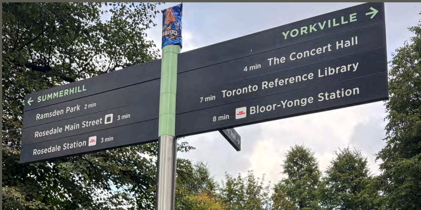
Our walkable neighbourhood