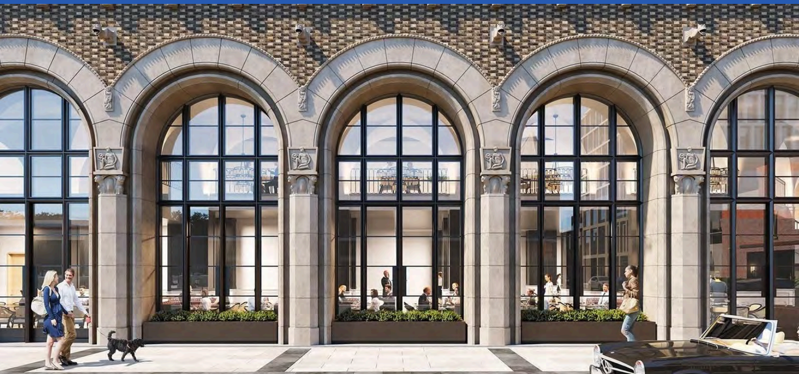
Heritage windows to be restored at 1140 Yonge Street (Staples site)