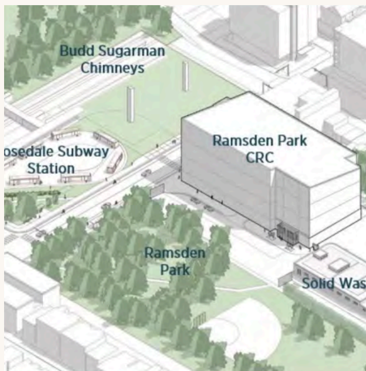
Location of the new community centre