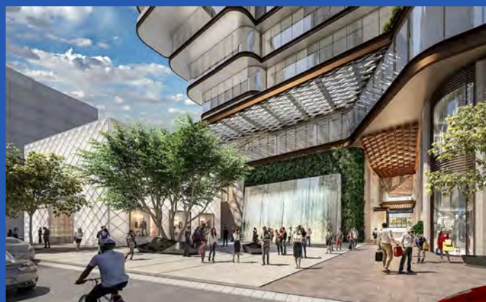
Design concept for York Square 33 Avenue Road

“ Development should do more than fill land it should bring people together and connect city life with nature. ”