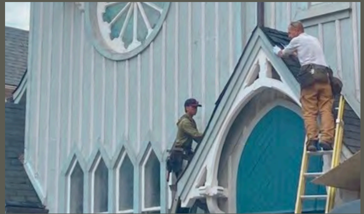
ABC helped fund the roof replacement at the Heliconian