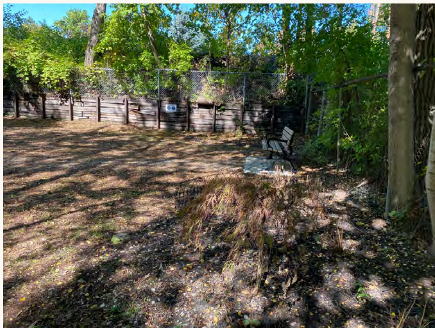
Marlborough Parkette unsafe trees needing maintenance.