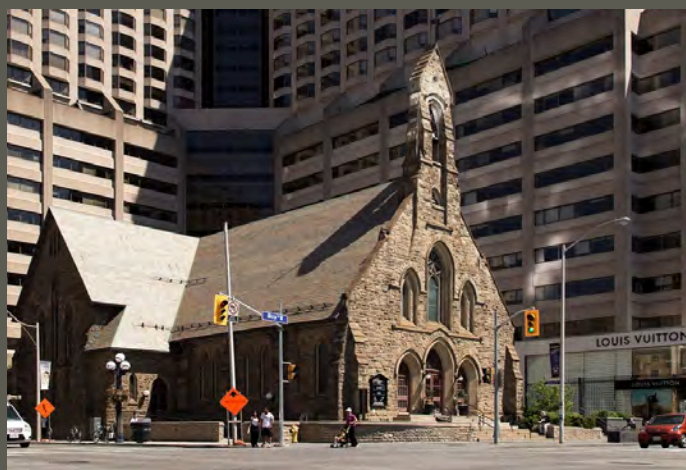
ABCRA Community Fund supported the Common Table Community Outreach Program at the Church of the Redeemer

Executive Director of St Clare's Housing at the opening of the Nancy & Ed Jackman Performance Centre