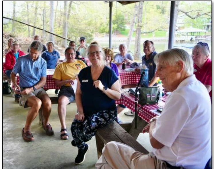
The picnic shelter was packed.