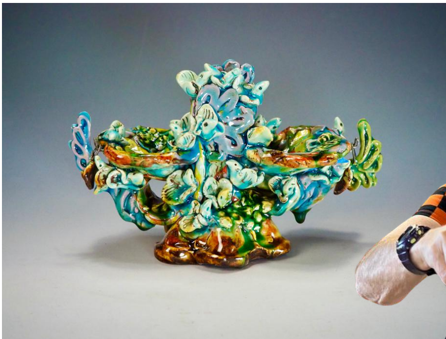
Lisa Orr, Salt and Pepper Centerpiece

Lisa Orr has been a studio potter for over 40 years. Orr's ceramics lushly blend historical, functional roots with organic, fluid forms that embrace gentle asymmetry. Inspired by nature and intuition, her richly textured and colorfully glazed slip-cast surfaces evoke birds on the wing, coral reefs, and blooming flowers, resulting in work that is vibrant, emotional, and assured. Currently refining an accessible smokeless wood kiln, she also teaches, lectures, and shows nationally and internationally. Her work has been placed in many public and private collections.