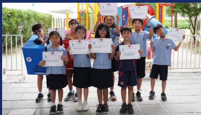
STAR OF THE WEEK 1ST NOVEMBER 2024