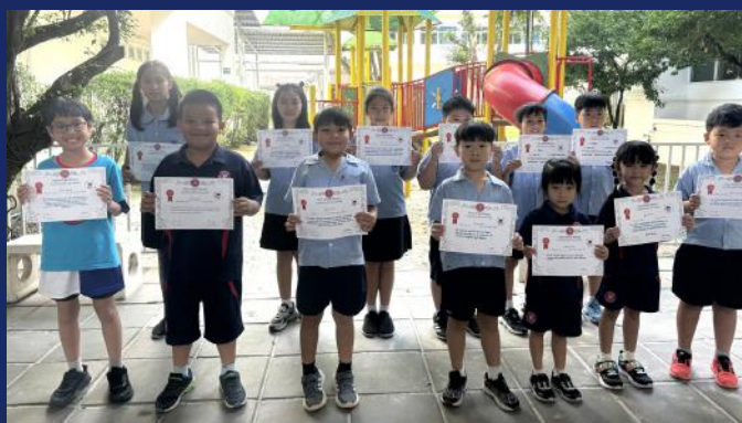
STAR OF THE WEEK 25TH OCTOBER 2024