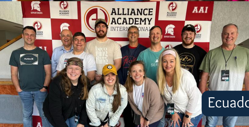
Ecuador Mission Team - 2022