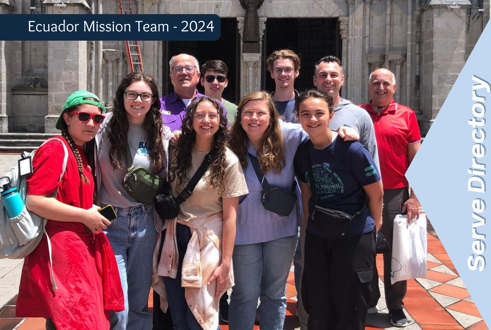
Ecuador Mission Team - 2024