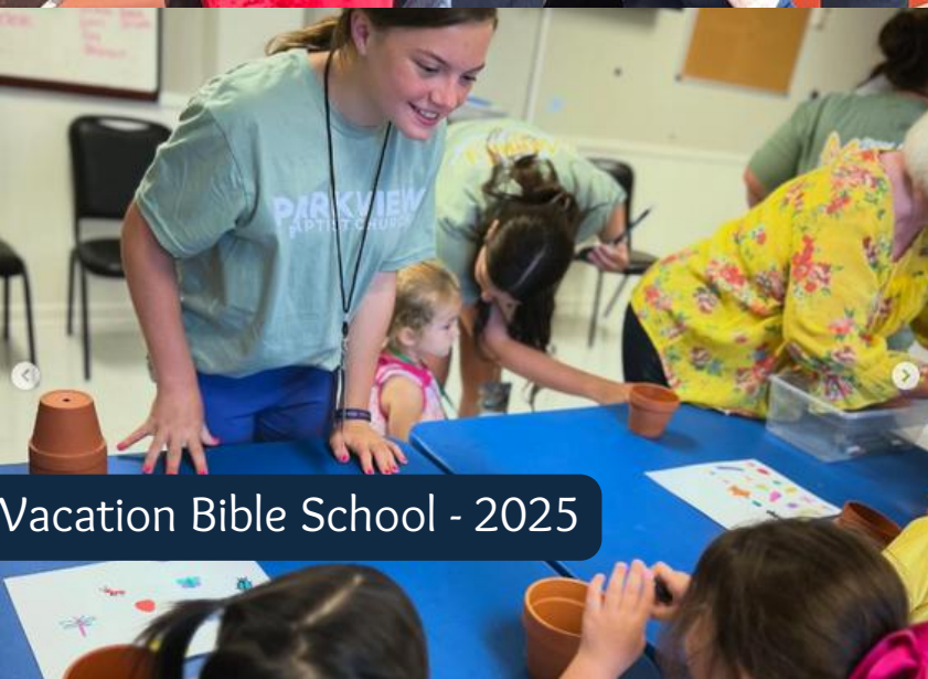
Vacation Bible School - 2025