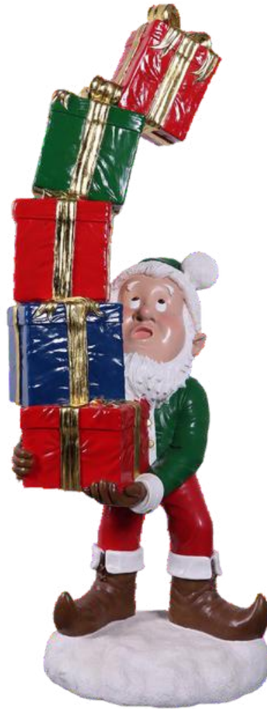
XN4239 70" HT