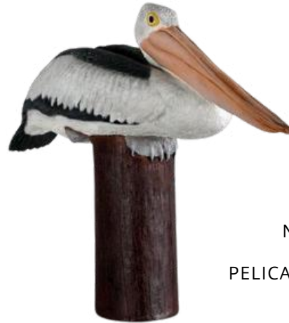
N4299 29" PELICAN ON POST