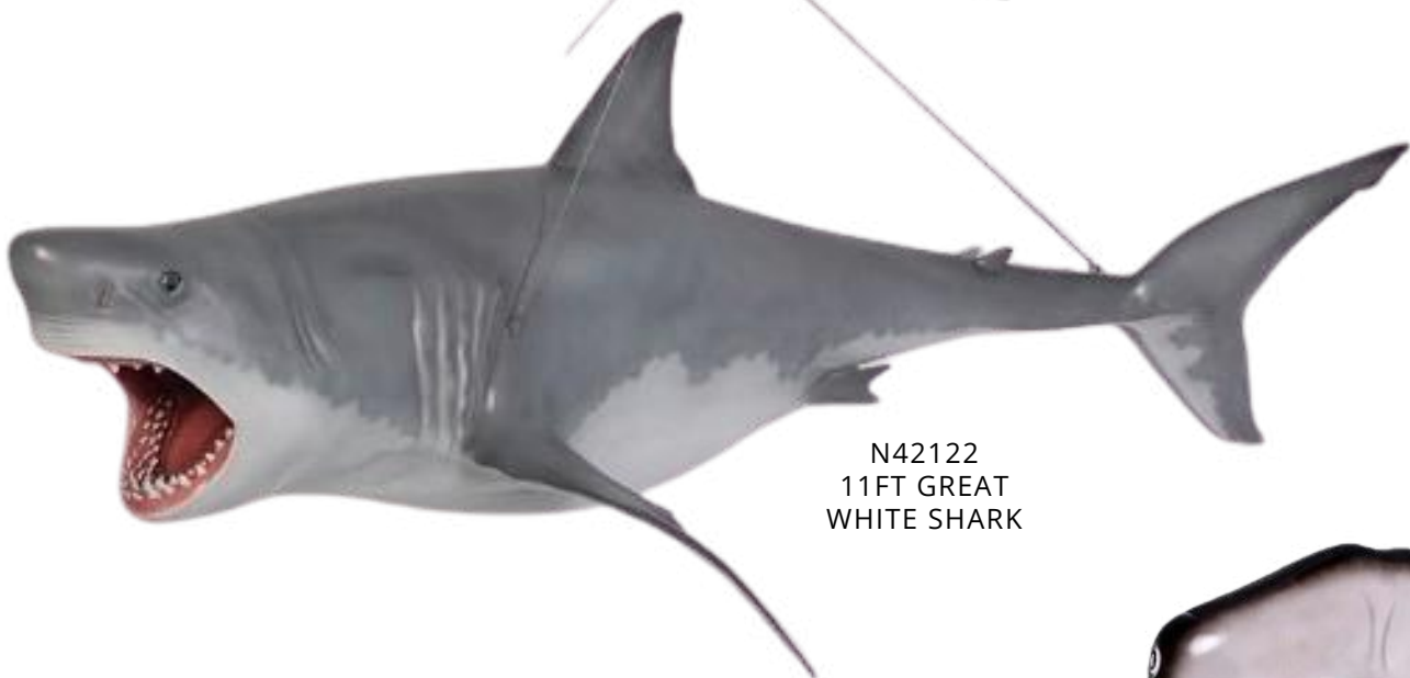
N42122 11FT GREAT WHITE SHARK