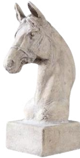
N42110 10" SM HORSE HEAD