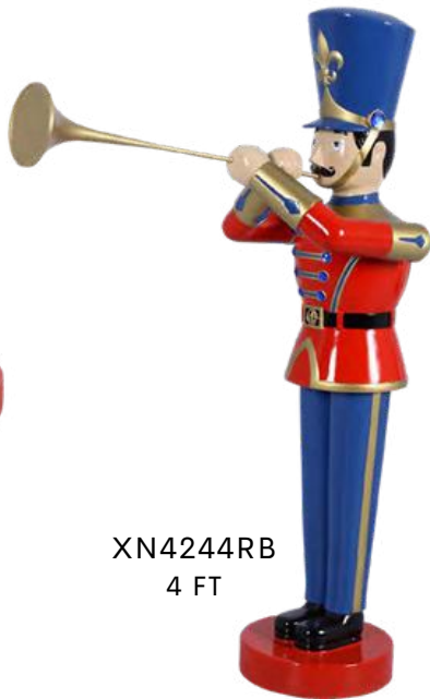
XN4244RB 4 FT