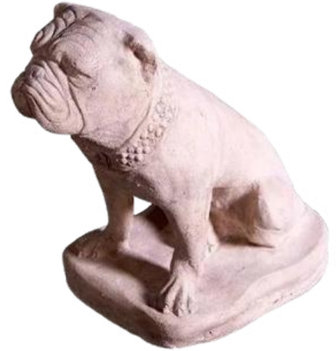
N4294 20" BULLDOG