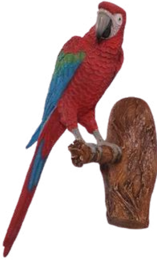
N42106 26" PARROT WALL DECOR