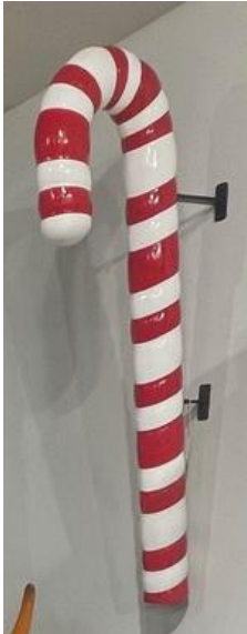
XN4222 4FT HANGING