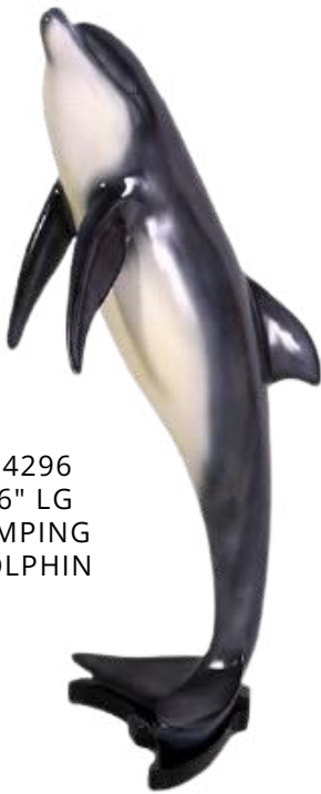
N4296 46" LG JUMPING DOLPHIN