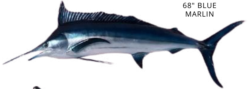
N42105 68" BLUE MARLIN