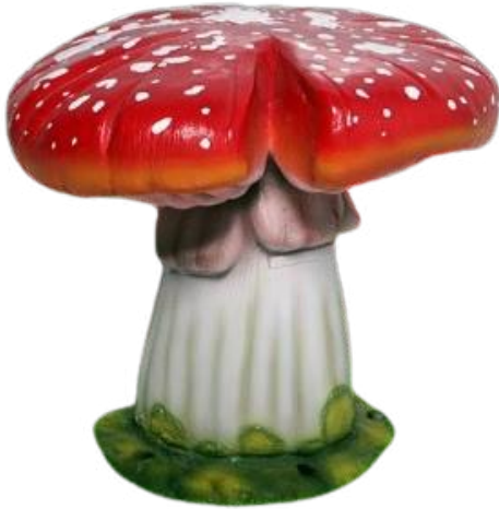
N42108 20" SEAT