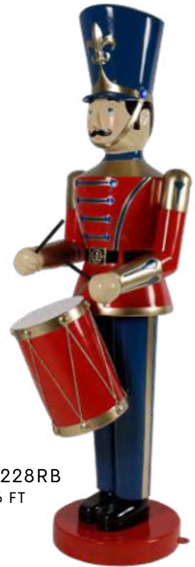
XN4228RB 6 FT