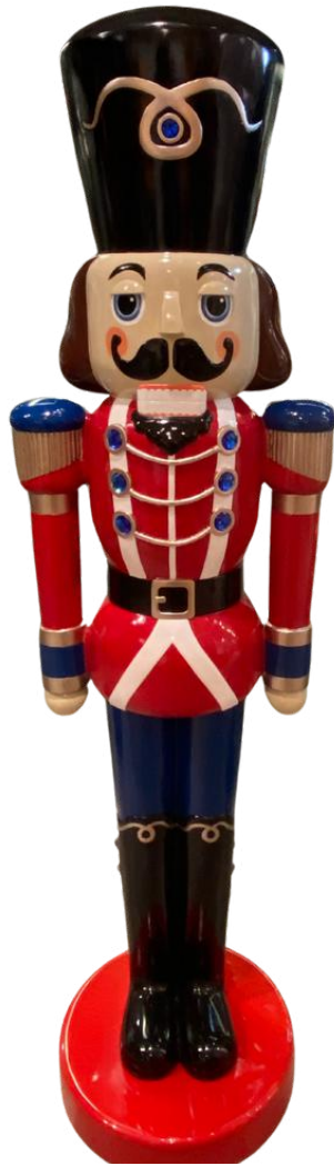
XN4218RB 6 FT