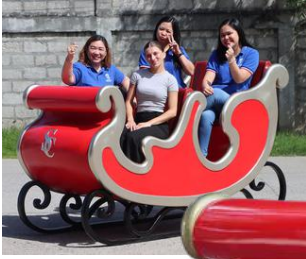
FULL SIZE SLEIGH