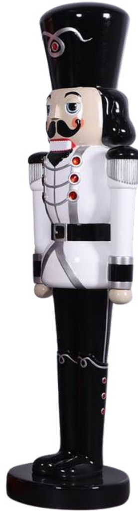
XN4218WSB 6 FT