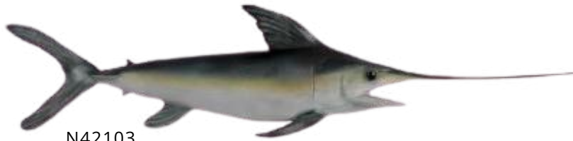
N42103 58" BROADBILL SWORDFISH