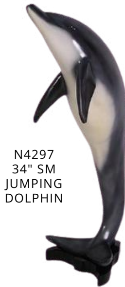
N4297 34" SM JUMPING DOLPHIN