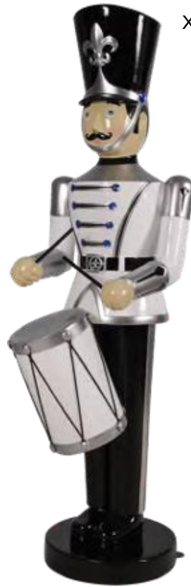
XN4228WSB 6 FT