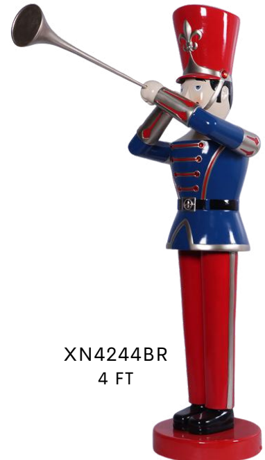
XN4244BR 4 FT