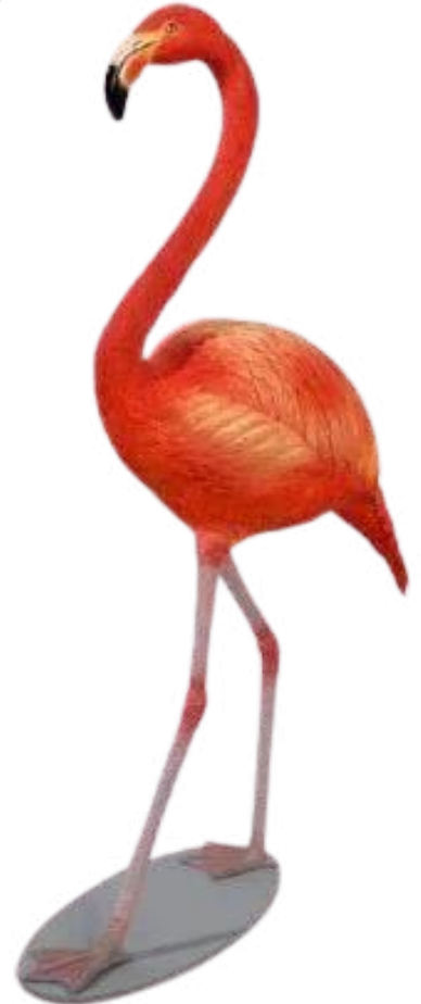
N42104 39" H FLAMINGO