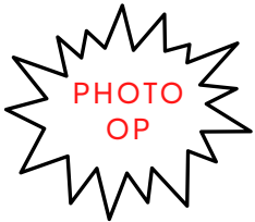
XN42131 59" HT