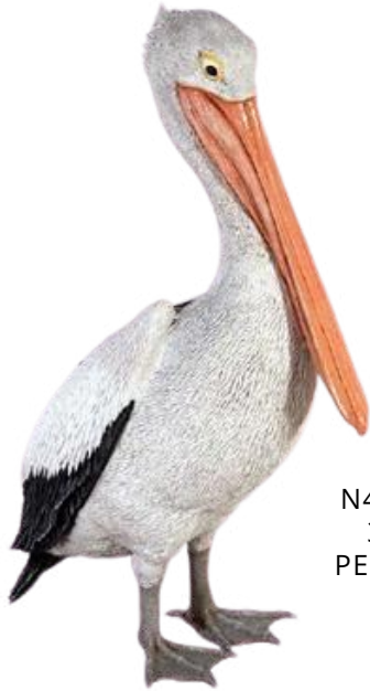
N42102 34" PELICAN