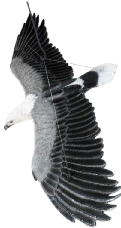
N42118 74" WHITE BREASTED SEA EAGLE