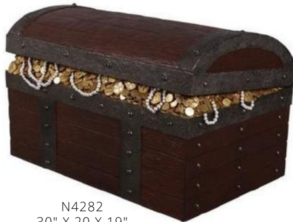
N4282 30" X 20 X 19" PIRATES WAR CHEST