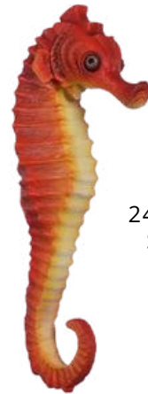
N4295 24" HANGING SEAHORSE