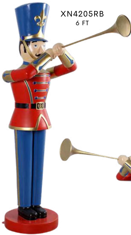
XN4205RB 6 FT