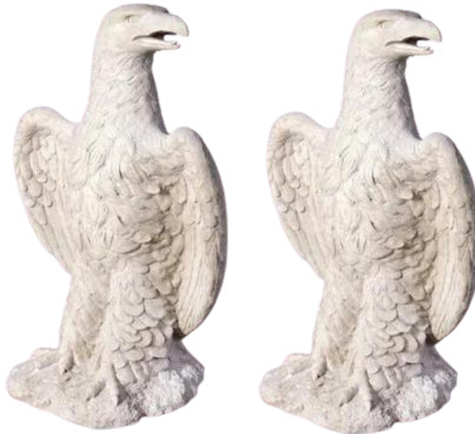
N42114 35" GUARDIAN EAGLE SET OF 2