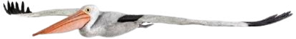
N42111 87" PELICAN FLYING