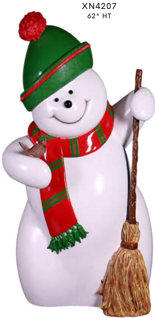
XN4207 62" HT