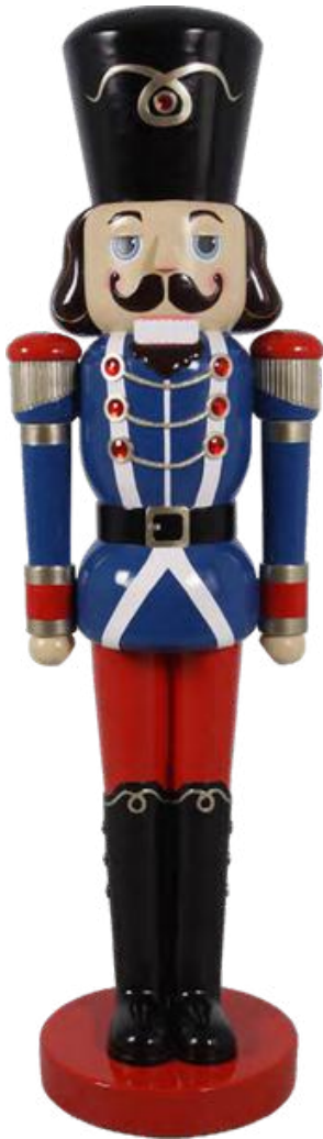
XN4218BR 6 FT