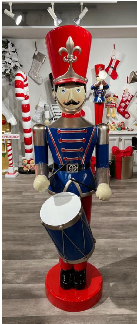
XN4228BR 6 FT