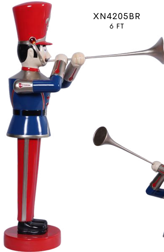
XN4205BR 6 FT