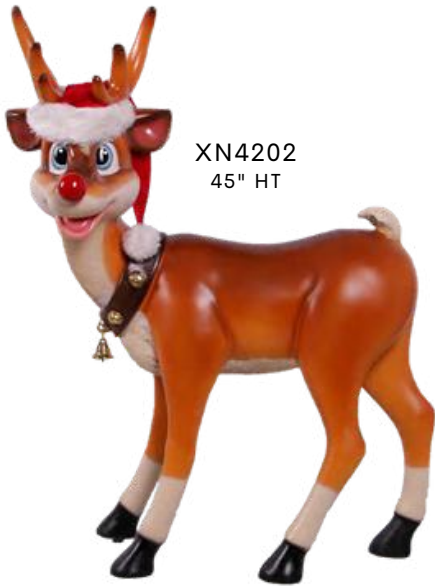
XN4202 45" HT