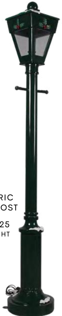
ELECTRIC LAMP POST