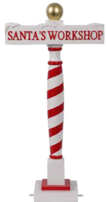
XN4233 35IN HT