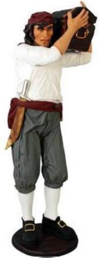
N4277 78" H TREASURE HUNTER