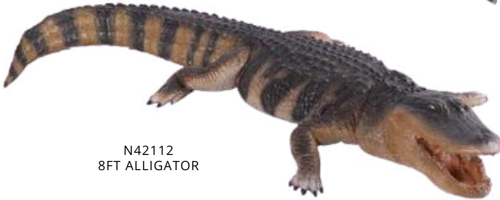
N42112 8FT ALLIGATOR