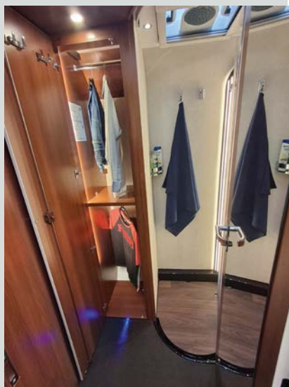
Two-level wardrobe alongside the shower