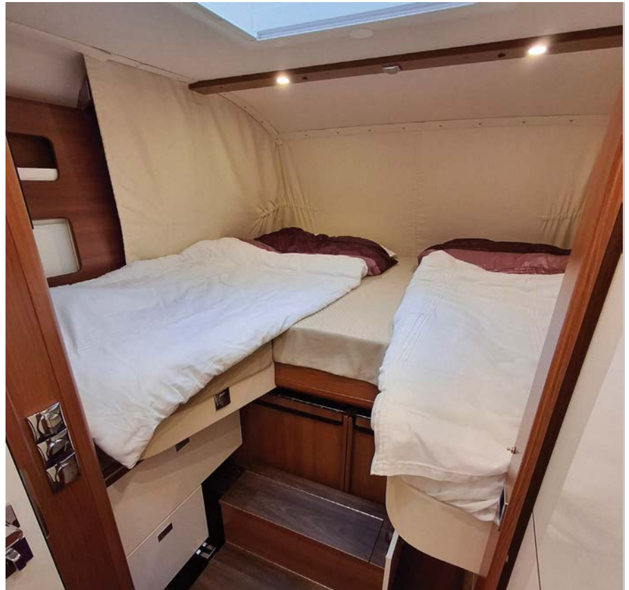
Where's the cab? Hidden away under those drop-down single beds

Aside from technological advances, though, the interior of the Liner-for-two remains much as before. There is no alternative to the Siena interior with Summer Chestnut furniture and contrasting high-gloss ivory elements. It all looks and feels very premium, with lots of chrome, too, but it would be nice to see a more contemporary option.