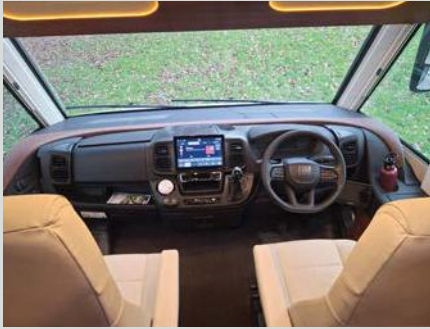
Sloping dashboard aids driver visibility