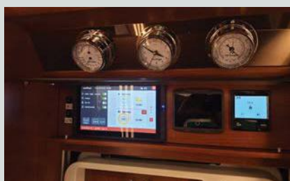
New control panel and ship's clocks