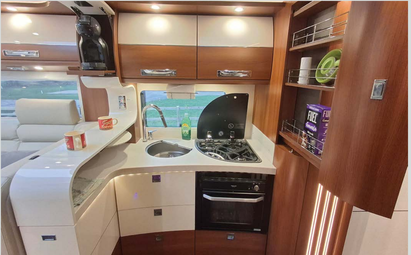
Clever storage makes good use of space in the kitchen but coffee machine and oven are extra-cost options

them) have soft-closing mechanisms and electric central locking (with a warning light). Then there are the options (of course) – a sensibly located Thetford Duplex oven/grill (£915) and a not-so-convenient Krups capsule coffee machine on a high-level slide-out plinth (£280).