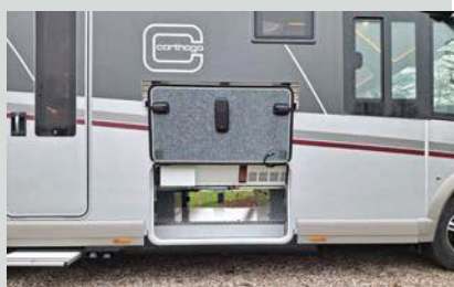
Double-floor storage across the full width

You'll certainly have no issues with sleeping comfort as the seven-zone cold foam mattresses sit on Carawinx springs. The beds are 1.88m and 1.96m long but actually feel slightly shorter as the angle of the windscreen at the head of the bed and walls at the foot reduce wiggle room. In fact, there's more space across the 'van – at shoulder level the conjoined berths are 2m across! Duvets can stay put when the beds are stowed but perhaps not pillows – I managed to blow a fuse!