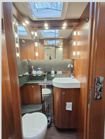
Backlit mirrors add bling in the washroom