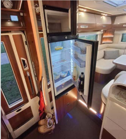
153-litre fridge and separate freezer