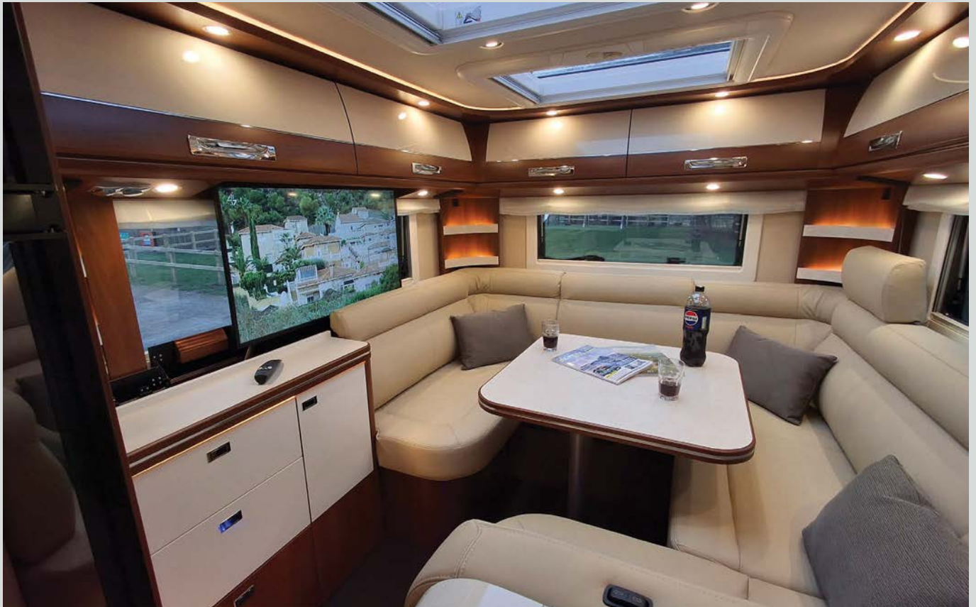
A lounge worthy of a luxury yacht, or an apartment! The 40in TV slides away behind the settee at the press of a button

Launched in 2018, the Liner-for-two has consistently been one of Carthago's most popular models in the UK, thanks to its spacious rear lounge which is so appealing to British buyers – and is so rare in a sector dominated by single bed, end bedroom layouts.