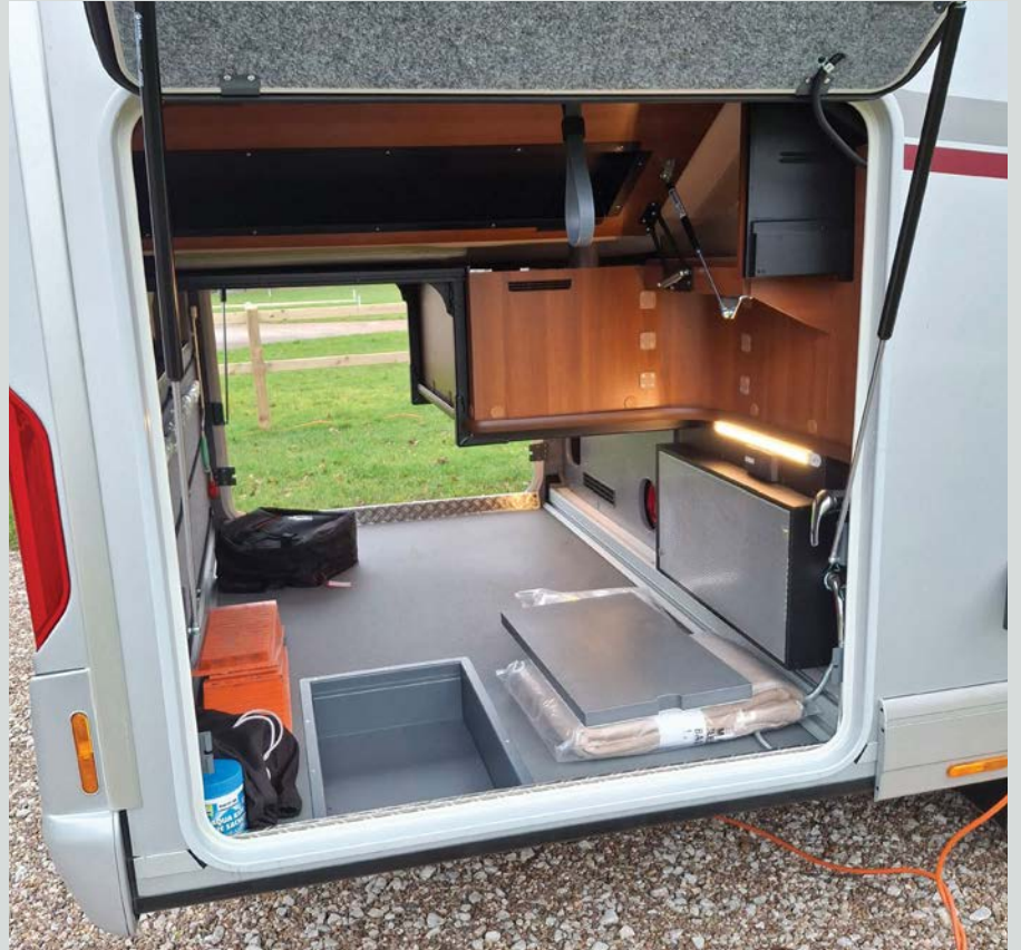
Pedelec system, with recess in the floor, allows bikes to be stowed in the garage

sparkling. An unladen weight of over 4.3 tonnes has to be remembered here and a 60mph cruise on the M6 Toll was comfortable and stable. Rattles only appeared on rough secondary roads – Carthago makes much of its Durafix screwed and mortised furniture.