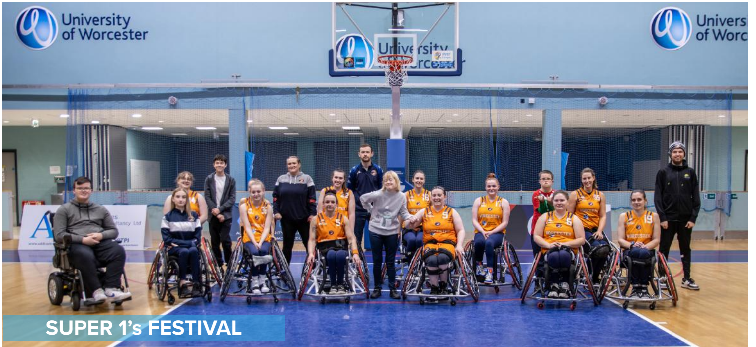
SUPER 1's FESTIVAL