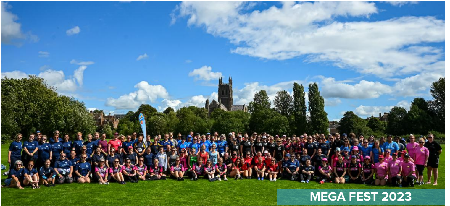
MEGA FEST 2023