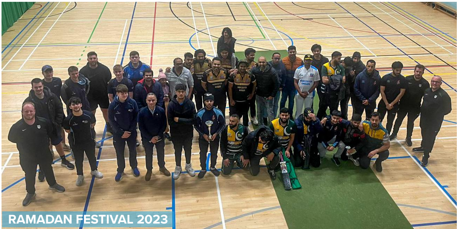
RAMADAN FESTIVAL 2023