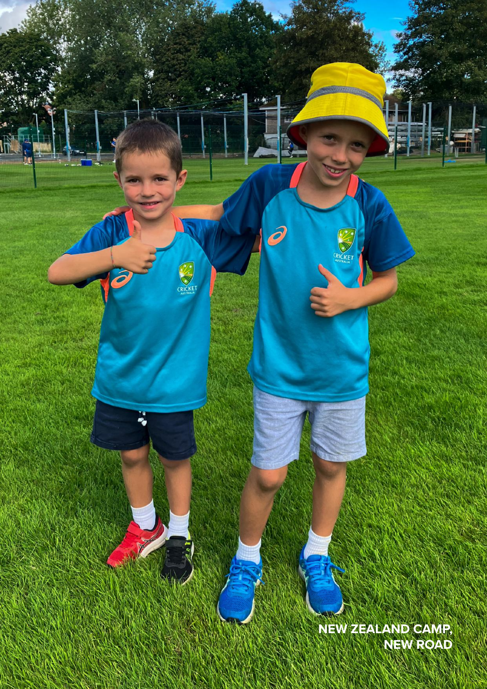
NEW ZEALAND CAMP, NEW ROAD