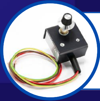
230v High Surge Quartz Lamp Phase Angle 3 Position Switched Regulator