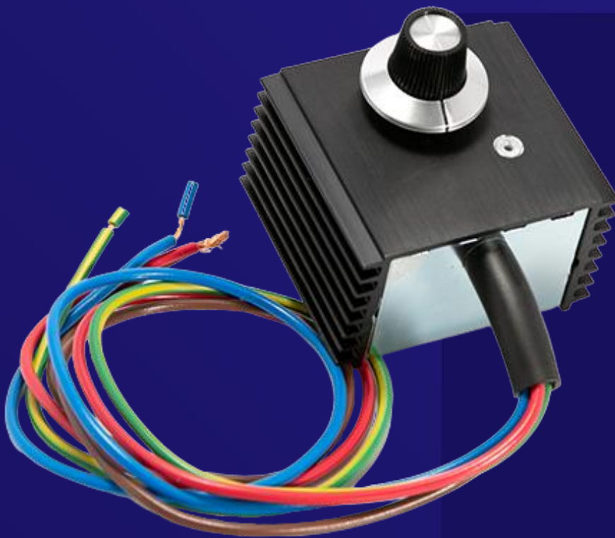
17A 230v Quartz Lamp Phase Angle Regulator 4kW New model SKU: A12217E