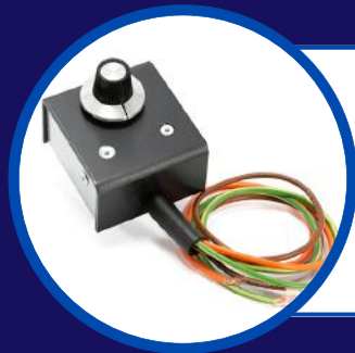
230v High Surge Quartz Lamp Phase Angle Switched Regulator