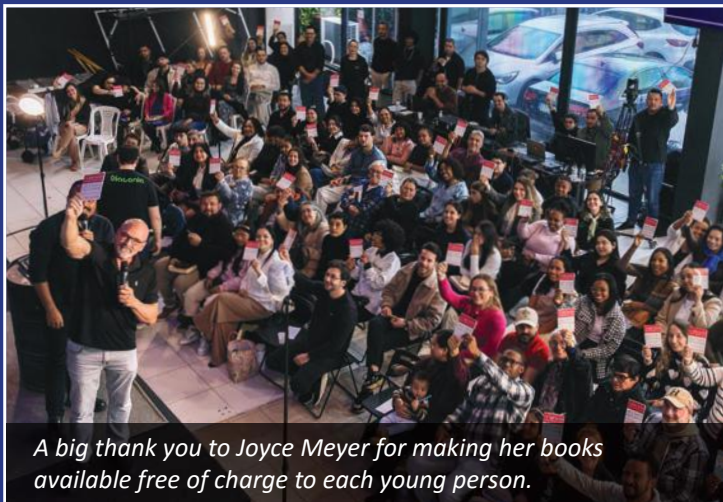
A big thank you to Joyce Meyer for making her books available free of charge to each young person.