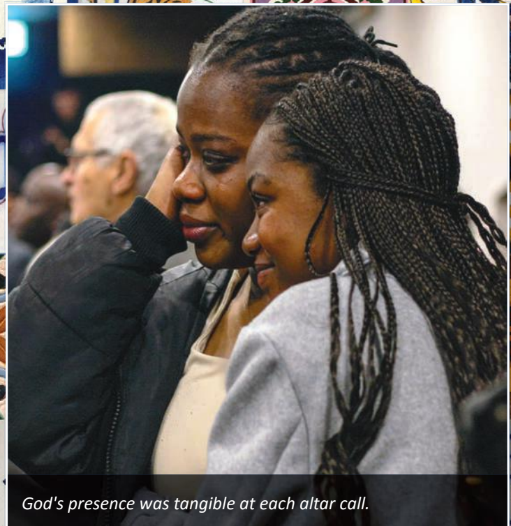
God's presence was tangible at each altar call.