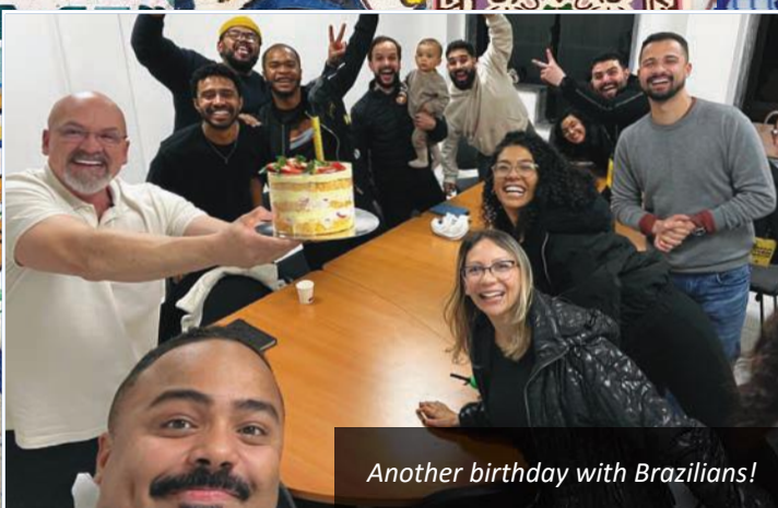
Another birthday with Brazilians!