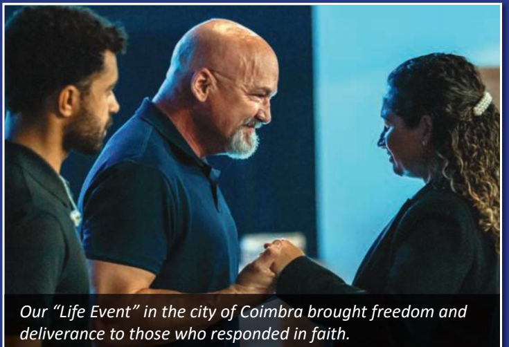
Our "Life Event" in the city of Coimbra brought freedom and deliverance to those who responded in faith.