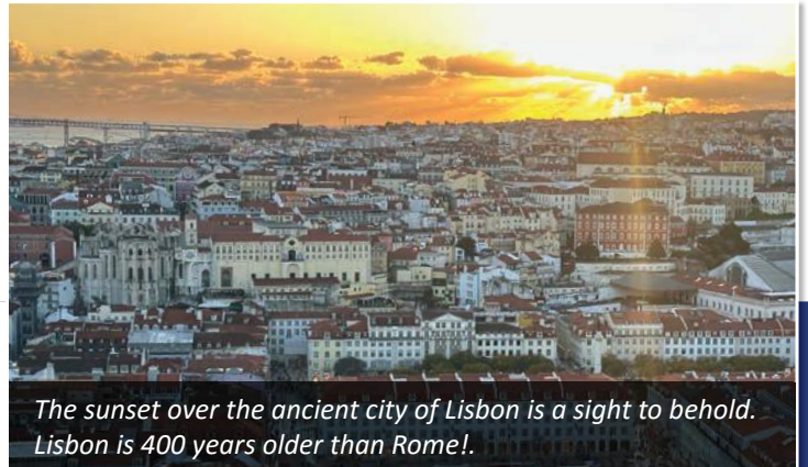
The sunset over the ancient city of Lisbon is a sight to behold. Lisbon is 400 years older than Rome!.

Brazil was the key that unlocked more doors of opportunity. It was a perfect scenario, having Luan and Levi travel with us around the nation. Not only are they a huge help, they provide lots of laughs as well! This time of this year the weather is normally wet and cold. This made any type of outdoor adventure problematic, but we didn't mind - the hearts of the churches and people that welcomed us were warm and inviting.