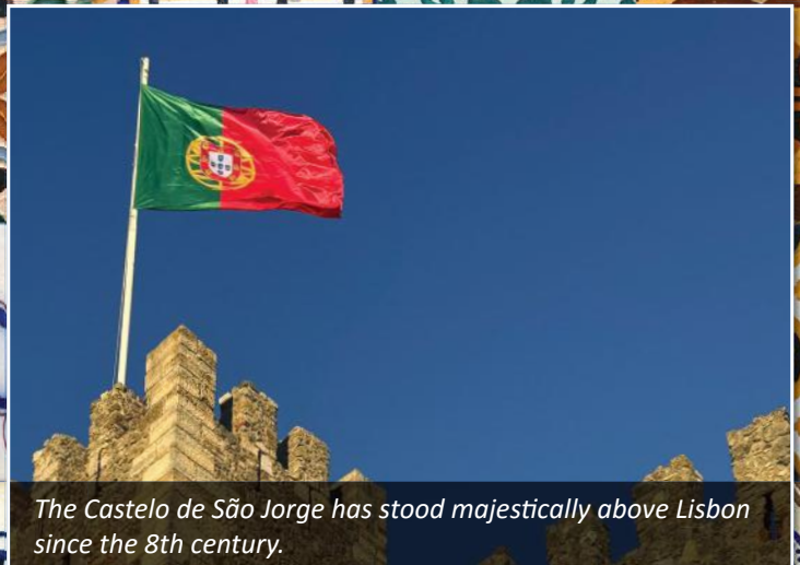
The Castelo de São Jorge has stood majestically above Lisbon since the 8th century.

We were able to have a Life Event on a Saturday night in Coimbra. The church was packed and the crowd sat speechless as the lies behind suicide were exposed and confronted. During the time of altar ministry, people came forward desperate for prayer and deliverance. As God’s presence began to move, tears and shouts of joy filled the auditorium. Life and freedom in Jesus replaced hopelessness and pain.