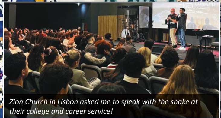
Zion Church in Lisbon asked me to speak with the snake at their college and career service!