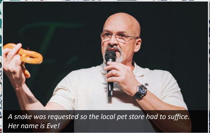
A snake was requested so the local pet store had to suffice. Her name is Eve!

A few hours later, we had a video chat and he had found a two foot corn snake at a local pet store. It was not exactly what I was looking for, but it provided the visual aide I needed and added a bit of mystery to my meetings! Each service was full of young and old, people raised in traditional churches, who desire a real relationship with God, longing to be free from the rules and regulations of religion. The sight of a man at a pulpit with a snake in his hand certainly helped tear down traditional walls and religious mindsets!