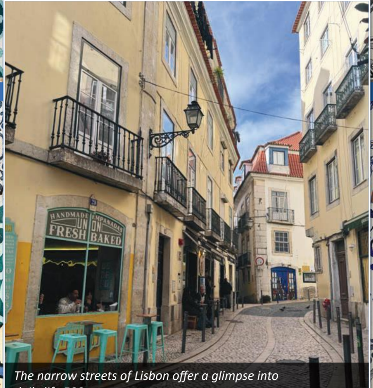
The narrow streets of Lisbon offer a glimpse into daily life 500 years ago.