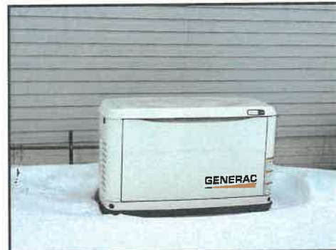
22K WH BACKUP HOME GENERATOR