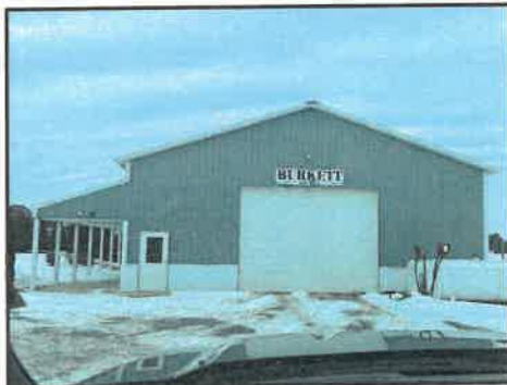
42x48 SHOP HEATED