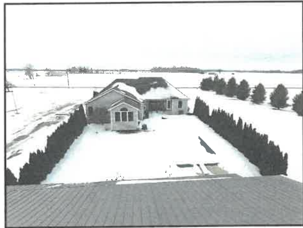
^ OVERHEAD VIEWS OF PROPERTY v