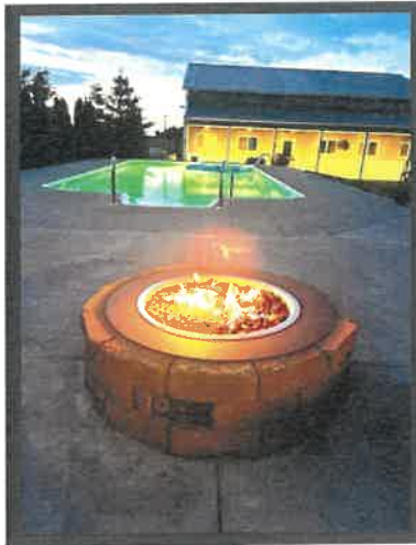
SUMMER TIME POOL AREA