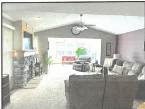
FAMILY ROOM VIEWS