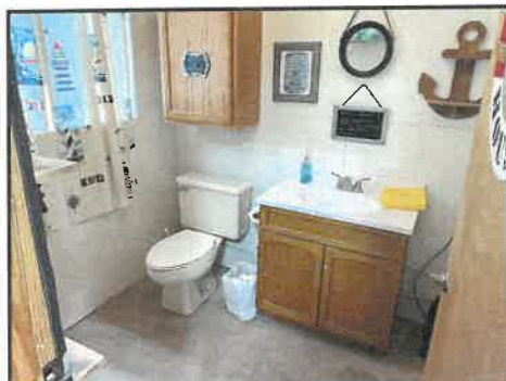
SHOP BATHROOM / POOL ACCESS