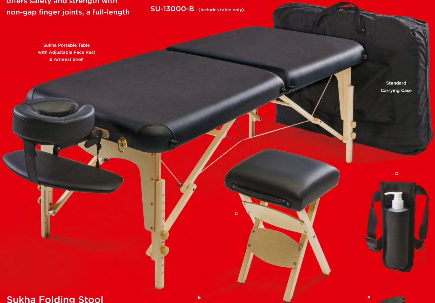
Sukha Portable Table with Adjustable Face Rest & Armrest Shelf