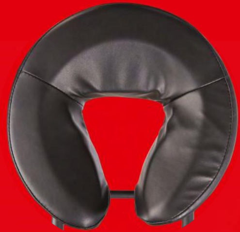
Ultra-Soft Face Rest Cushion & Aluminum Face Rest Platform

Adjustable angle and removable for supine treatments.