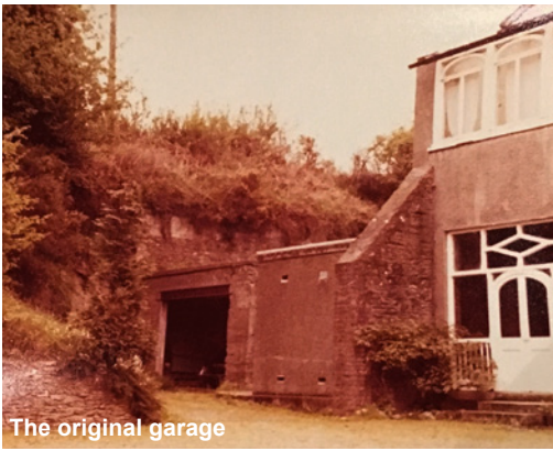
The original garage