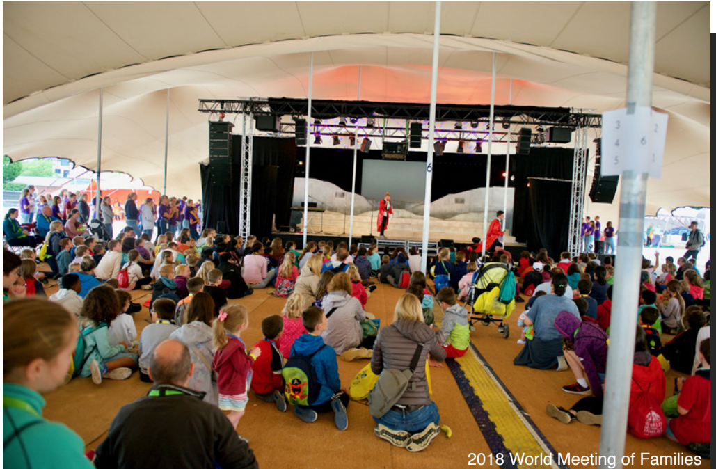
2018 World Meeting of Families