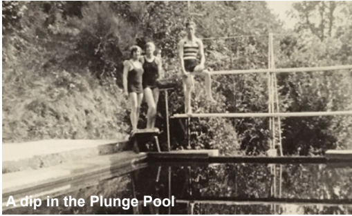
A dip in the Plunge Pool