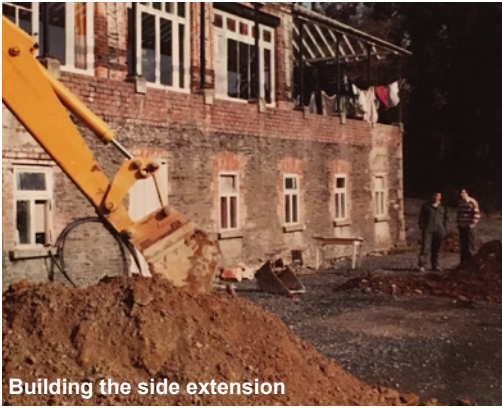
Building the side extension