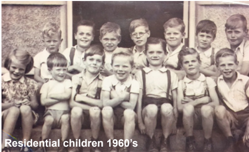
Residential children 1960's