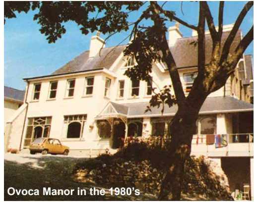
Ovoca Manor in the 1980's