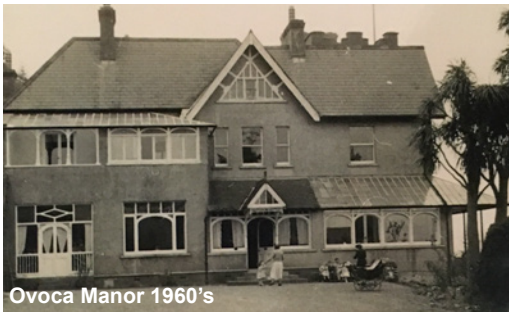
OvoCa Manor 1960's