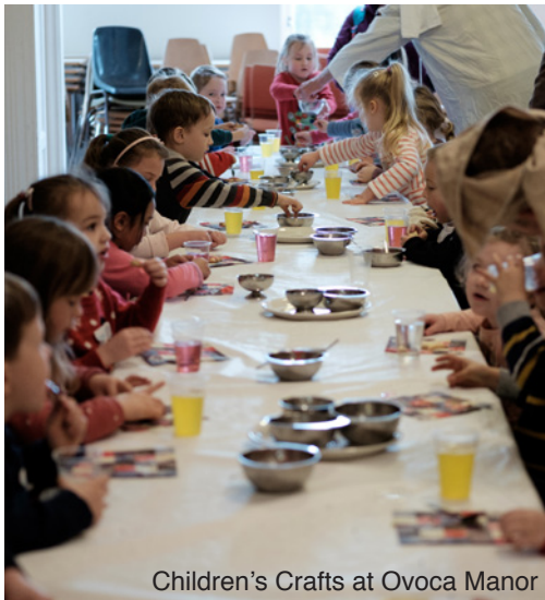
Children's Crafts at Ovoca Manor