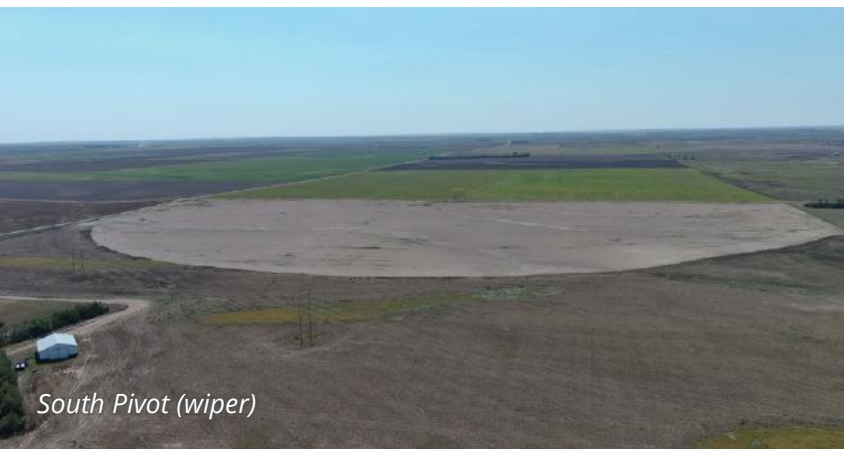
South Pivot (wiper)