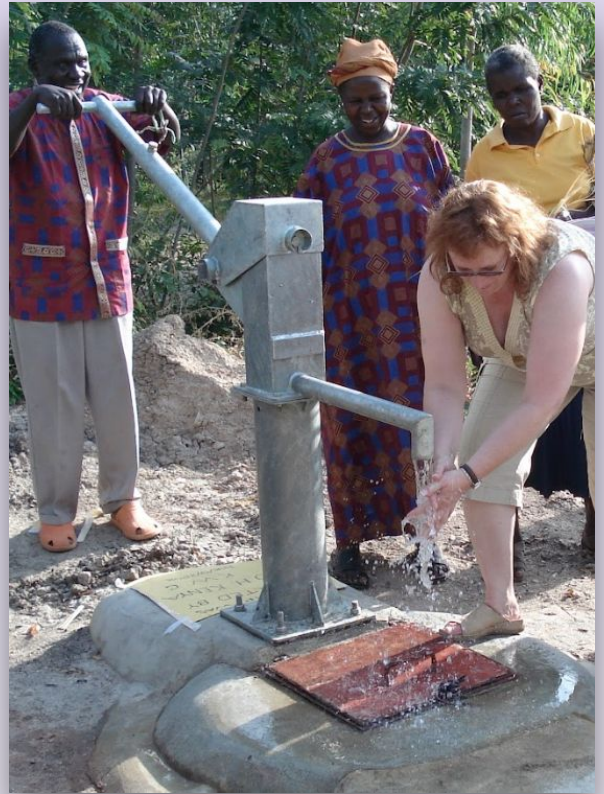
This is the type of well that will be built

P.S. Funds have been sent for building of a well in the Nyanagaguna Village and will be dedicated to "The Community of Lindberg Elementary School, Kenmore, NY, USA.