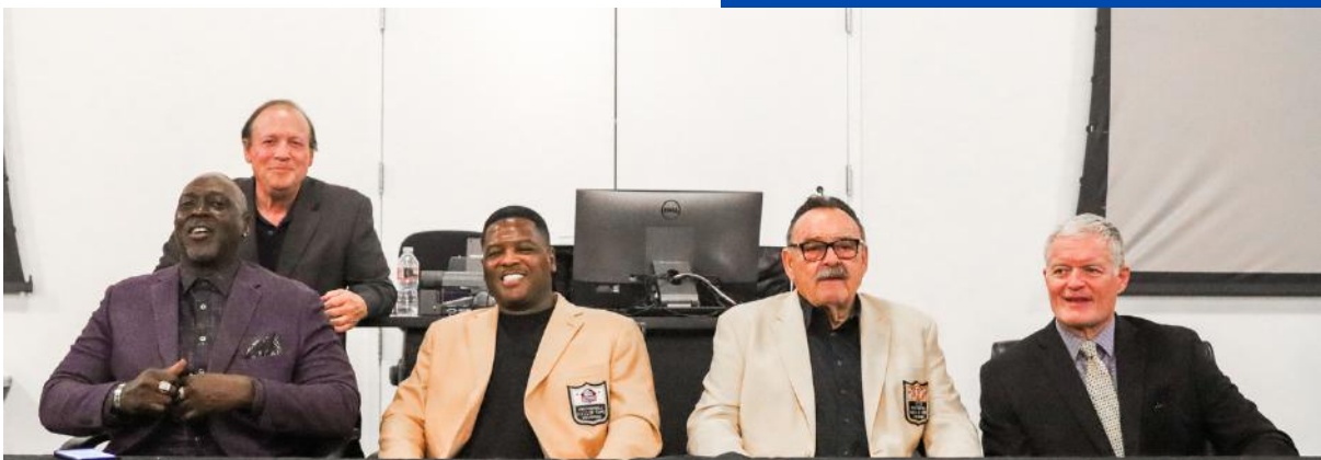
Ottis Anderson SB XV MVP 2x SB Champ