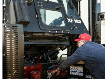
Easy Access to Drive Train & Hydraulics