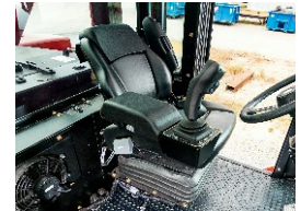
Fully Adjustable Mechanical Seat (Standard)