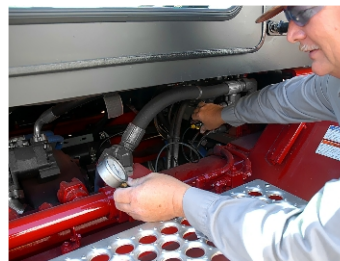
Service & Inspection from Ground Level