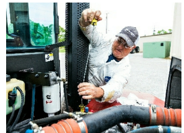
Easily Accessible Daily Checks