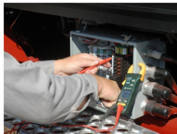
Heavy Duty Circuit Breakers/Reset Switches (Standard)