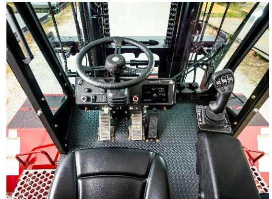
Fully Enclosed 2-Door Cab with Multiple Climate Control Configurations Available (featured cab is shown with available options)