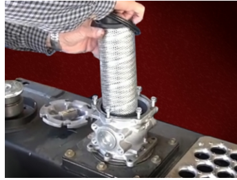
Spin-on Breather, Wire Mesh Strainer & Replaceable Internal Element (Standard)