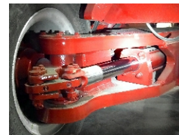
Industry's Toughest Steer Axle (Standard)