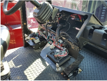
Flip-down Dash with Color/Number Coded Wiring (Standard)

Taylor Lift Trucks are designed with ease of maintenance and serviceability as a key priority. With today's engine and emissions requirements, daily maintenance checks and timely periodic service are the key to your equipment's longevity. All daily checks across the Taylor product line can be accessed from the ground or running board, ensuring that operators can complete these requirements with ease. Also, the sliding hood (on rollers), side service doors and 70 degree tilting cab open to expose the drive train and hydraulics to provide easy access for service and inspection.