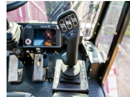
11 Button Command Joystick (Standard)