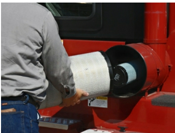
Donaldson Air Cleaner with Safety Element (Standard)