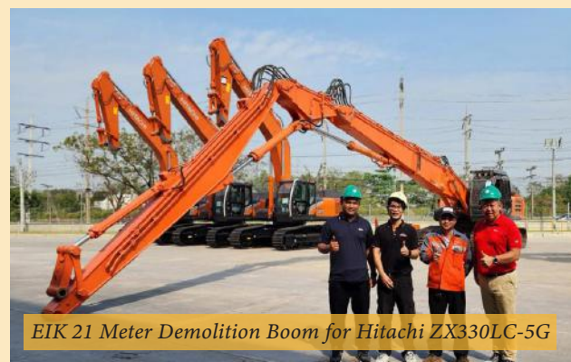
EIK 21 Meter Demolition Boom for Hitachi ZX330LC-5G

The precision of the demolition boom enables contractors to target specific sections of a building, facilitating partial demolitions or selective floor clearances for renovations or fit-outs. This capability is especially beneficial in confined urban spaces, such as downtown areas, where precision and control are paramount. The equipment's ability to be intricately positioned ensures that only the intended structure is dismantled, without affecting the surrounding structure.