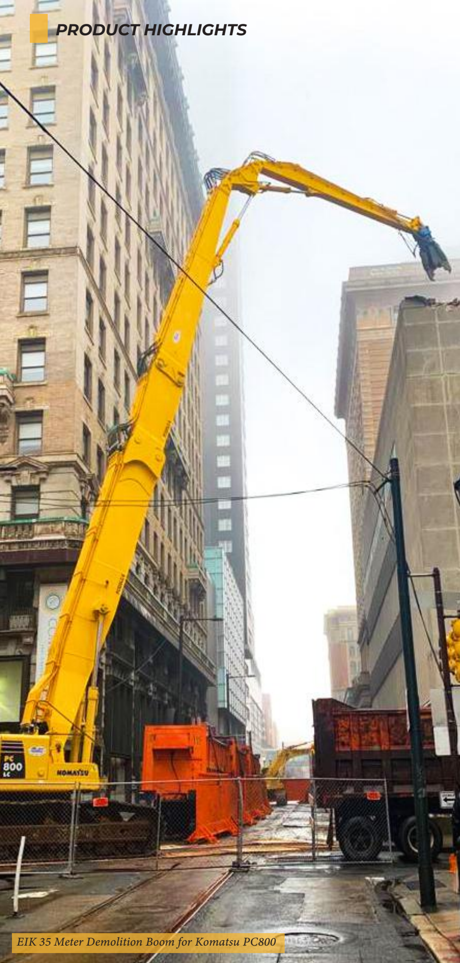
EIK 35 Meter Demolition Boom for Komatsu PC800

Successfully completed the installation and handover of the first Demolition Boom unit of 2024 for the ZX330LC-5G at the customer's factory earlier this year.