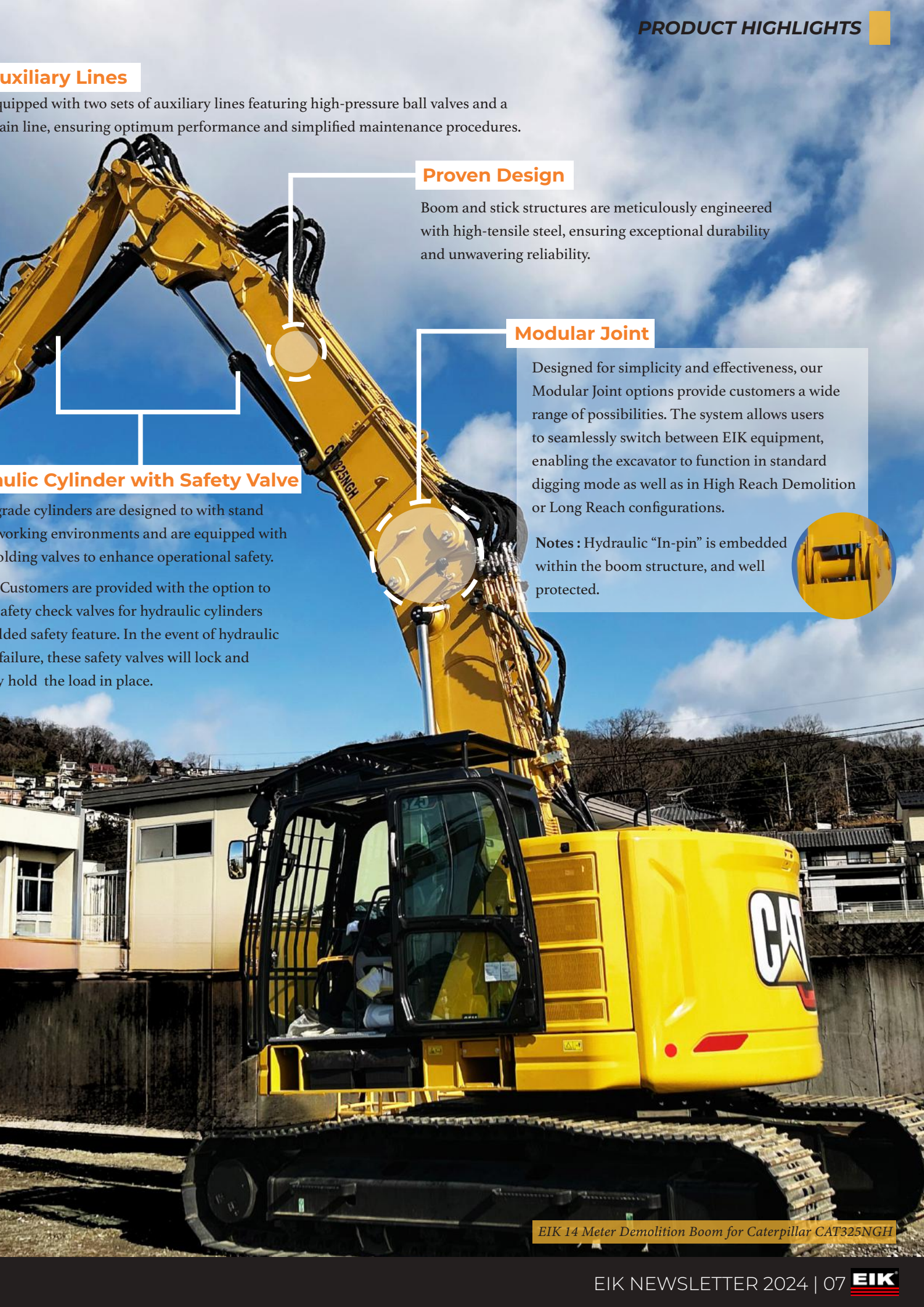
EIK 14 Meter Demolition Boom for Caterpillar CAT325NGH

Customers are provided with the option to install safety check valves for hydraulic cylinders as an added safety feature. In the event of hydraulic failure, these safety valves will lock and hold the load in place.