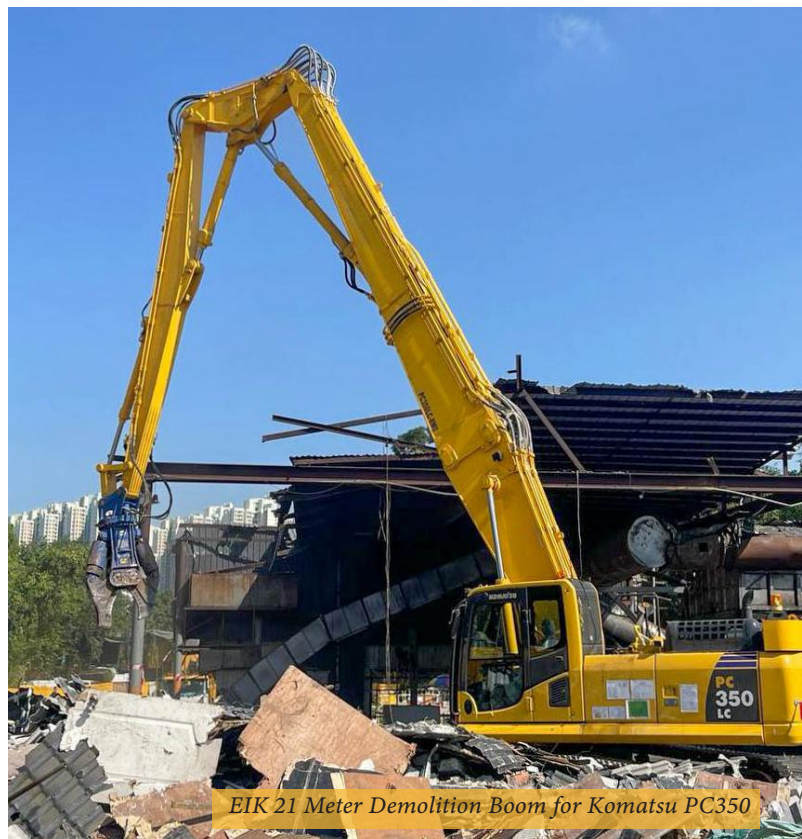
EIK 21 Meter Demolition Boom for Komatsu PC350

The 21 Meter Demolition Boom's versatile design accommodates a range of attachments, including shears, crushers, and grapples, making it ideal for diverse demolition applications. By enabling work from a safer distance, the 21 Meter Demolition Boom significantly enhances operator safety, minimizing the risk of injuries and accidents. Its efficient operation reduces downtime and accelerates project completion, translating into cost savings and reduced disruption to surrounding areas.