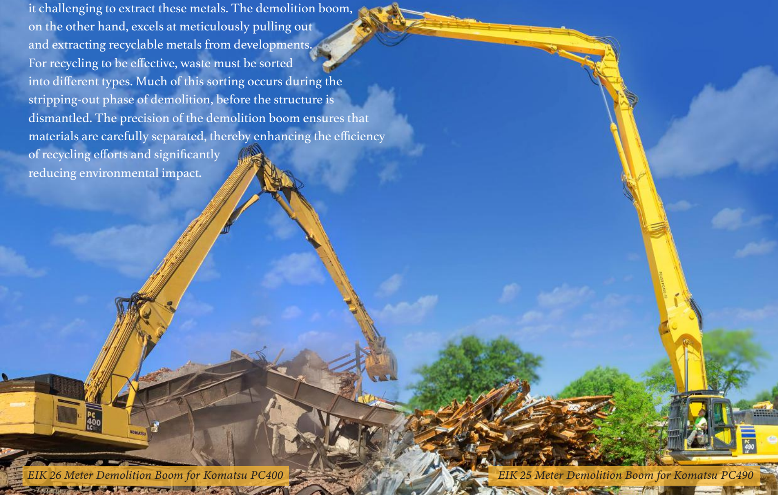
EIK 26 Meter Demolition Boom for Komatsu PC400

While conventional equipment might complete tasks more quickly, the High Reach Demolition Equipment excels in both safety and environmental sustainability. Many buildings contain valuable scrap metals that can be upcycled into new materials. However, using explosives to demolish structures often makes it challenging to extract these metals. The demolition boom, on the other hand, excels at meticulously pulling out and extracting recyclable metals from developments. For recycling to be effective, waste must be sorted into different types. Much of this sorting occurs during the stripping-out phase of demolition, before the structure is dismantled. The precision of the demolition boom ensures that materials are carefully separated, thereby enhancing the efficiency of recycling efforts and significantly reducing environmental impact.