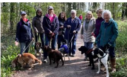
Thursday Team plus dogs enjoying a perfect Spring day on the Pembroke Walk