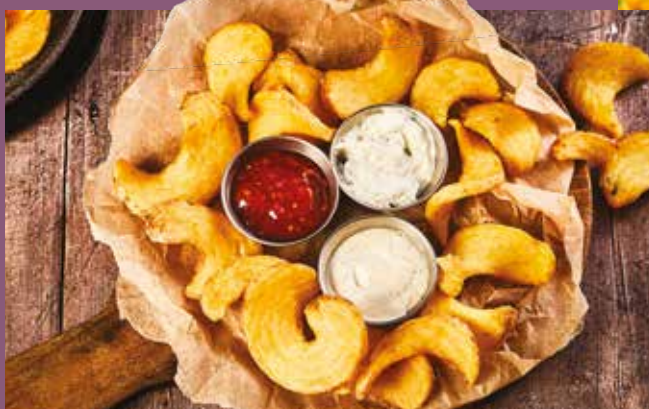
Salsa, Ranch and Honey Mustard dips

Dips are a great idea for adding flavour and texture to your snacks. Include a range of vegetables and for something different, the Signature by Country Range Potato Sidewinders are great for scooping and holding a lot of dip.