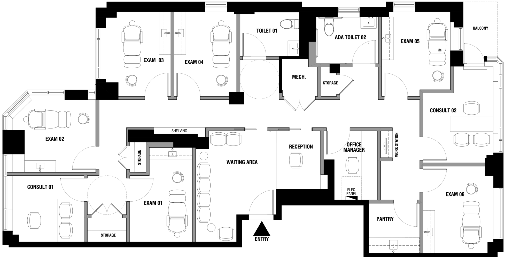
PROPOSED MEDICAL TEST FIT