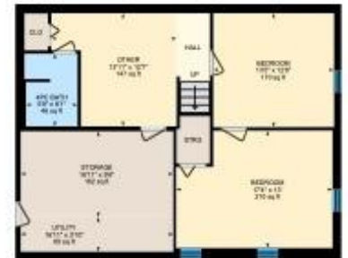
Basement (Below Grade) Exterior Area 1032.25 sq ft