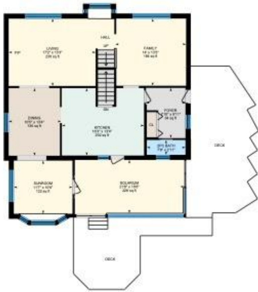
Main Floor Exterior Area 1489.59 sq ft

Main Building: Total Exterior Area Above Grade 2364.60 sq ft