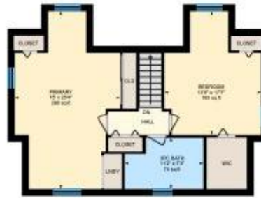
2nd Floor Exterior Area 875.01 sq ft