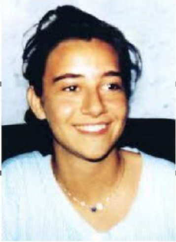
Blessed Chiara Luce Badano

"...the blind regain their sight, the lame walk, lepers are cleansed, the deaf hear, the dead are raised, and the poor have the good news proclaimed to them". Mt 11:2-11