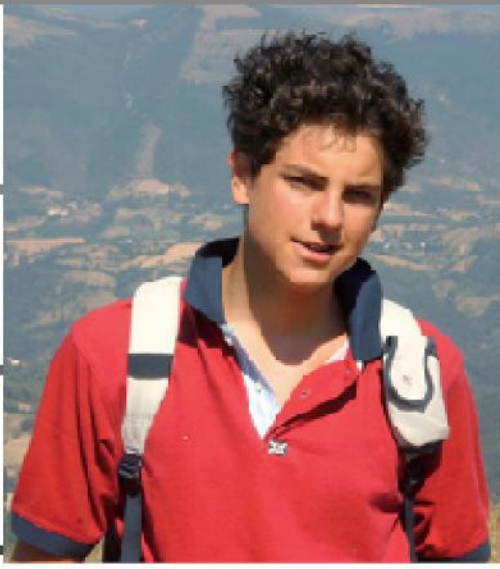
Blessed Carlo Acutis

"Let the Lord enter; he is king of glory". Mt 1:18-24