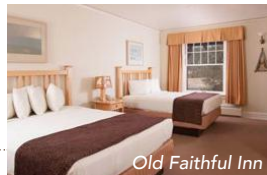
Old Faithful Inn

Confirmed by the National Park Service, you'll stay at one of the following Yellowstone properties: Old Faithful Inn, Old Faithful Snow Lodge, Canyon Lodge & Cabins or Mammoth Hot Springs Hotel. Each offers comfortable lodging and modern amenities.