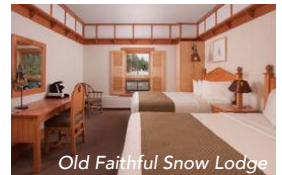
Old Faithful Snow Lodge