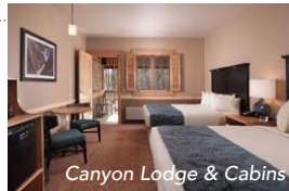
Canyon Lodge & Cabins