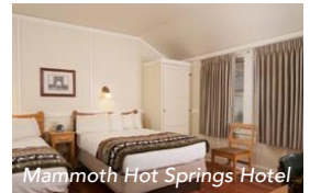
Mammoth Hot Springs Hotel