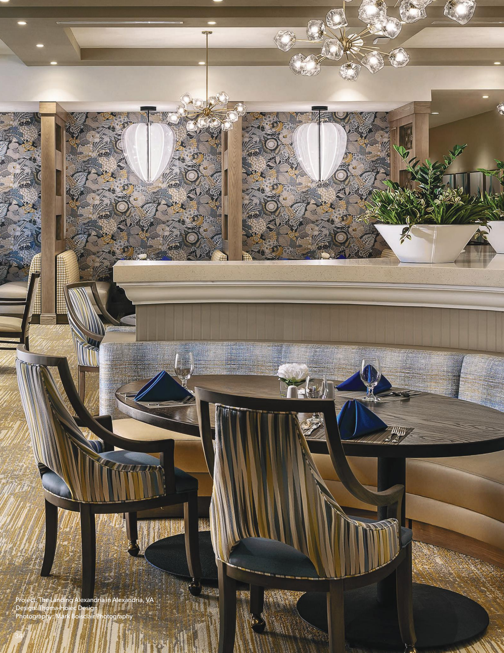
Project: The Landing Alexandria in Alexandria, VA Design: Thoma-Holec Design