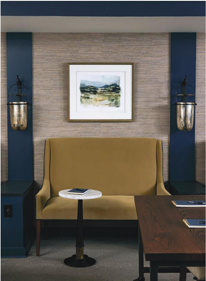
Project: The Grove in Raleigh, NC Design: Carole Hollowell Interiors