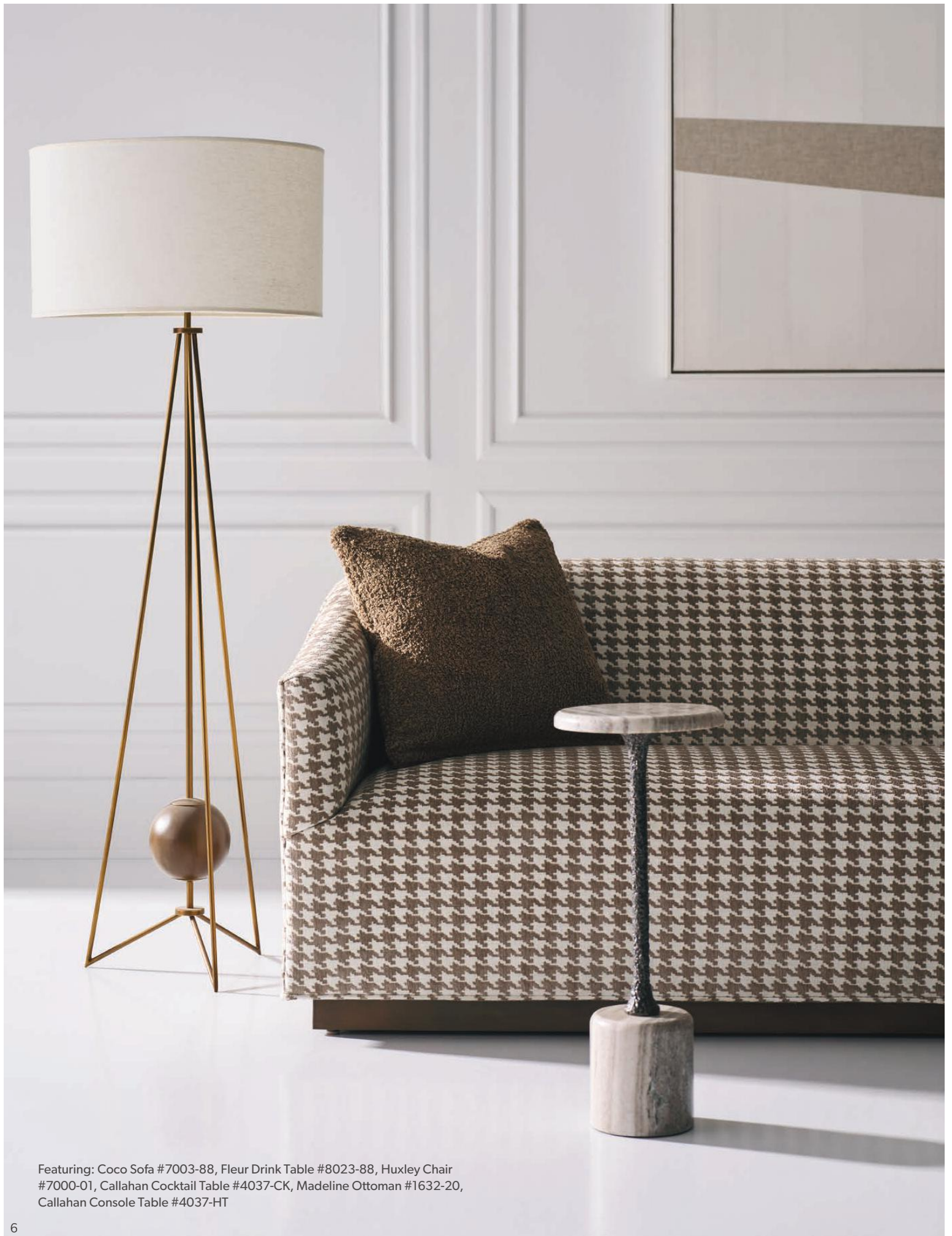
Featuring: Coco Sofa #7003-88, Fleur Drink Table #8023-88, Huxley Chair #7000-01, Callahan Cocktail Table #4037-CK, Madeline Ottoman #1632-20, Callahan Console Table #4037-HT