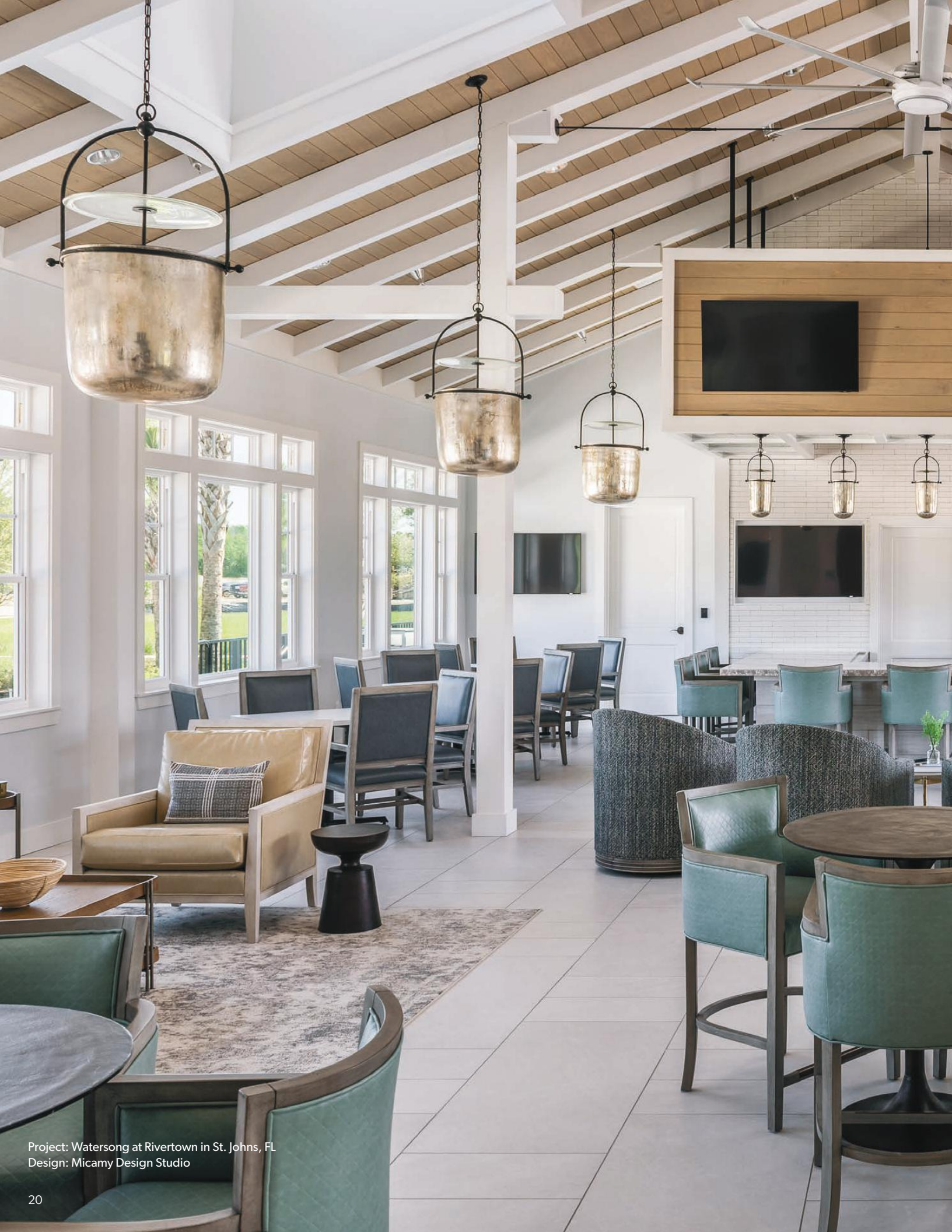
Project: Watersong at Rivertown in St. Johns, FL Design: Micamy Design Studio