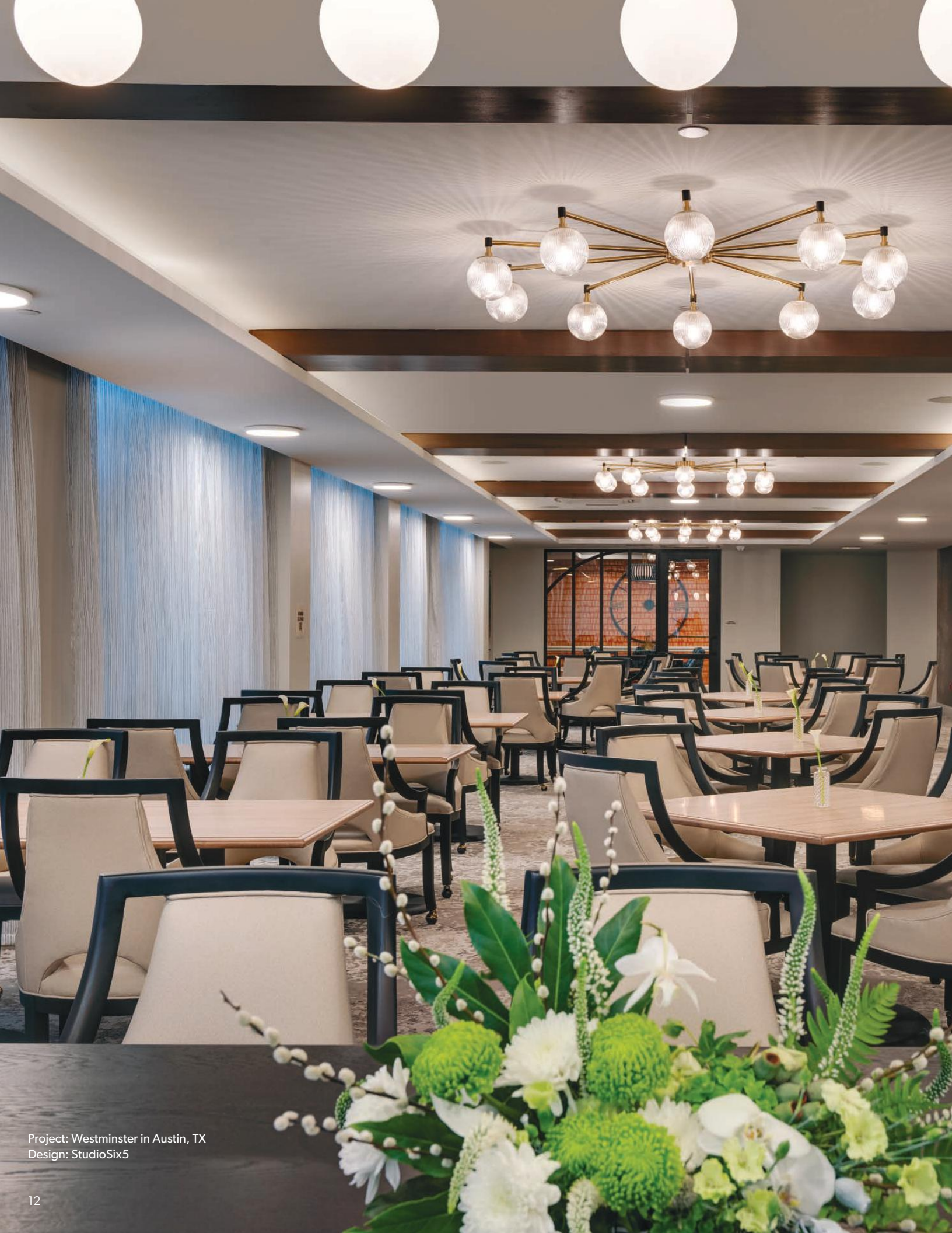
Project: Westminster in Austin, TX Design: StudioSix5