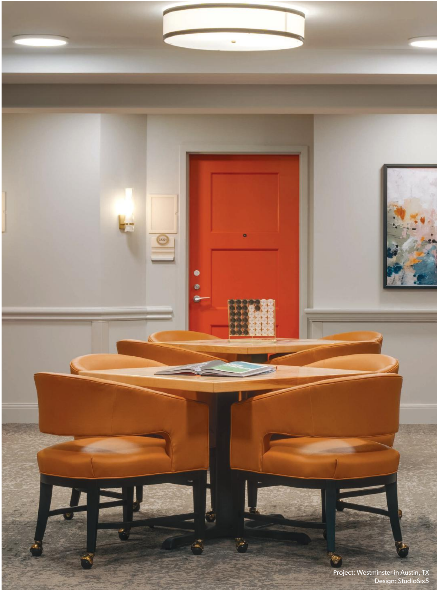
Project: Westminster in Austin, TX Design: StudioSix5