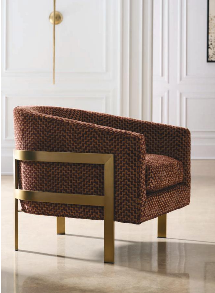
Featuring: Nigel Sofa # 7008-50, Sundries Tables # 8136-12-T/#8136-12-B, Zsa Zsa Chair # 7004-01-6