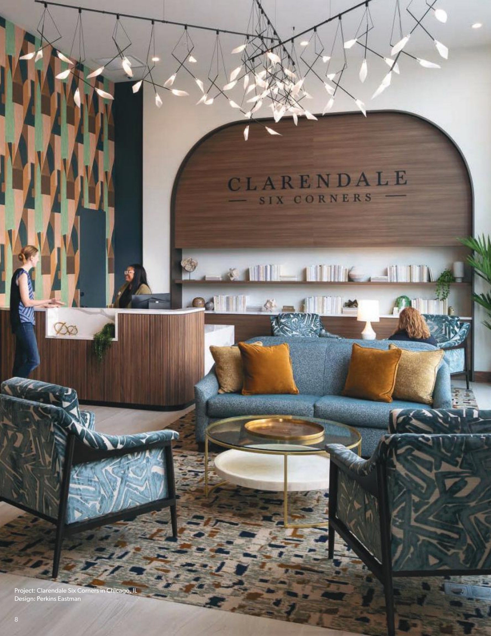
Project: Clarendale Six Corners in Chicago, IL Design: Perkins Eastman