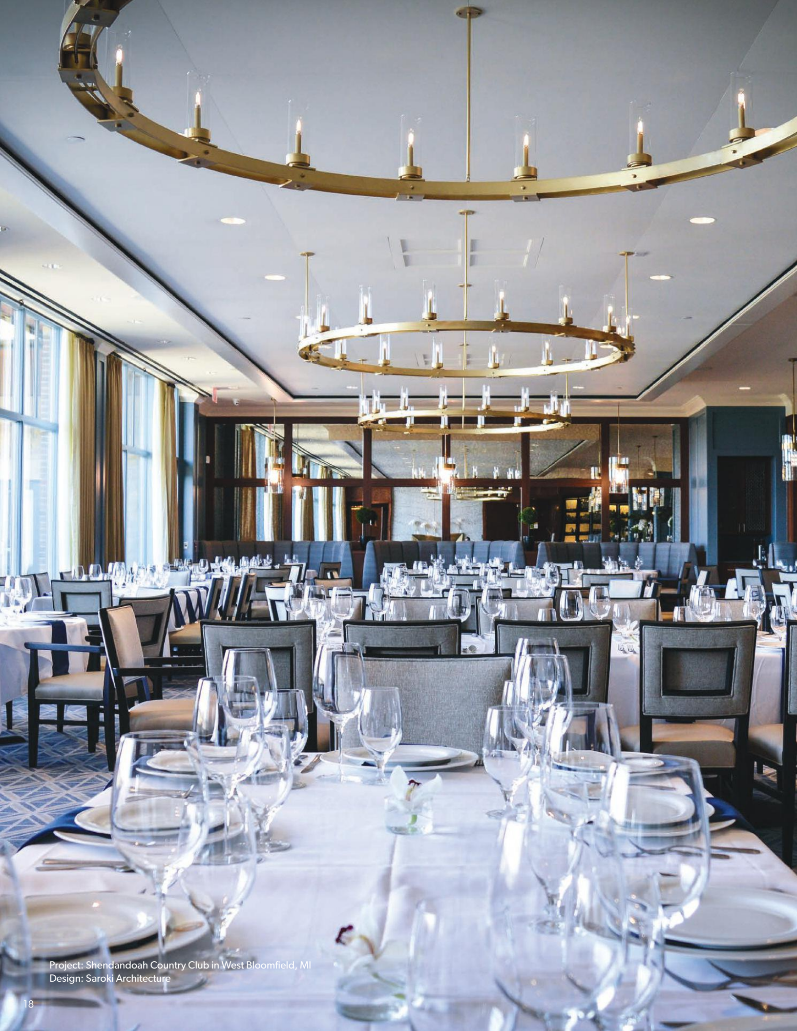
Project: Shendandoah Country Club in West Bloomfield, MI Design: Saroki Architecture