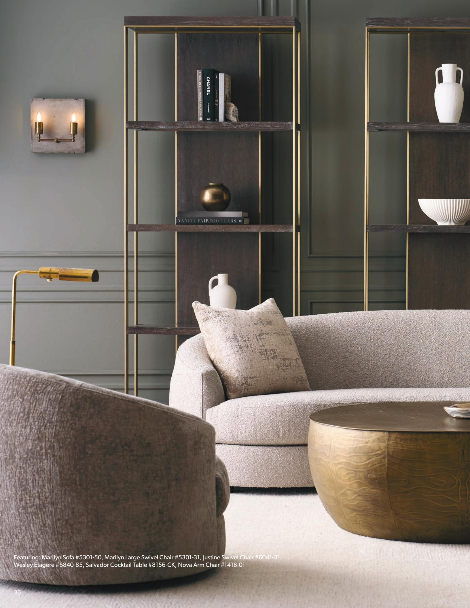
Featuring: Marilyn Sofa #5301-50, Marilyn Large Swivel Chair #5301-31, Justine Swivel Chair #6041-31, Wesley Etagere #6840-85, Salvador Cocktail Table #8156-CK, Nova Arm Chair #1418-01