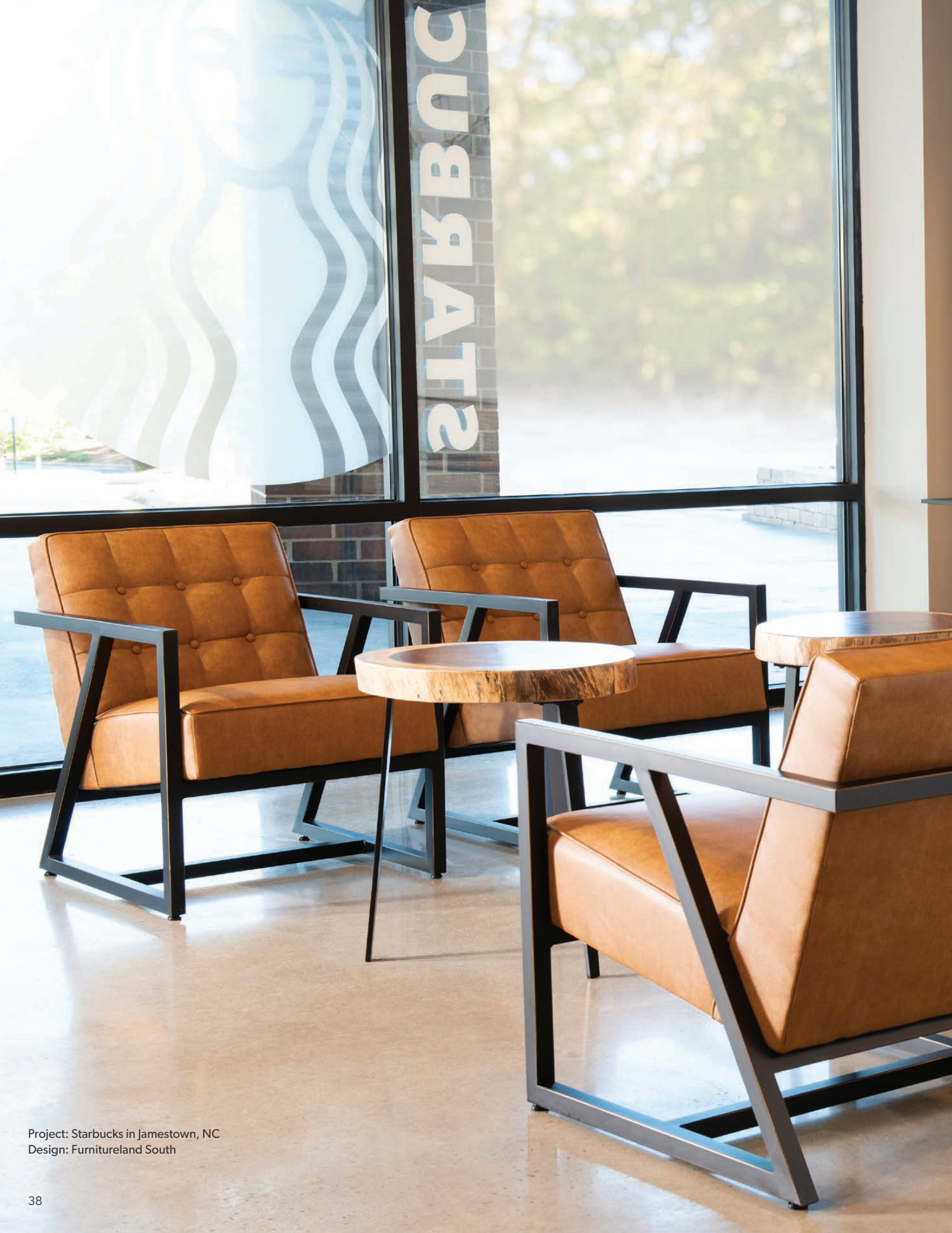
Project: Starbucks in Jamestown, NC Design: Furnitureland South