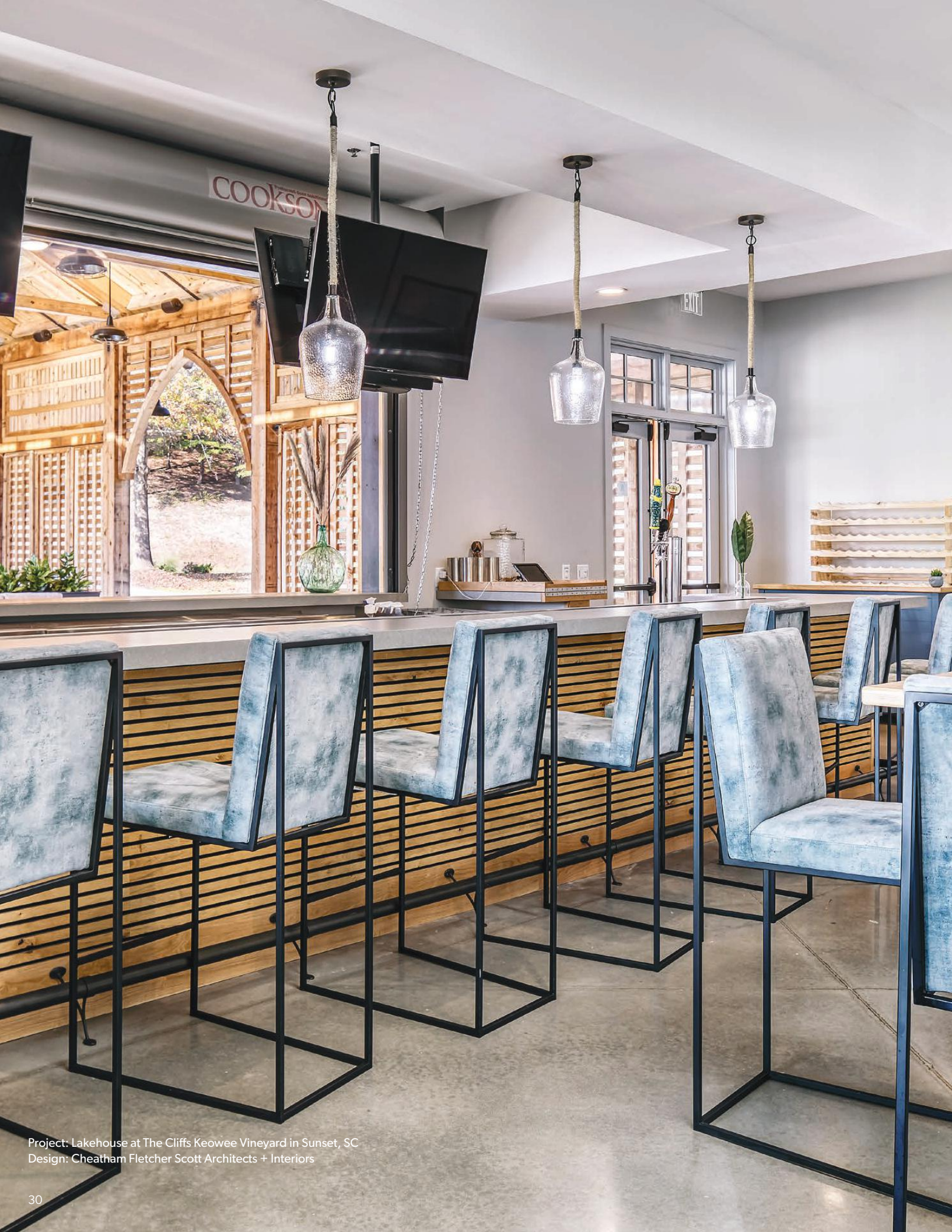
Project: Lakehouse at The Cliffs Keowee Vineyard in Sunset, SC Design: Cheatham Fletcher Scott Architects + Interiors