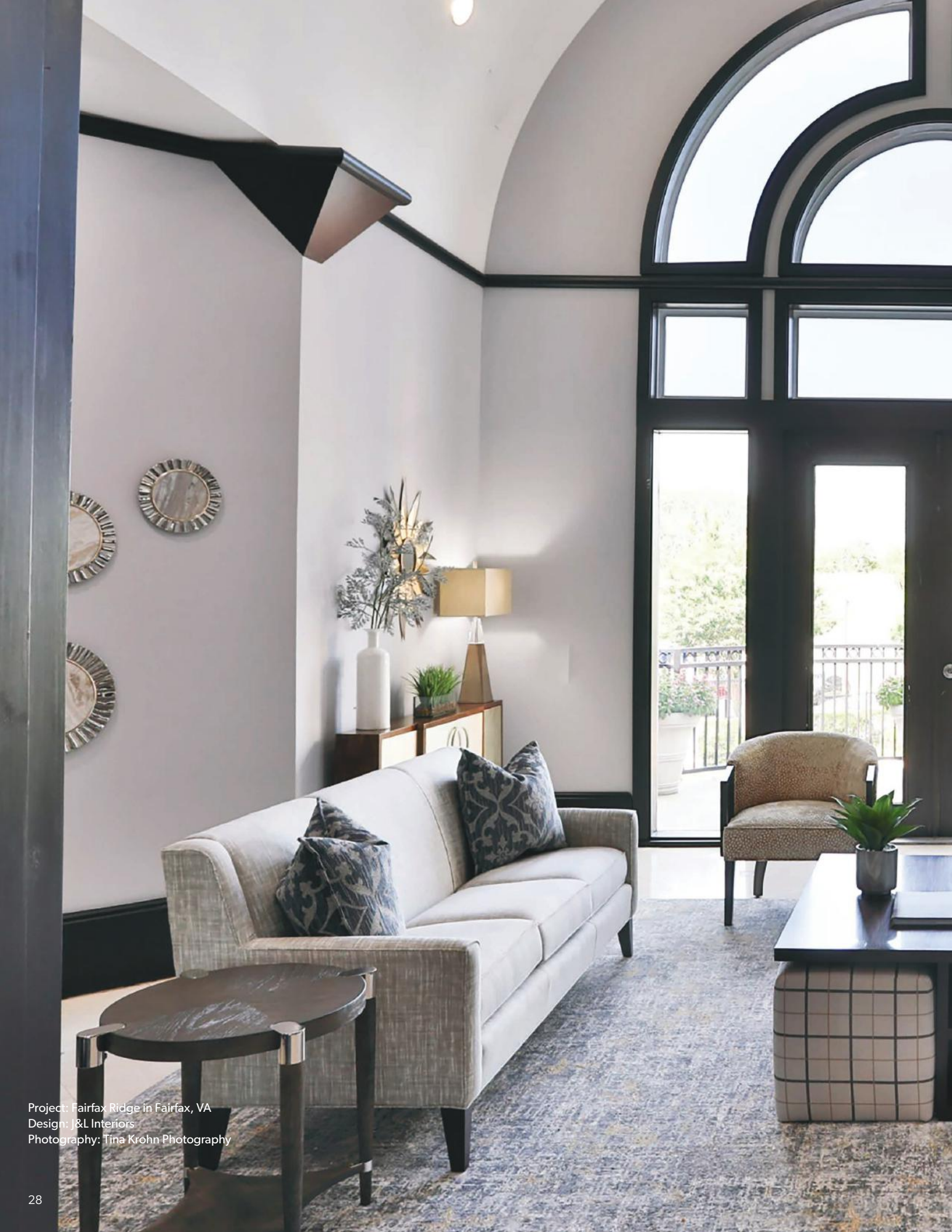
Project: Fairfax Ridge in Fairfax, VA Design: J&L Interiors