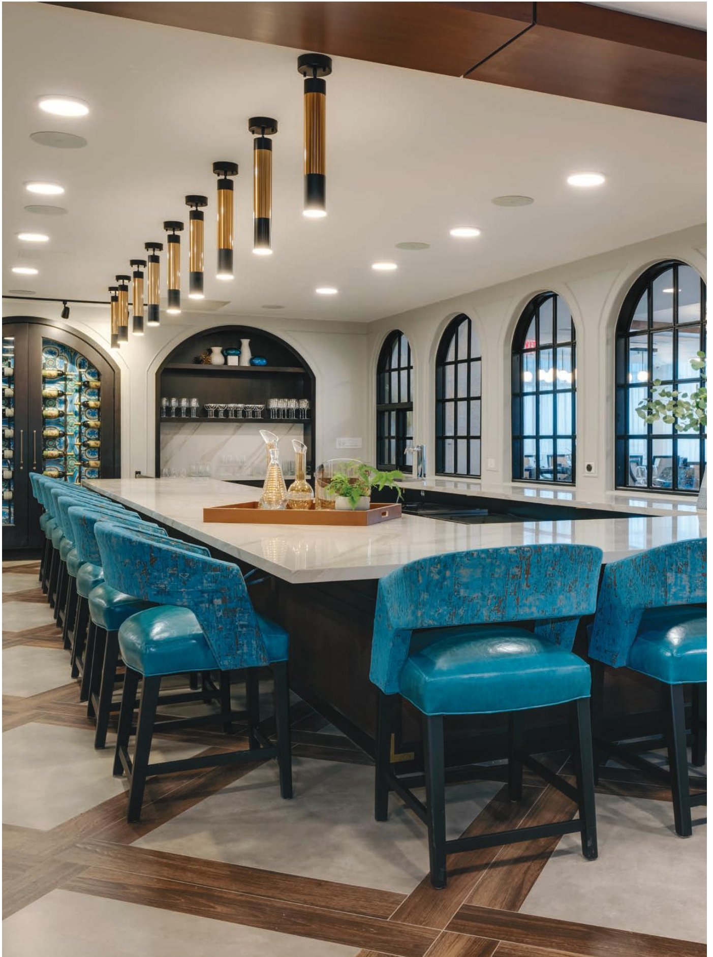
Project: Westminster in Austin, TX Design: StudioSix5