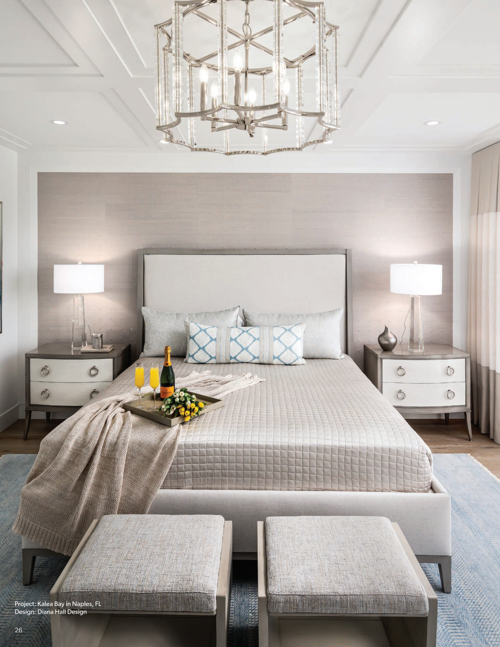
Project: Kalea Bay in Naples, FL Design: Diana Hall Design