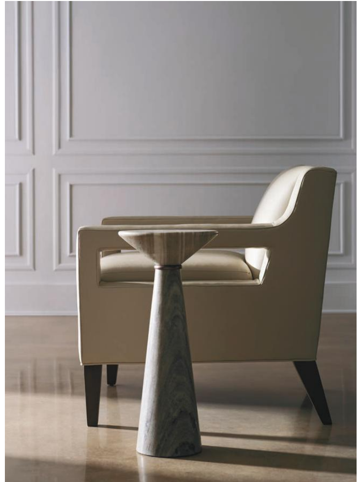
Featuring: Sanders Sofa #7005-89, Lillian Chair # 6044-01-M, Fleur Drink Table # 8023-88, Venus Chair # 7001-E1, Rivers Drink Table #8020-19, Massimo Cocktail Table with Carrara Marble Top # 8005-46/# 8005-54