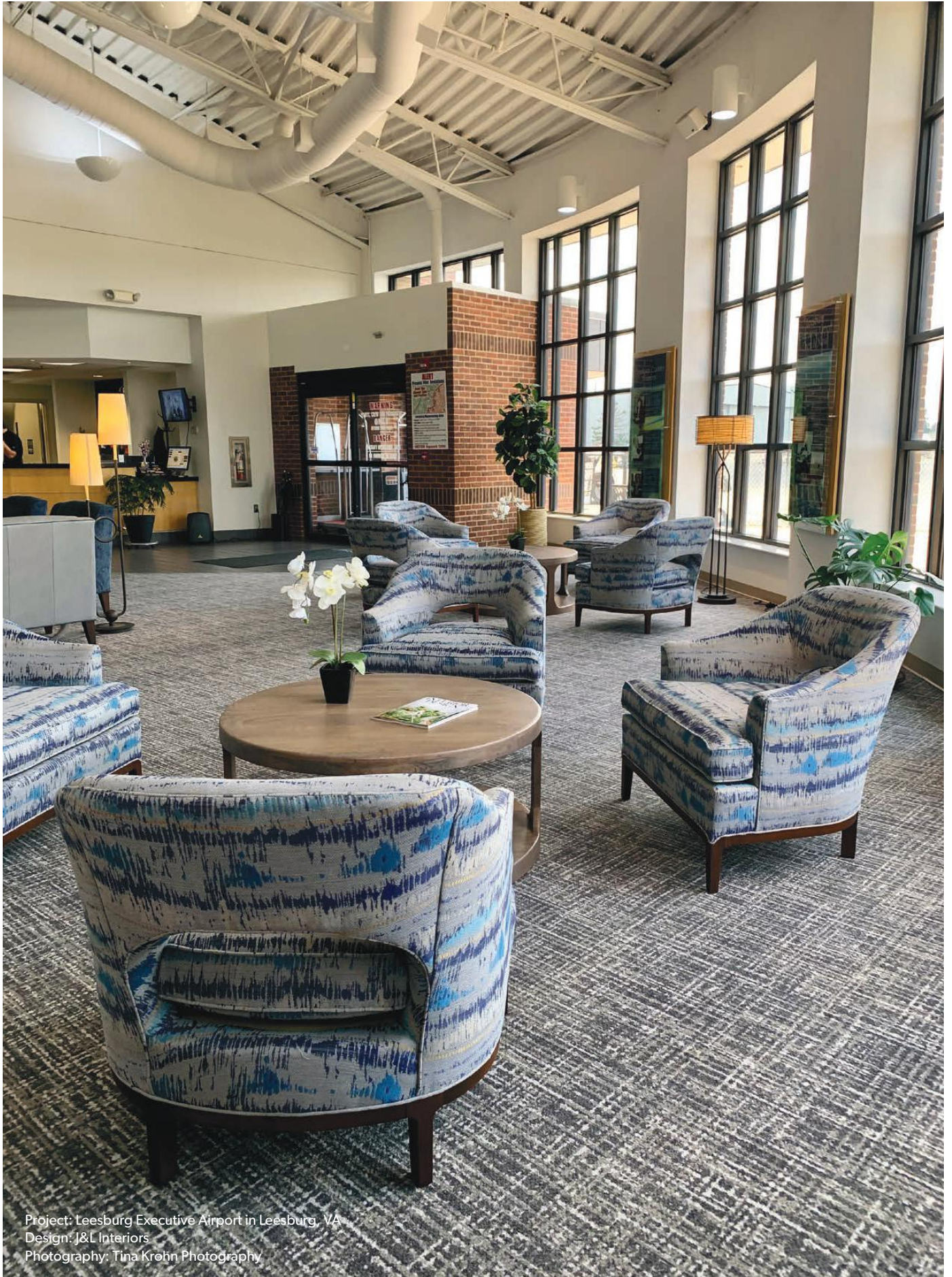
Project: Leesburg Executive Airport in Leesburg, VA Design: J&L Interiors