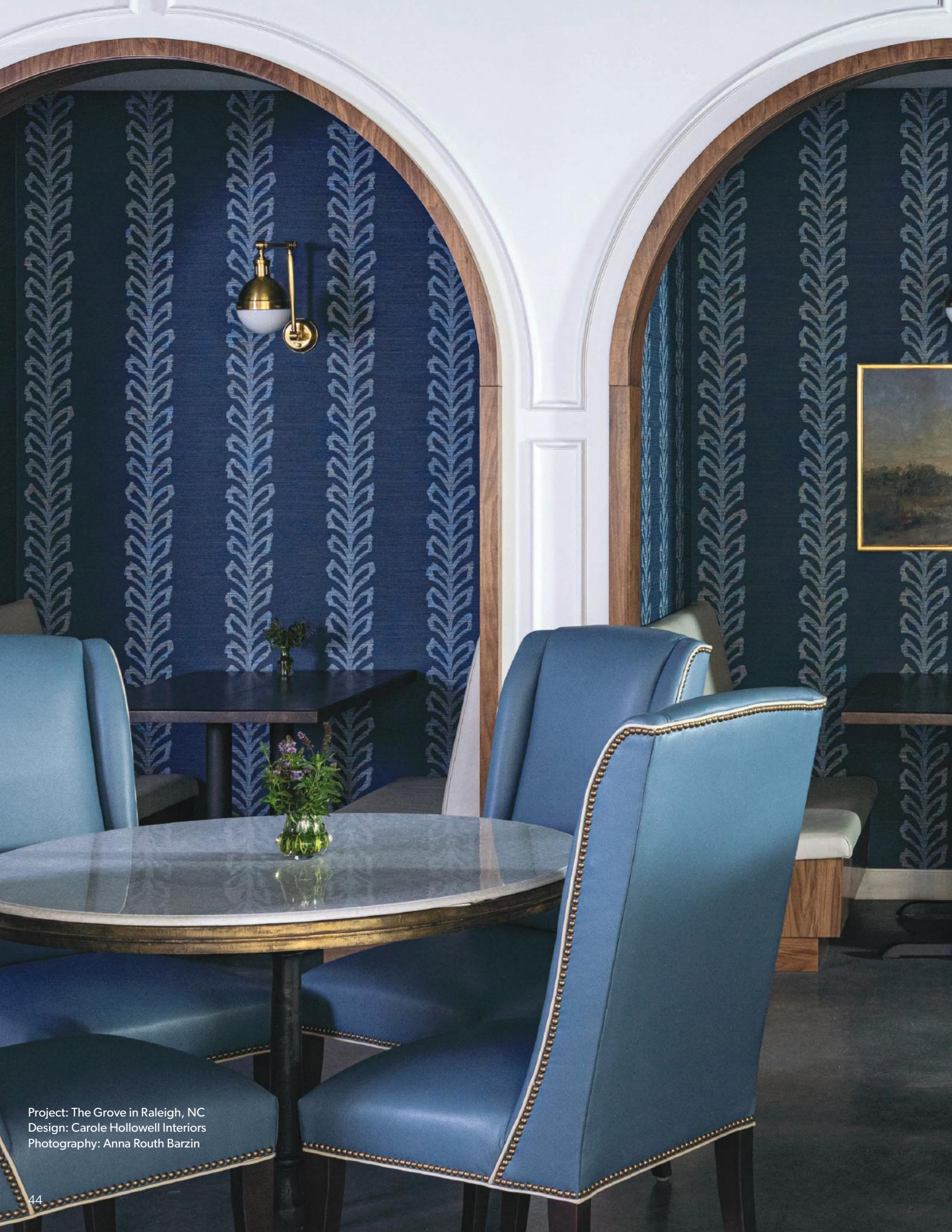
Project: The Grove in Raleigh, NC Design: Carole Hollowell Interiors