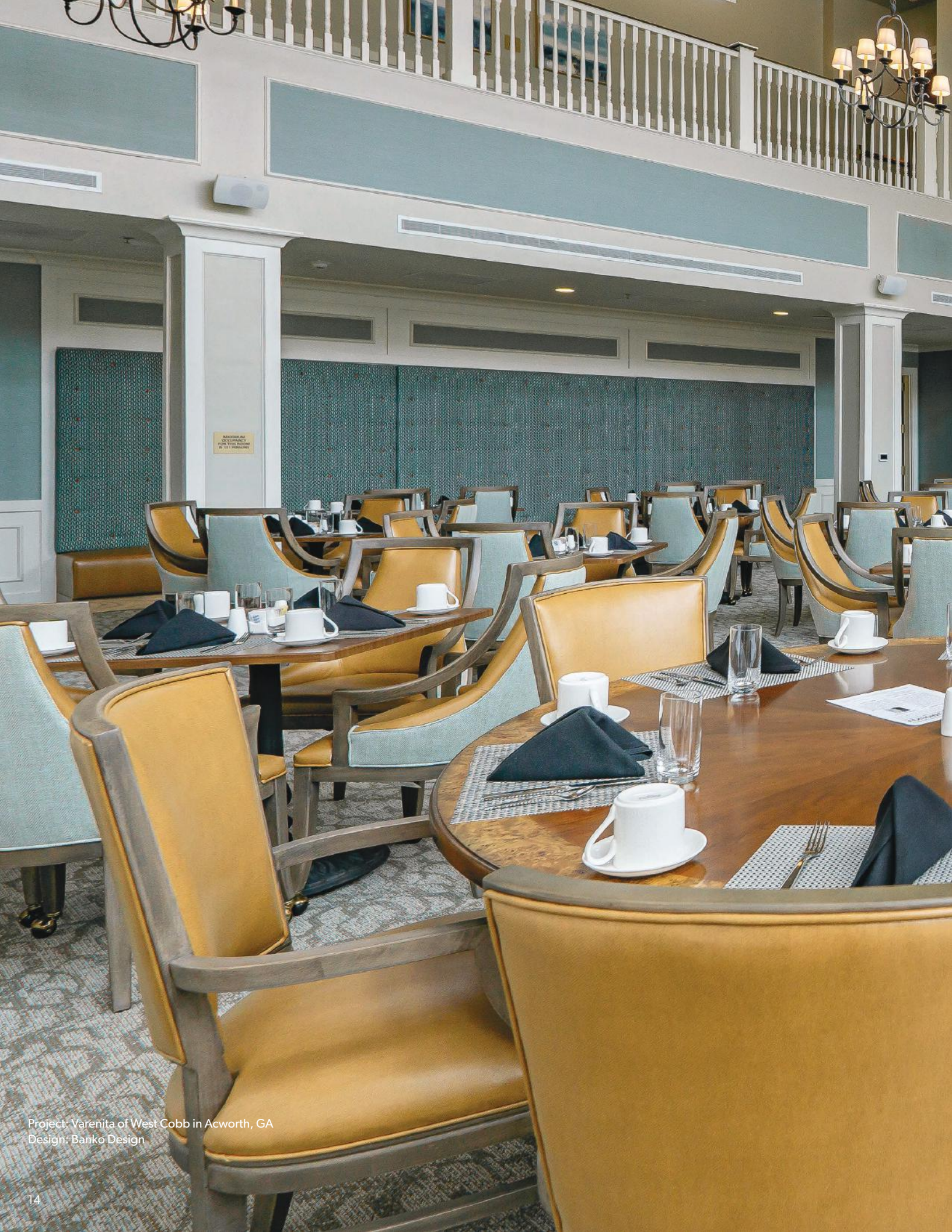
Project: Varenita of West Cobb in Acworth, GA Design: Banko Design