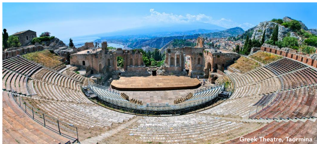
Greek Theatre, Taormina

Activity Level: Guests should be able to enjoy two hours or more of walking, be sure-footed on cobbled surfaces, and walk up and down hillsides and stairs without assistance.