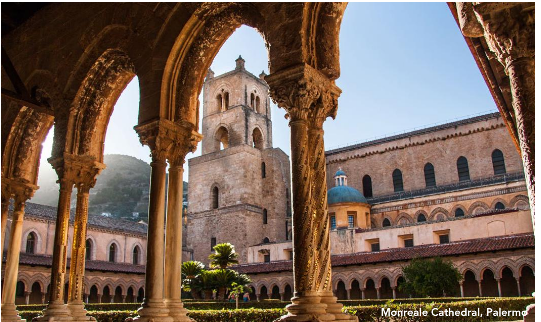
Monreale Cathedral, Palermo