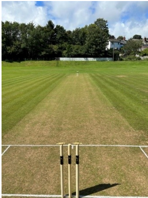
From the 'sea end'