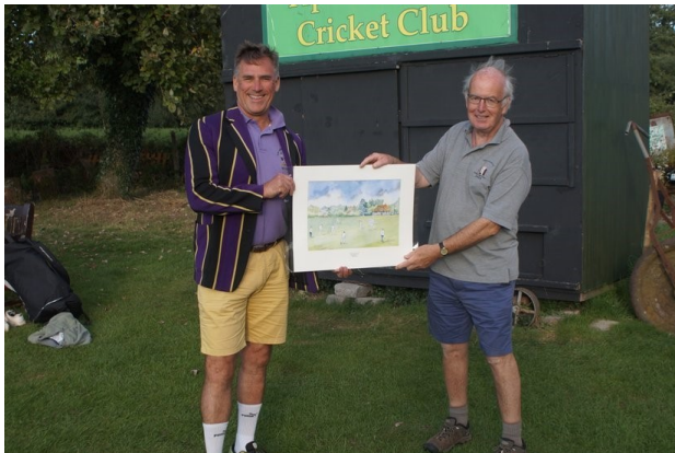
Presentation to Tipton chairman