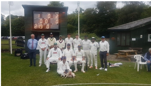
Played at Exning Park on 23 rd July 2023:-