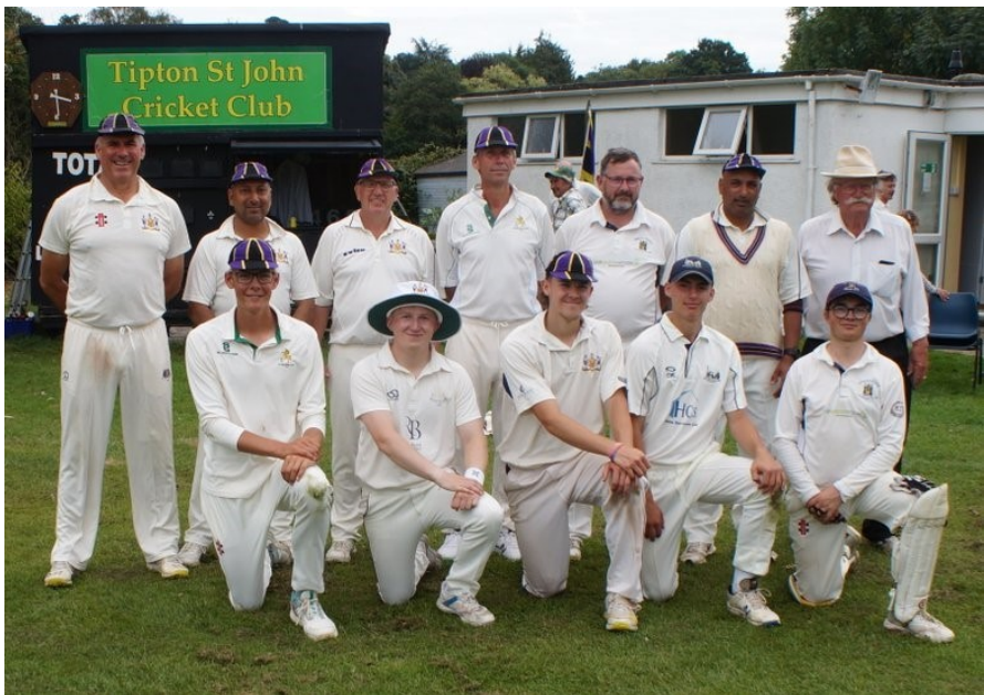
Played at Tipton St. John C.C. on 24 th August 2023:-