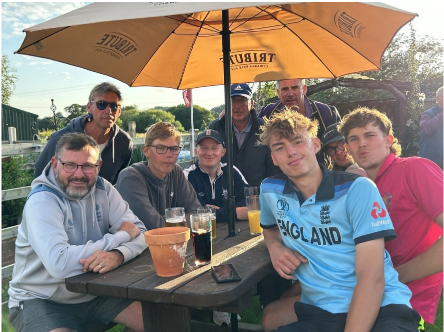
End of tour drinks.