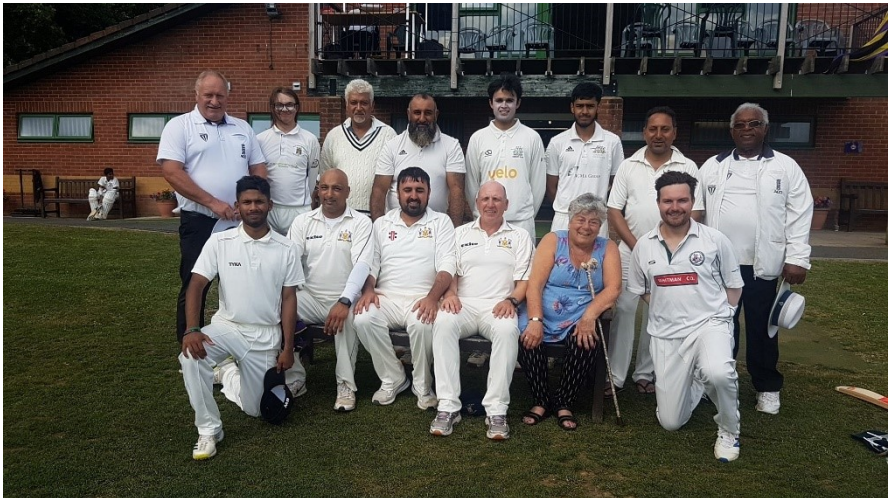
Incogs v. John Lyon School