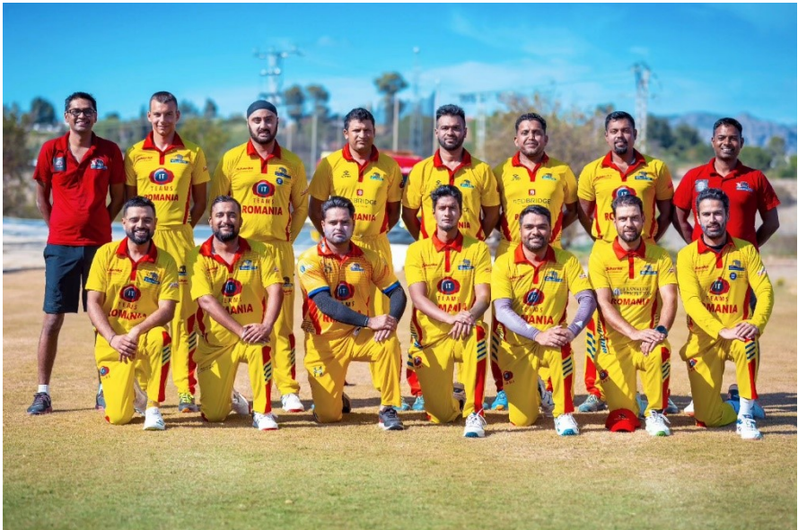
The Romania side that took part in the T10 tournament in Spain. Several played against the club.