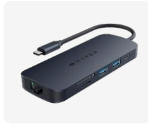
HyperDrive Next 8 Port USB-C Hub