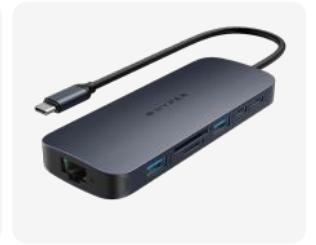
HyperDrive Next 11 Port USB-C Hub