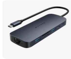
HyperDrive Next 10 Port USB-C Hub