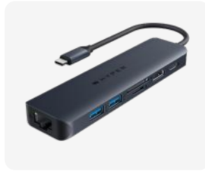
HyperDrive Next 7 Port USB-C Hub