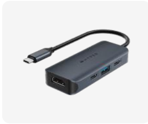
HyperDrive Next 4 Port USB-C Hub