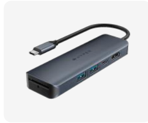
HyperDrive Next 6 Port USB-C Hub