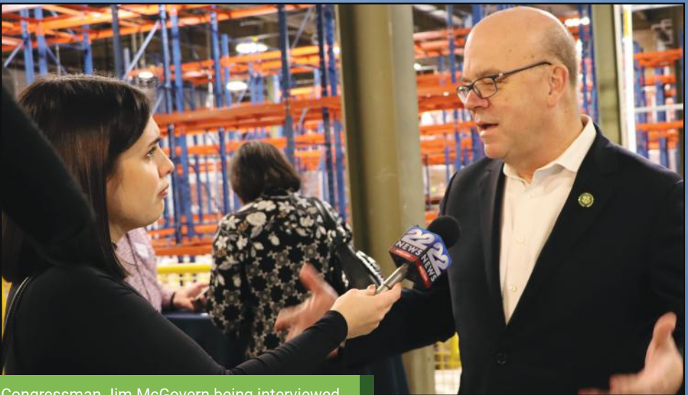
Congressman Jim McGovern being interviewed.

Your support and partnership made this incredible accomplishment possible!