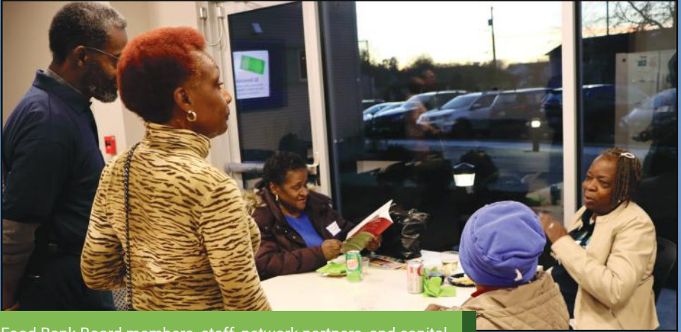
Food Bank Board members, staff, network partners, and capital campaign supporters gathered at the Food Bank in December.

We look forward to all the innovative ways our new location will help us fulfill our mission.