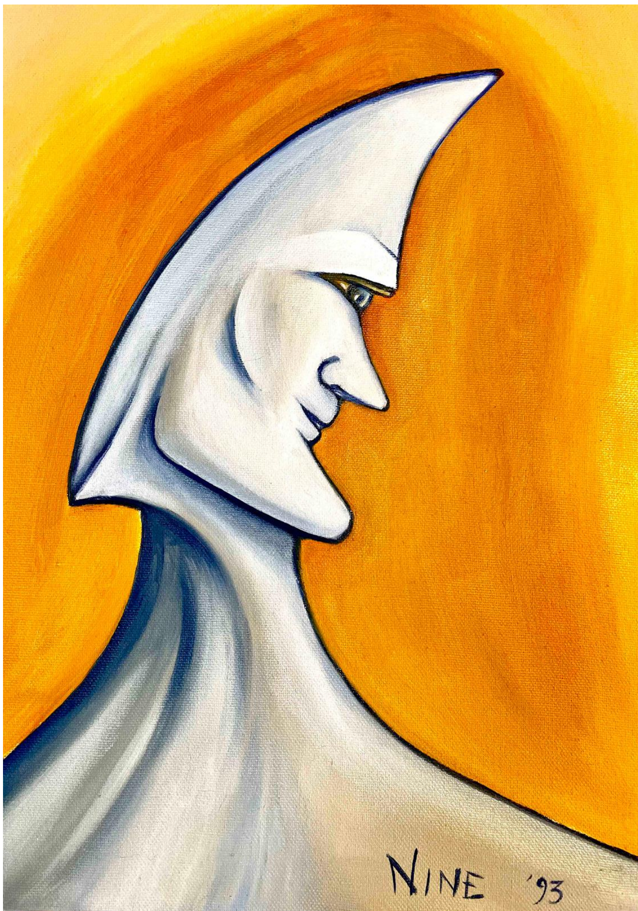
Janine Cooper Ayres , Moon Man , oil on canvas, 12 x 16 in, 1993, $249