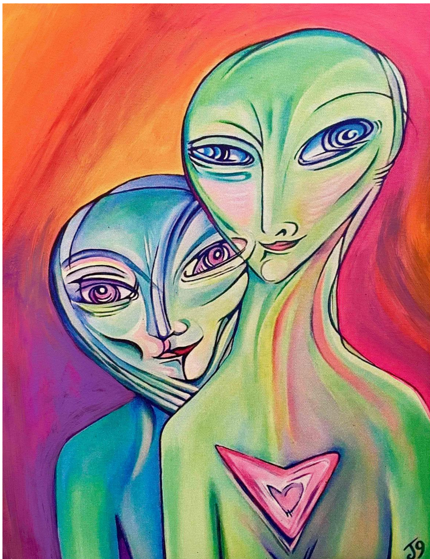
Janine Cooper Ayres , E.T. Lovers , embellished canvas print, 11 x 14 in, 2016, $99