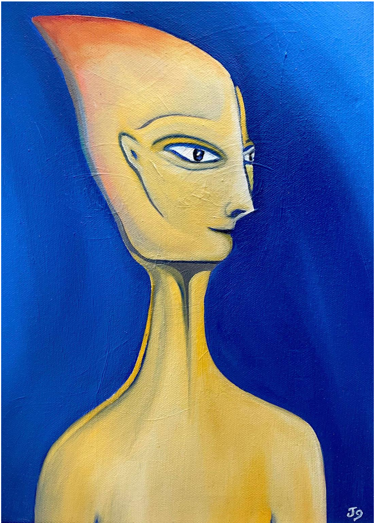
Janine Cooper Ayres , Yellow ET , oil on canvas, 11 x 14 in, 1996, $229