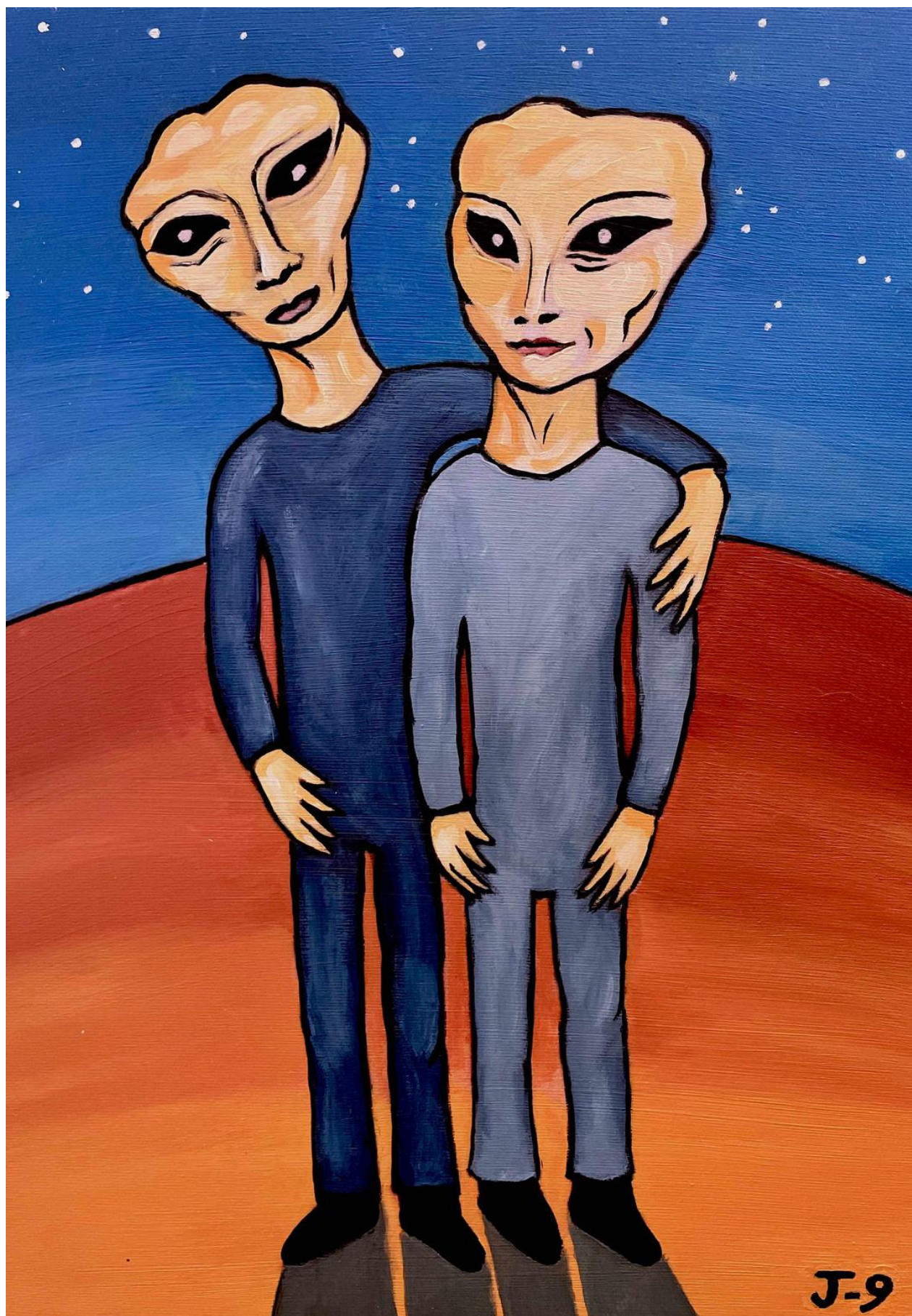
Janine Cooper Ayres , E.T. Couple , embellished canvas print, 11 x 14 in, 1998, $99