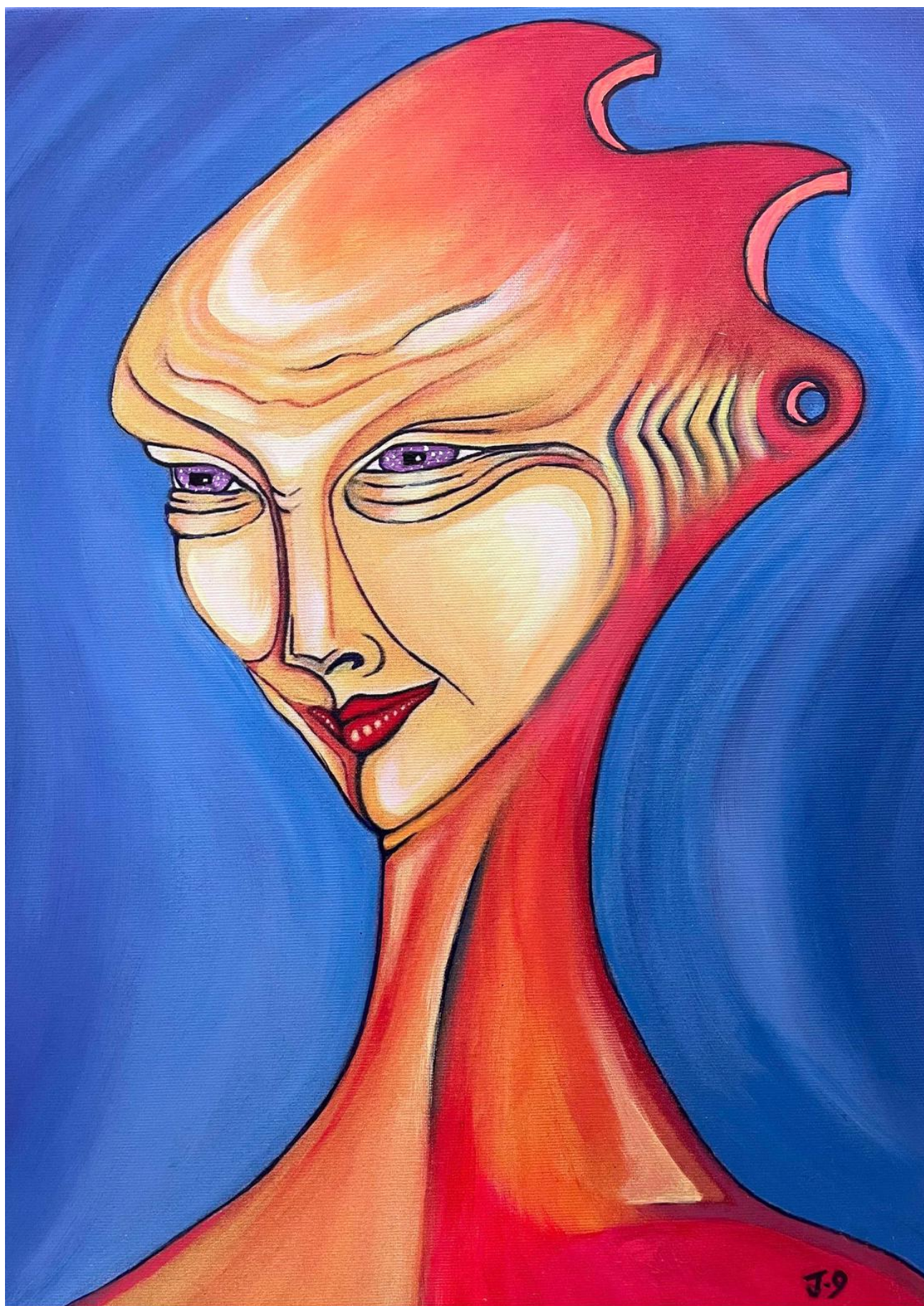
Janine Cooper Ayres , Avieri , embellished canvas print, 11 x 14 in, 2009, $99