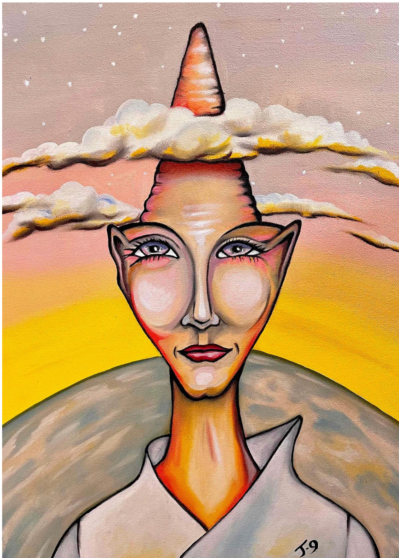
Janine Cooper Ayres , Head in the Clouds , embellished print, 16 x 20 in, 1997, $299