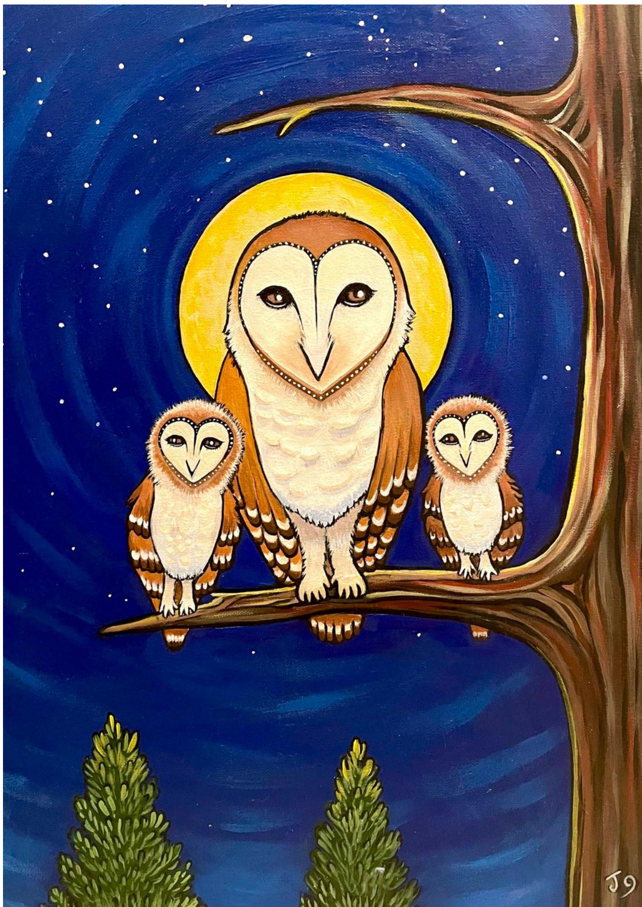
Janine Cooper Ayres , Barn Owl & Her Babies , acrylic on canvas, 18 x 24 in, 2019, $249