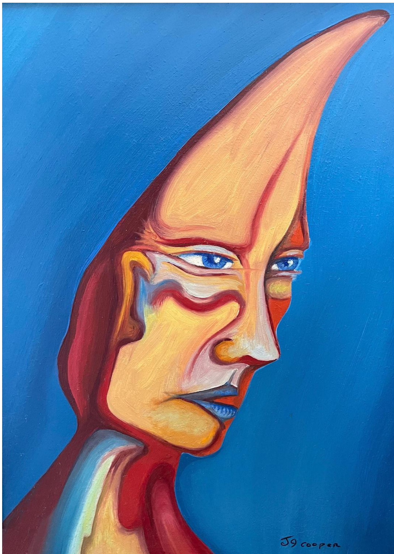
Janine Cooper Ayres , Penn , oil on masonite, 12 x 16 in, 1994, $249