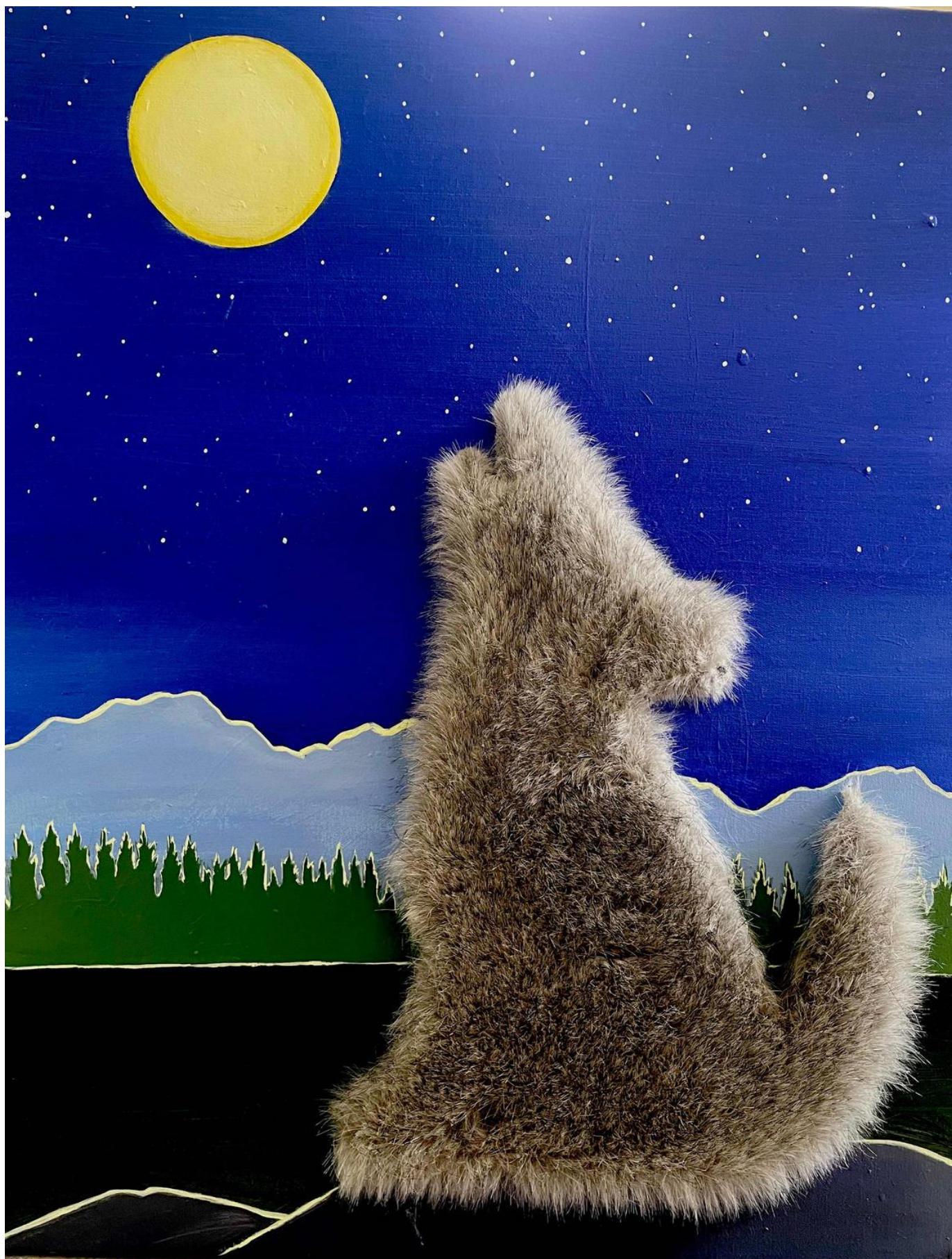
Janine Cooper Ayres , Coyote (Pettable) , acrylic on canvas, 24 x 30 in, 2018, $429