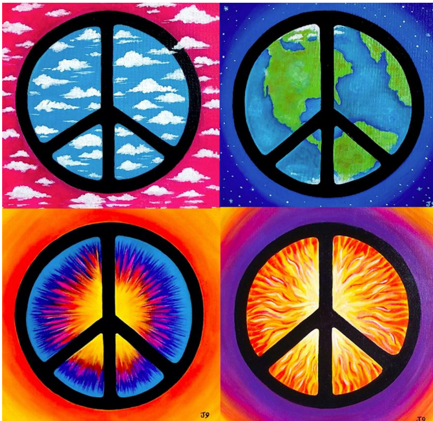
Janine Cooper Ayres , Four Peaces , embellished canvas print, 16 x 16 in, 2017, $229