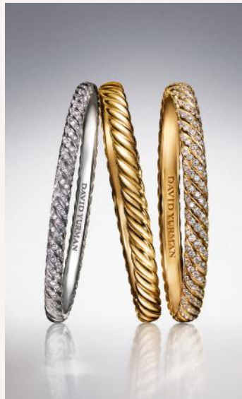
SCULPTED CABLE COLLECTION