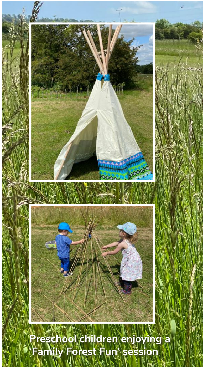
Preschool children enjoying a ‘Family Forest Fun’ session

We deliver field trips that bring adults and young people closer to their surroundings and encourage them to learn about plants, woodland management and the animals that form the eco structure across the sweeping Kentish chalk Downs.