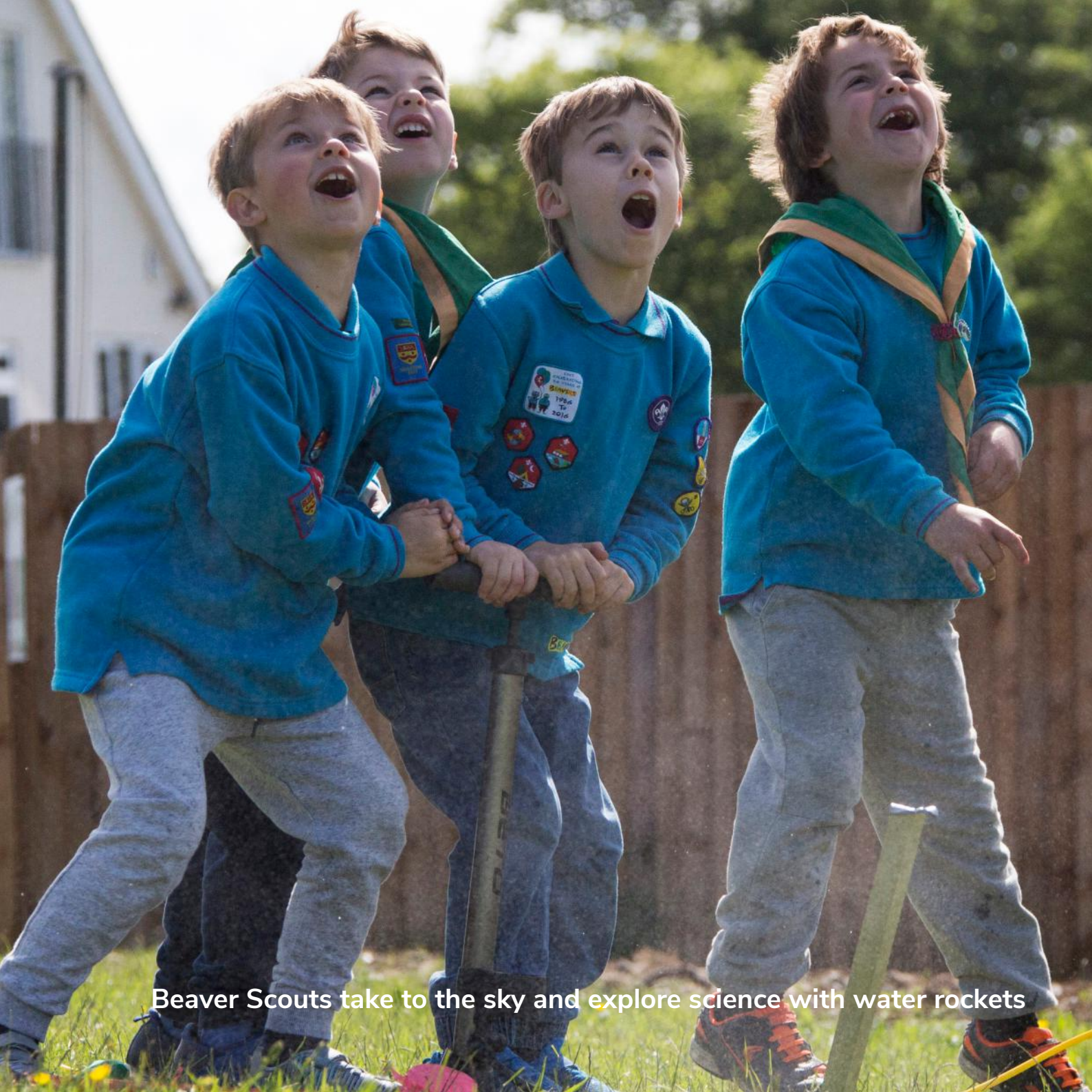
Beaver Scouts take to the sky and explore science with water rockets