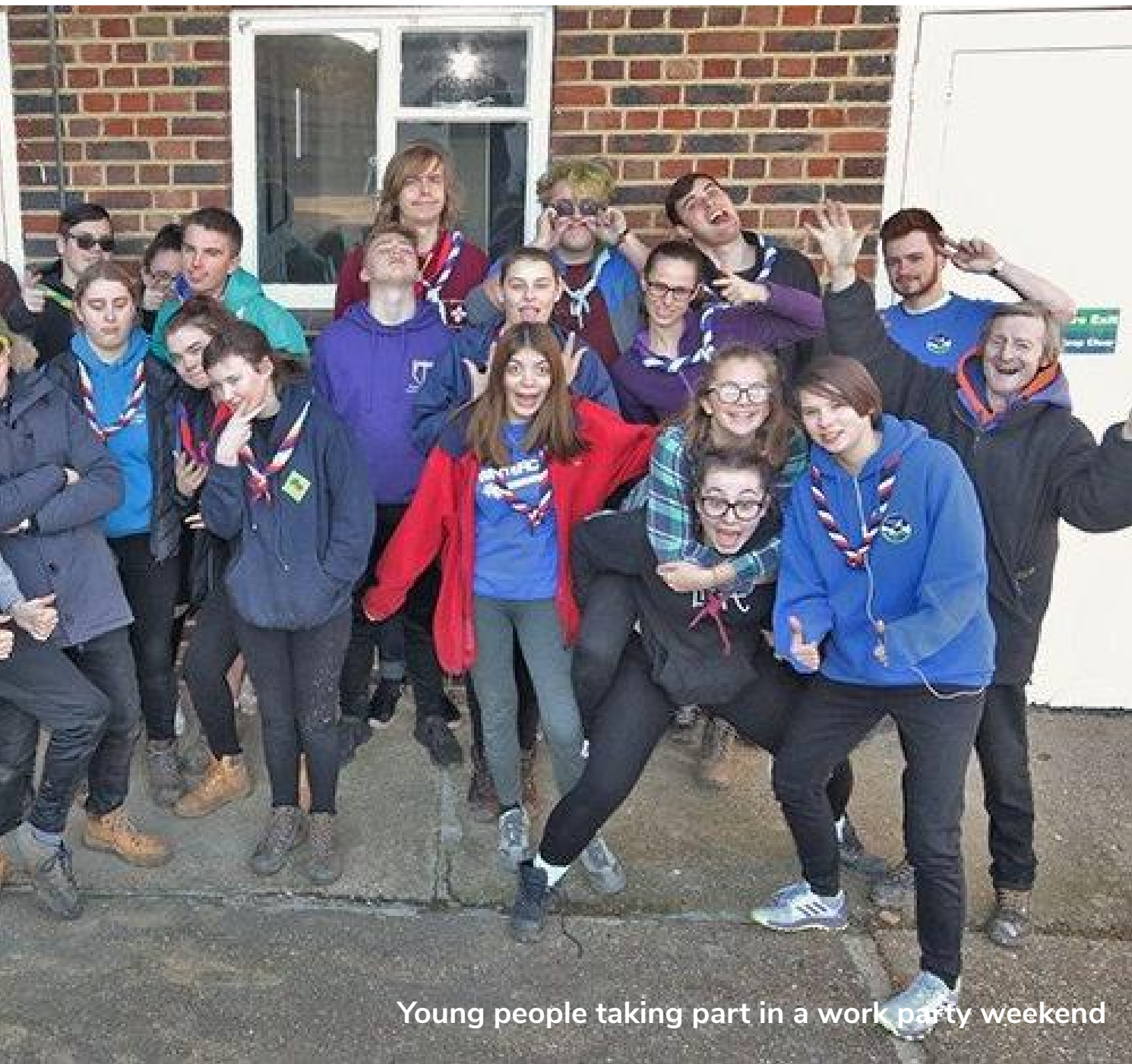
Young people taking part in a work party weekend