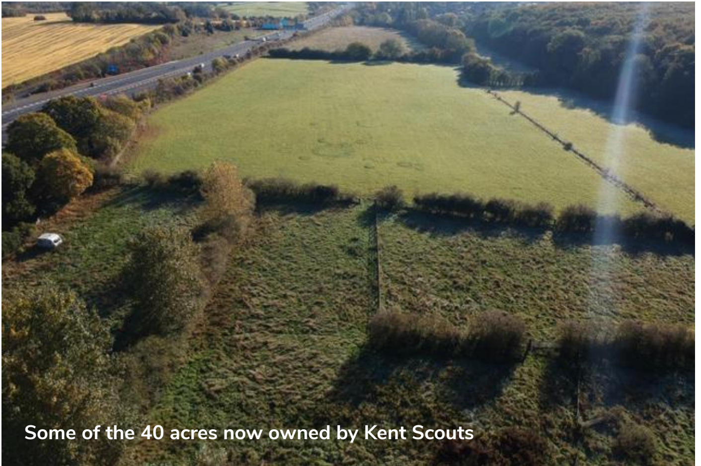
Some of the 40 acres now owned by Kent Scouts