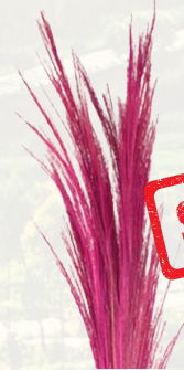
SOLD OUT HA0703-004 Pink