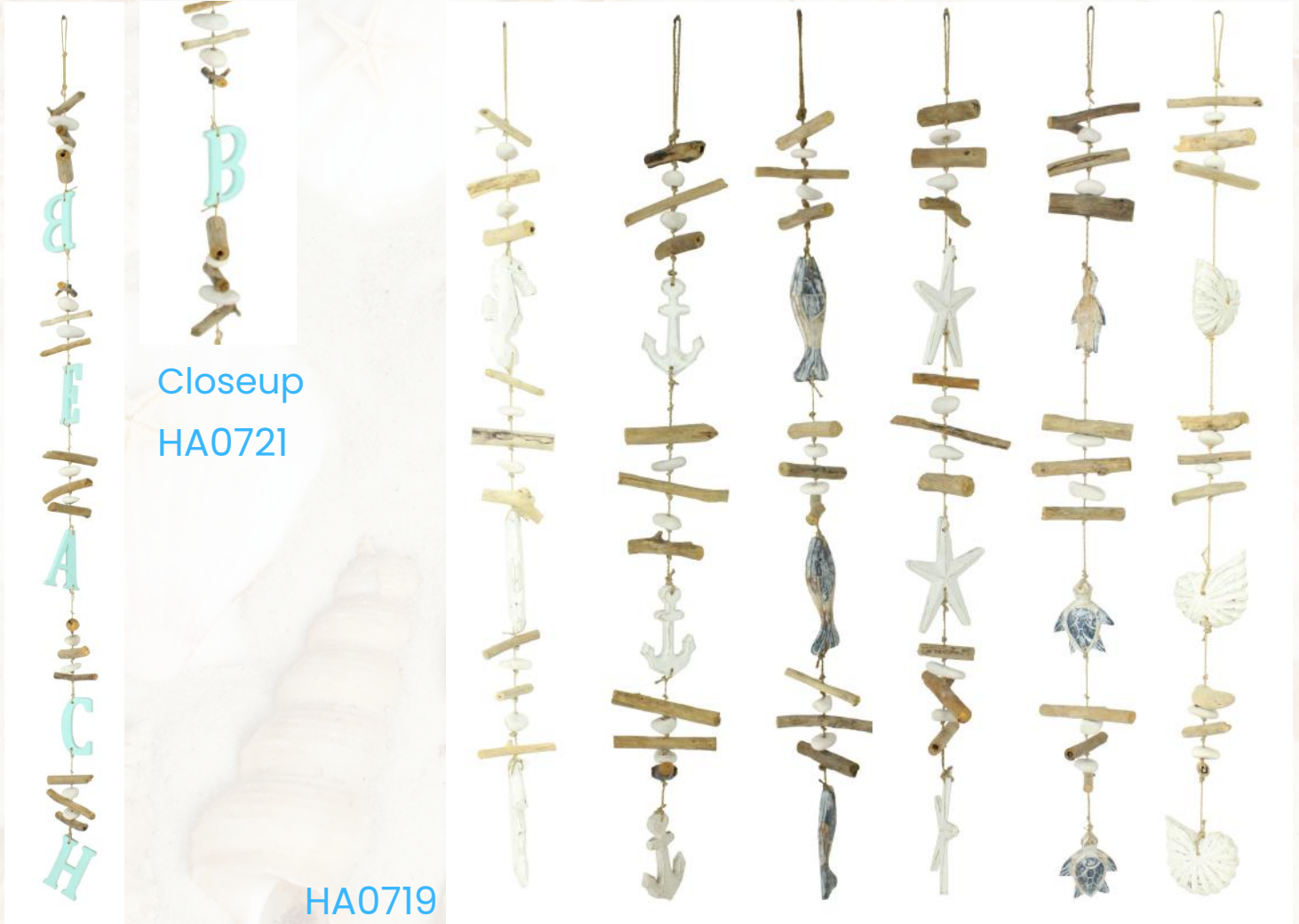
Strung Driftwood Assortment