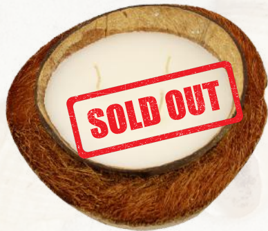
HA0784 Coconut Candle Frangipane scent