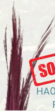
SOLD OUT HA0703-007 Purple