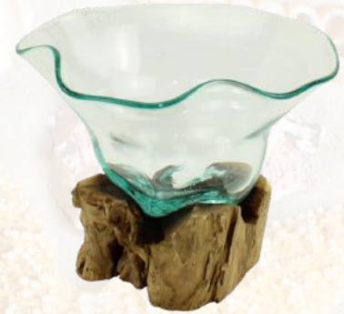
HA07008 9" DIA.