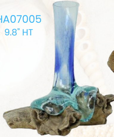
HA07005 9.8" HT