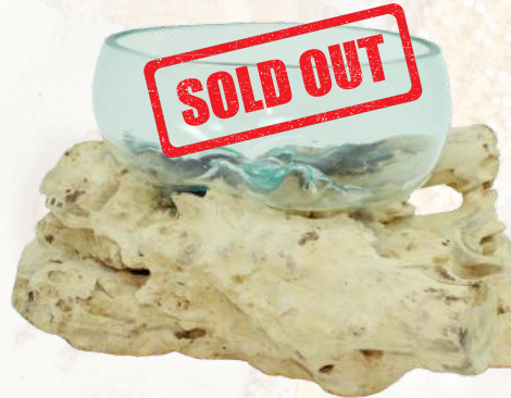
HA0798 9.8" DIA.