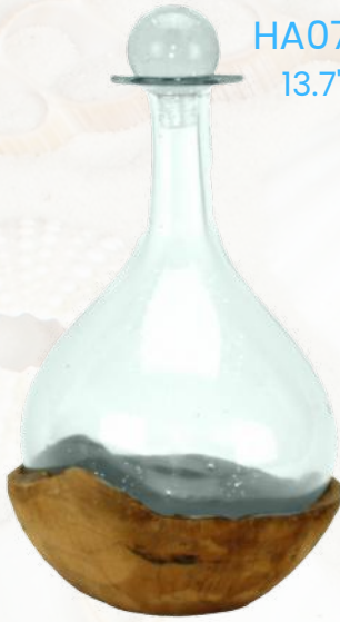
HA07006 13.7" HT