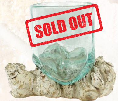
HA0799 5.9" HT