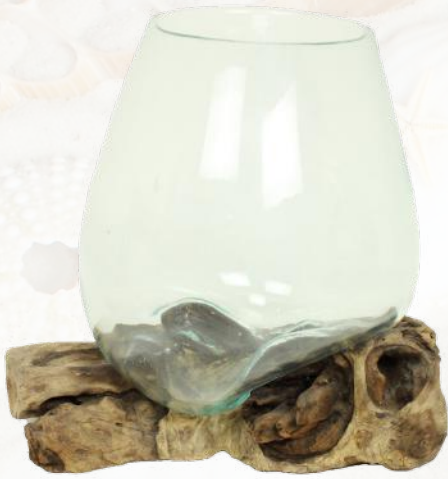
HA0794 9"X7.4" HT