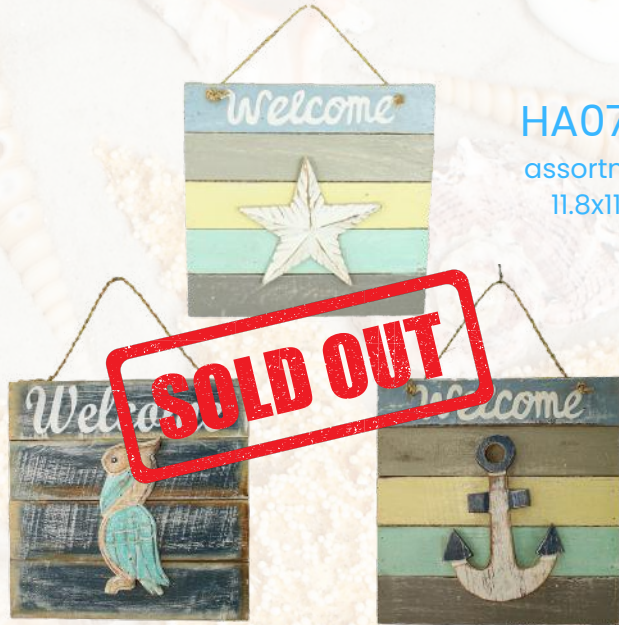
HA0759 assortment 11.8x11.8"