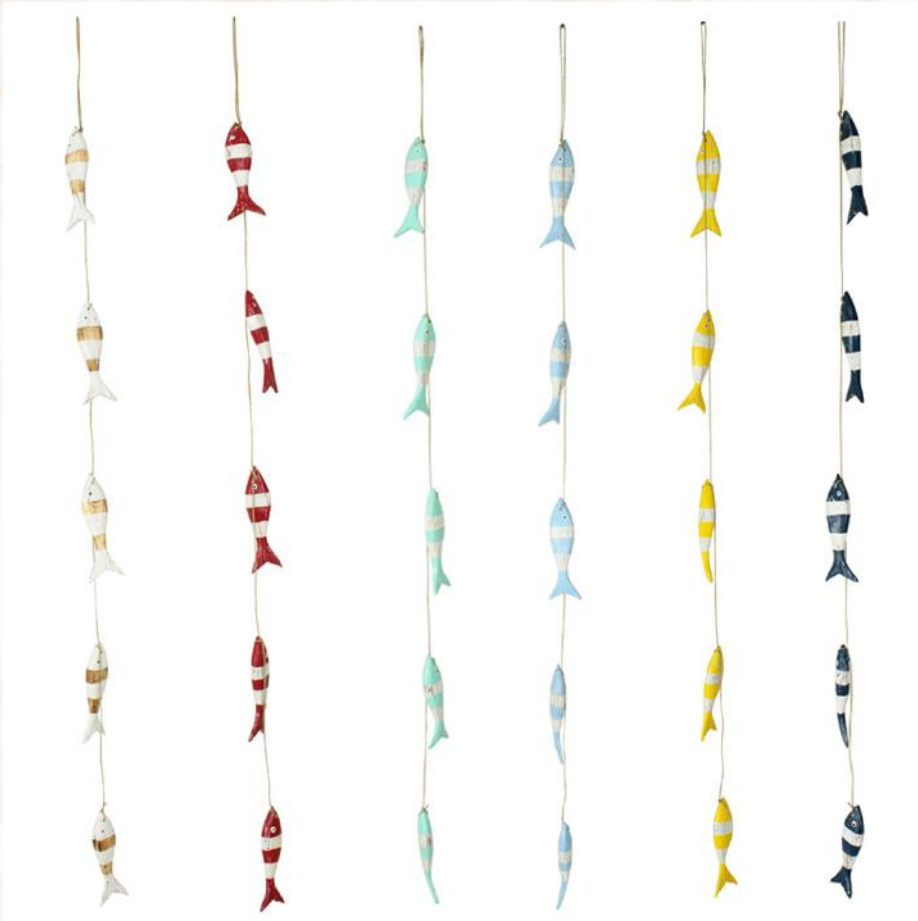
47" long per strand