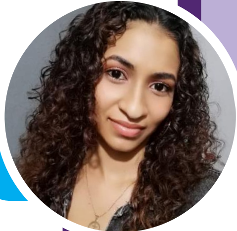
Customer Service Representative