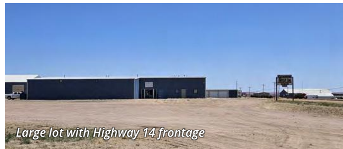
Large lot with Highway 14 frontage