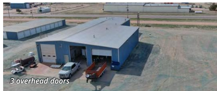
3 overhead doors