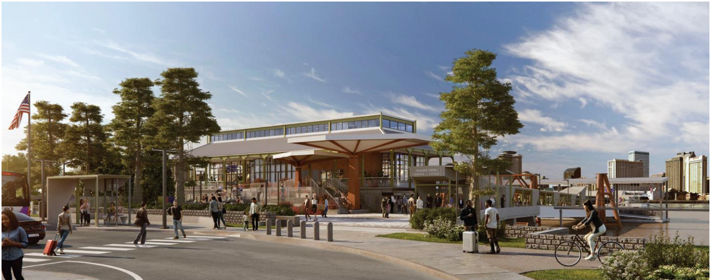
Rendering of redesign of the Algiers terminal