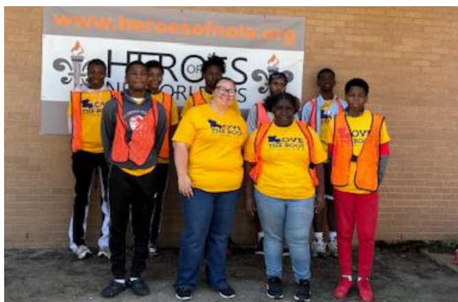
Heroes of New Orleans volunteered for the 2025 Love the Boot clean up event.

* Business membership of $100 includes exclusive benefits. OAMSC is a 501c3 non-profit organization. Tax ID 721334761.