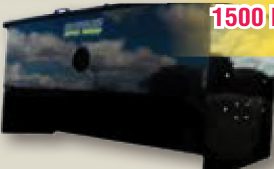
2024 Crownline Feeder Available In 3 Sizes 1,000 Lb., 1,500 Lb., 2,000 Lb.

$2,542 1500 Lb. Manual Chute $3,215 1500 Lb. Auto Chute