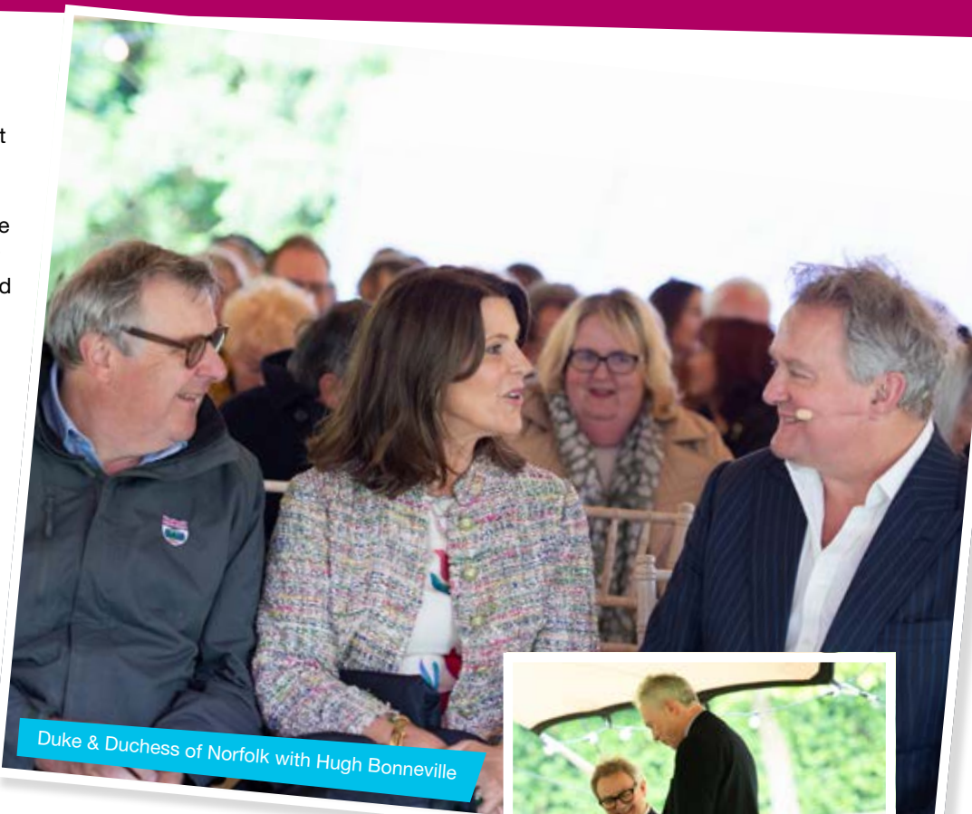
Duke & Duchess of Norfolk with Hugh Bonneville