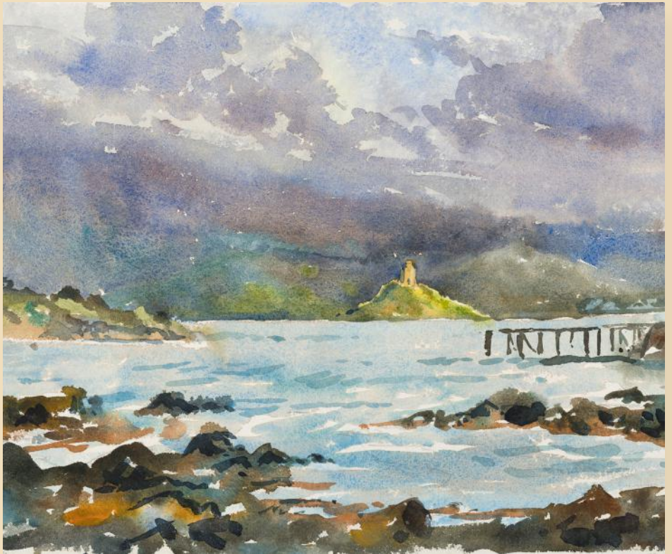
Solas an Caol