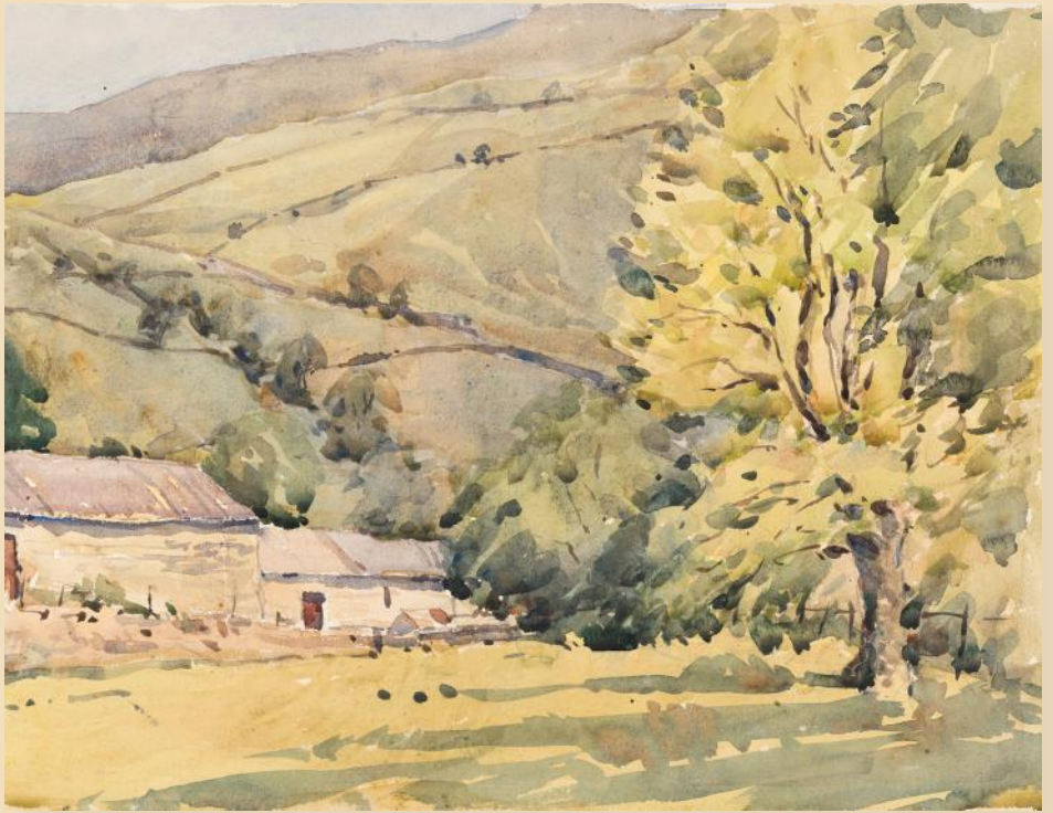
Farmstead in the Hills