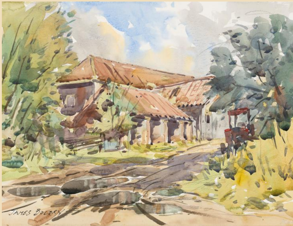
Sunshine After Rain