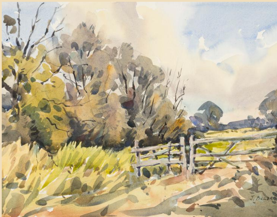
The Gateway to Spring