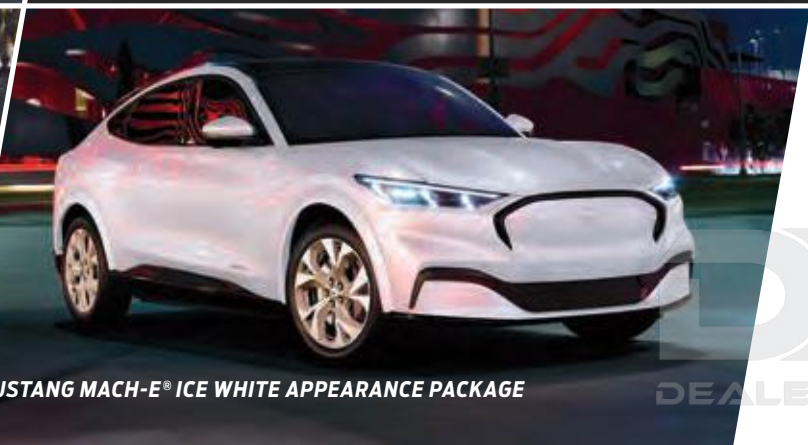
MUSTANG MACH-E® ICE WHITE APPEARANCE PACKAGE