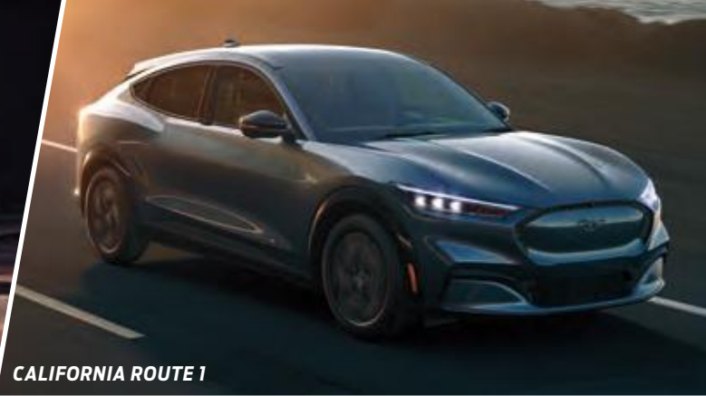
CALIFORNIA ROUTE 1