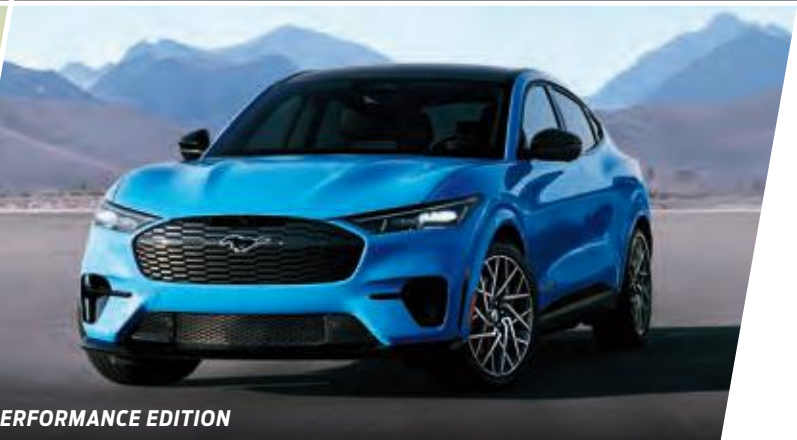
GT PERFORMANCE EDITION