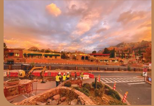
- AMARA LANE PROJECT