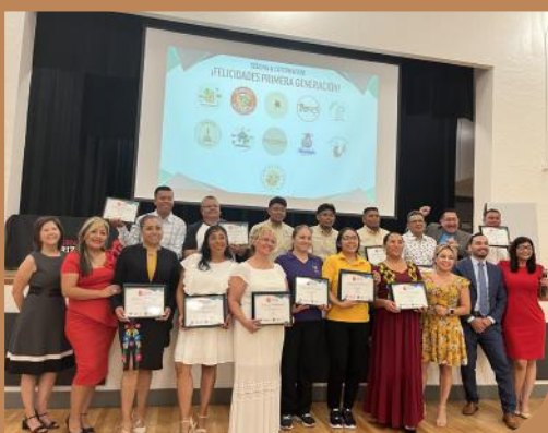
- FUERZA LOCAL COHORT GRADUATES

At the beginning of the year, the future looked bright for bringing broadband to Sedona as part of the Yavapai County Final Mile Broadband Initiative but then provider Optimum informed the City the project will not include Sedona. However, we are committed to continuing to look for ways to improve broadband access and partner with internet providers in 2023. In 2022, the department hosted over 20 Spanish-speaking entrepreneurs at the first and second cohorts of Fuerza Local, an accelerator course that gives personalized training to assist Spanish-speaking businesses. The third cohort will open for registration in January 2023. Last, we convened a citizen work group to inform the city of potential recommendations for improving the quality and access to local healthcare and will continue this conversation into 2023. Healthcare is and will remain a targeted industry for the city's economic diversification and residents' quality of life.