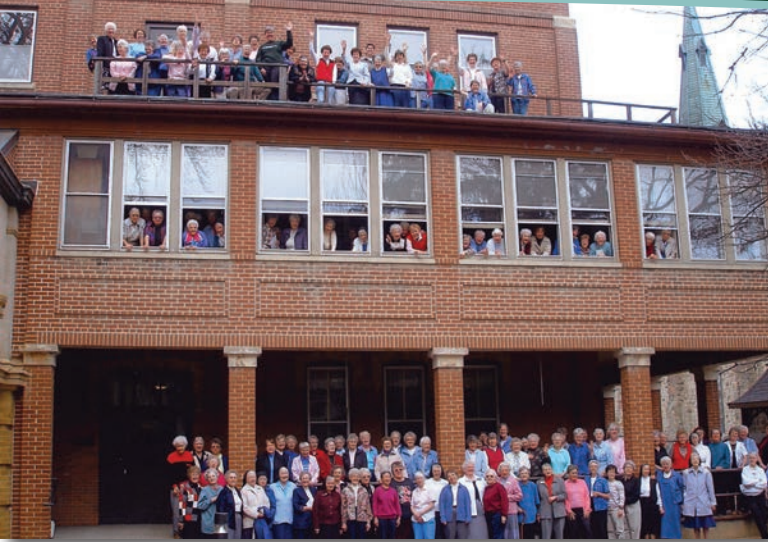
Sisters celebrate the new Marmion building

By the early 1990s, there were at least 13 task teams and ad hoc groups studying and discussing aspects of community life and the need for changes in direction. Among these task teams were Buildings and Renovations, Global Awareness, Library Resources, Liturgy Revisions and Lifelong Formation. Flow charts became a staple during these years! In 1990-91, “Core Issues of Our Monastic Life” surfaced as a focal point, and areas of community living and outreach were central in future planning. And, in 1994, the Chapter approved a Comprehensive Facilities Plan to zero in on specific projects.