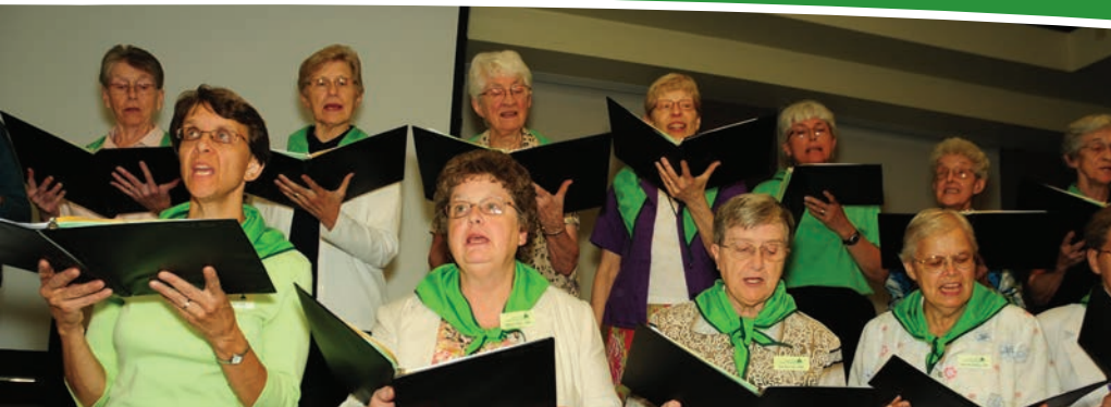
Entertainment performed by the sisters