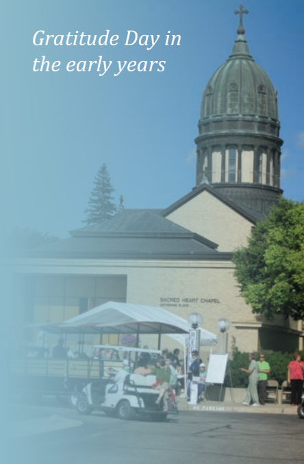
Gratitude Day in the early years

As the size of our community and physical abilities of our sisters changed throughout the years, we knew that we'd likely need to scale back on this event as we moved forward. However, we didn't expect the transition to happen so suddenly.