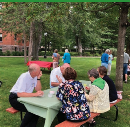
Enjoying our first post-COVID ice cream social