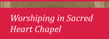
Worshiping in Sacred Heart Chapel