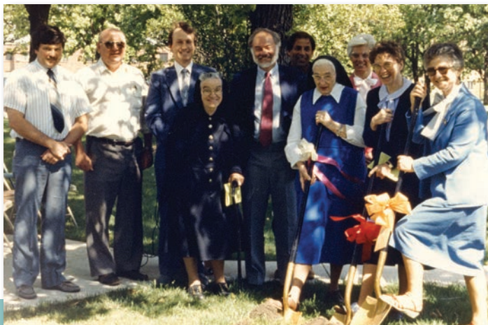
Groundbreaking for the addition at Saint Scholastica Convent in 1987-1988.