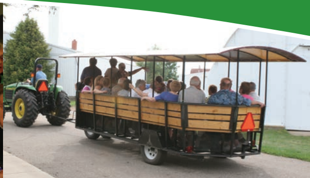
Trolley rides and tours around campus