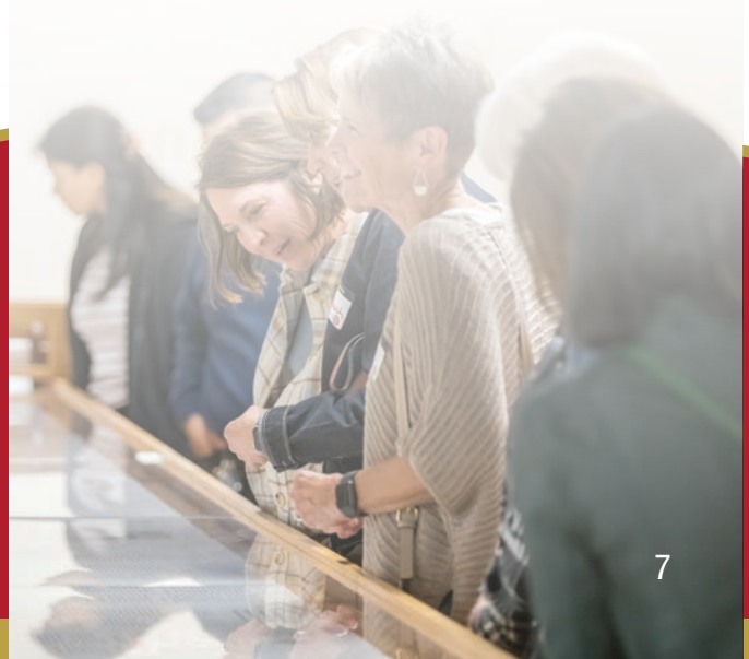
Admiring the Scroll

View the entire discussion at https://youtu.be/YL-fNT7gQJE?si=irzKQ48kNbF9L_fB .