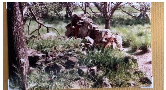
Original "Barwon Park" Ruins Dining Room fire place Nov 1981