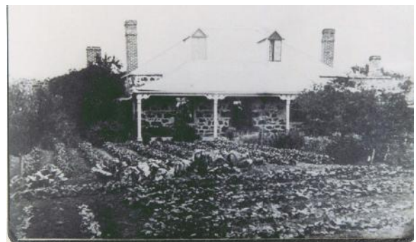
Original Barwon Park Homestead