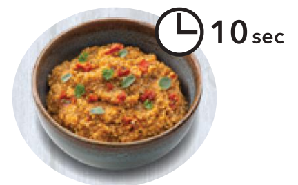
Quinoa & Couscous