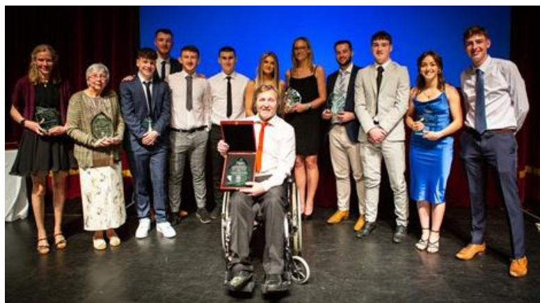
IOM Sports Awards Winners 2022

Nominate them to attend our Volunteer Celebration and Acknowledgement event at the Sports Awards! If you would like to nominate someone to attend this event to celebrate their commitment as a volunteer to their sport, please email sportsliaison@gov.im with your nomination, their contact details and reasons for nomination.