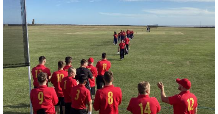
IOM Mens National Team win the Series

We played in Guernsey in 2020 during the COVID pandemic thanks to the travel bridge, then in Cyprus in 2021 and Spain in 2022 which gave us an idea of what was required to host. The facilities at King Williams college sit as one of the best in the associate countries so when Austria approached us to see if we could host them we decided to take the plunge. Austria had qualified for the second phase of 2024 world cup qualifying in Scotland so wanted to compete on grass in similar conditions to what they would experience in Scotland (cold and wet) and the weather didn't let us down!