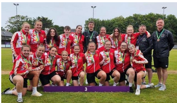
IOMFA Women's National Team take Bronze!