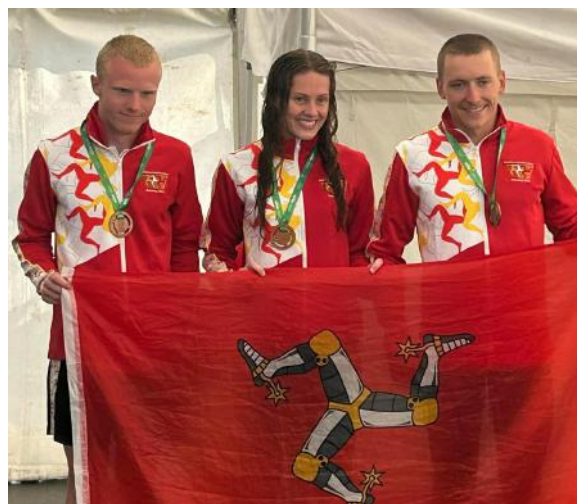
Bronze medals for the IOM Triathlon Relay Team!