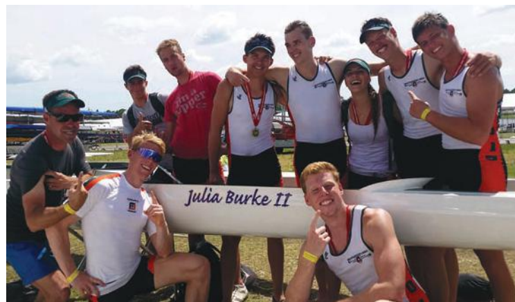
Oakland Strokes Varsity Men's 8+ Crew after rowing the Julia Burke II to gold medal victory!

U.S. Rowing Southwest Youth Championship. Oakland Strokes' indomitable Men's JV 8+ crew concluded their 2014-15 southwest regional season undefeated and hold the incandescent Julia Burke Memorial Trophy especially high. The last time Oakland Strokes won both the Men's Varsity 8+ and JV 8+ at the Southwest Youth