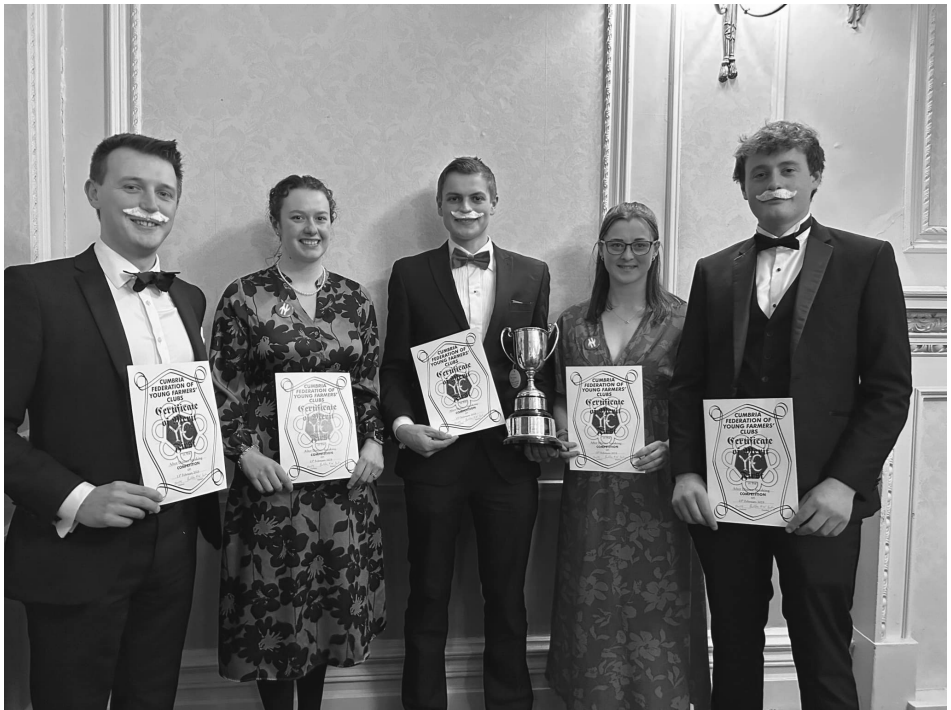
Lowick YFC's winning After Dinner Speaking team